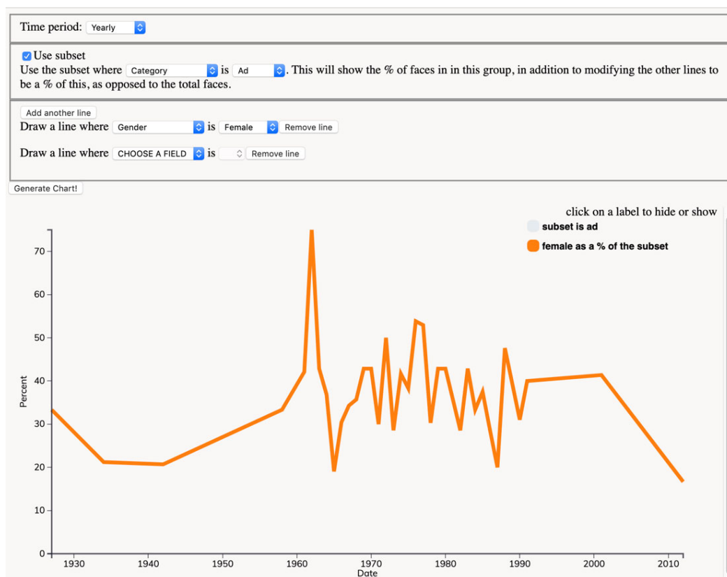
Figure 4. Screenshot showing the percentage of faces that are tagged female out of faces that are tagged as being within advertisements.