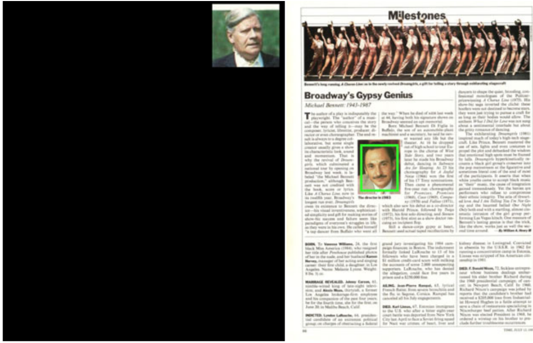
Figure 3. Left: The context-free version of the interface shows workers only the face to be annotated. Right: The default version of the interface shows the full page with the face in question outlined in green.