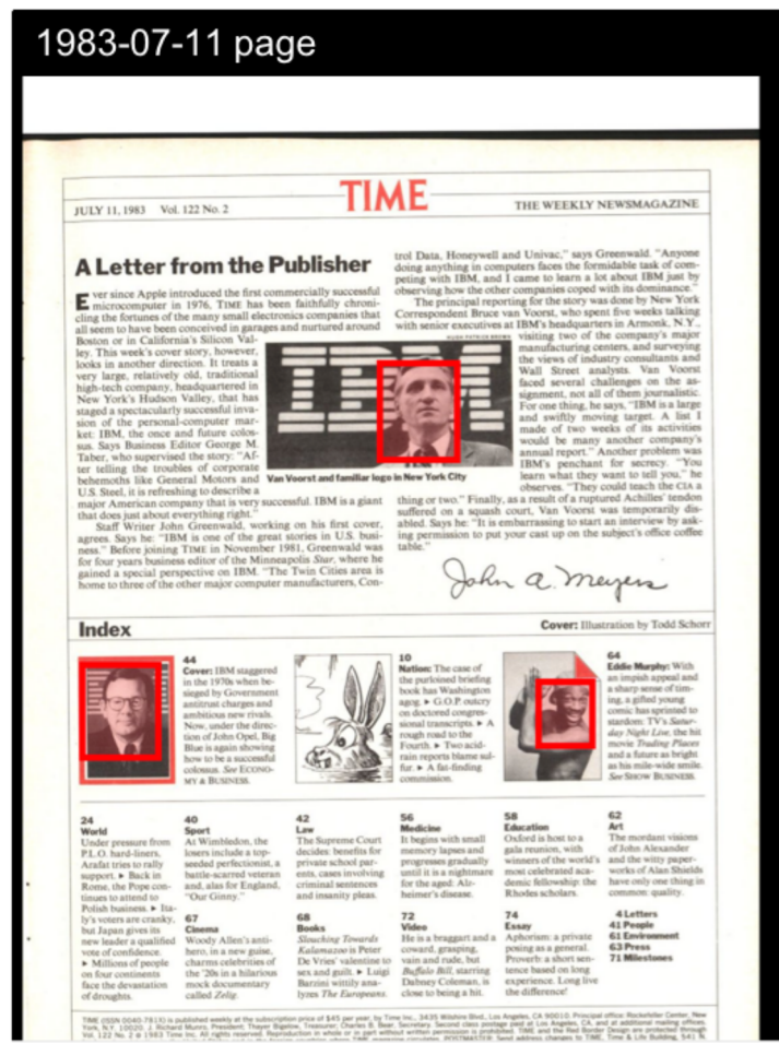
Figure 2. Screenshot of a page within our in-house review interface. Selections cropped by workers are outlined with a red rectangle.

To facilitate the further inspection of AMT workers with a high number of flags, an easy-to-use, in-house review interface was built (Figure 2). On a single webpage, this interface displayed all of the magazine pages assigned to any worker, along with frames around the image areas that the worker selected for cropping. Using this interface, project personnel were able to rapidly scroll through the pages, inspect the work, and make note of pages with mistaken crops or faces left uncropped. If a worker had errors on more than half of their pages, then payment was not provided and all pages in their job were re-analyzed. We paid all other workers but used our revision process to identify pages with egregious errors, which were returned to the pool to have their analysis redone.