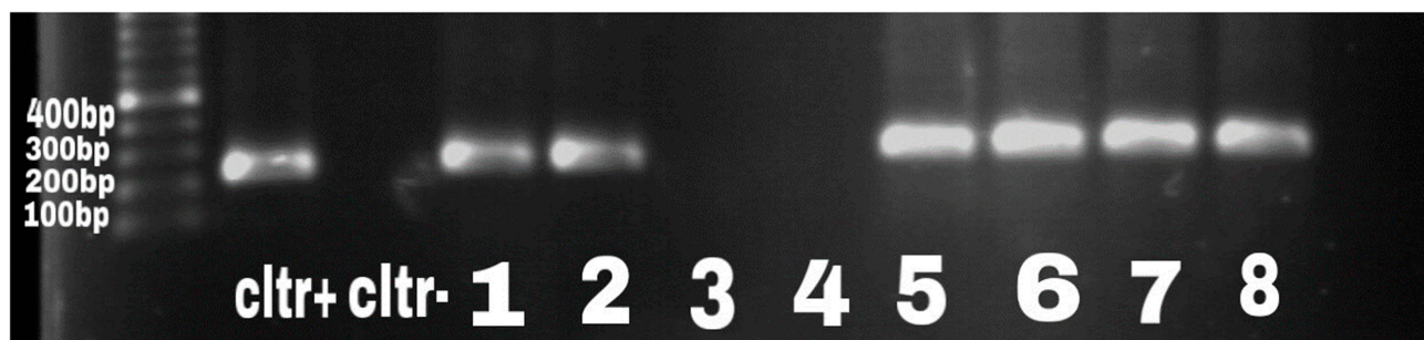
Figure 1 Gel electrophoresis for PA431C gene to determine the prevalence of P. aeruginosa . The band size was 232 bp. Samples 5–8 were positive, whereas 3 and 4 were negative clinical samples.

RUT was used to confirm H. pylori biochemically. We included the samples positive for both glmM PCR and RUT in our first group ( H. pylori positive). For the second group, we included only the samples that were negative for both RUT and glmM PCR.