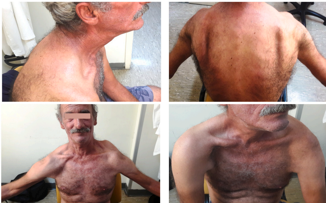
Fig. 3. Photos of the patient #15 showing muscle atrophy in the shoulder girdle and the lower half of the facial musculature. WES testing identified the p.Thr57fs*2 (c.170delC) change in the MYOT gene, suggesting the diagnosis of myotilinopathy.

(c.850C>T) pathogenic variants in the SGCA gene.