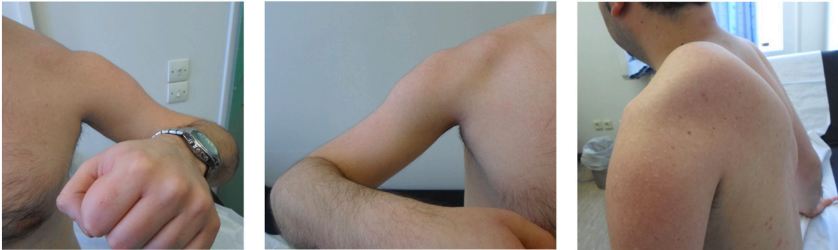
Fig. 1. Photos of the upper extremities of patient #2, showing marked atrophy of the proximal muscles and scapular winging. This patient and his similarly affected brother were found to harbor both the p.Tyr537* change and the deletion of exons 2 to 8 in the CAPN3 gene in compound heterozygosity.