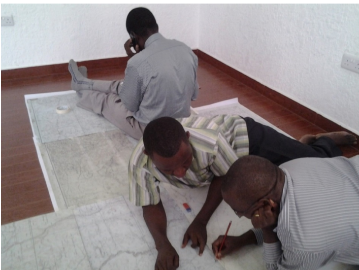
Photo 2: Teams also use phones to consult colleagues on stock routes

The first task for each team will be to locate the main stock routes, shared pasture areas, markets, infrastructure and conflict hotspots, and then classify them. At this stage, the exercise will be done using pencil. The participants will use stickers to locate markets, water points and other features on the base map. Each team will also have to write detailed notes about the stock routes and other features mapped.