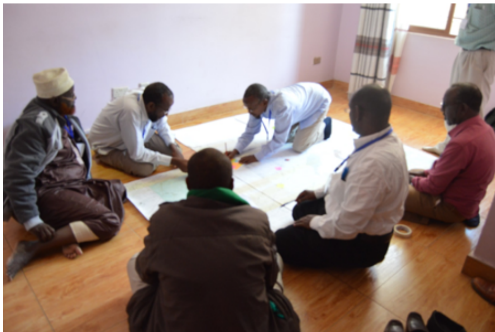
Photo 1: Mapping team discussing the codes and searching for stock routes on the maps