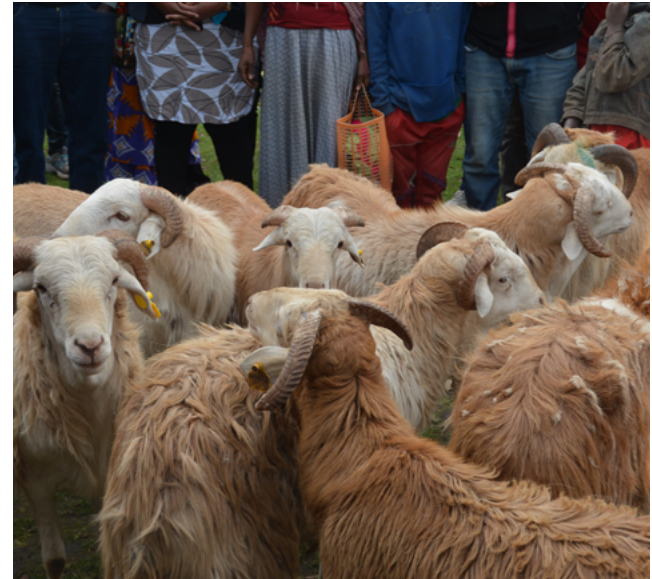
Sheep commonly kept in SNNPR

It gives farmers tools and a pathway to make their social so operations and livelihoods more productive and econom resilient in the face of climate change while also security helping reduce their climate impacts. It integrates the three dimensions of sustainable development— of climate