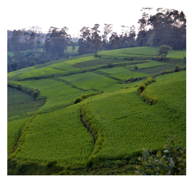
Farm landscape in SNNPR