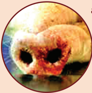
If you see bloody froth in nose

How you can suspect a pig suffering from ASF?