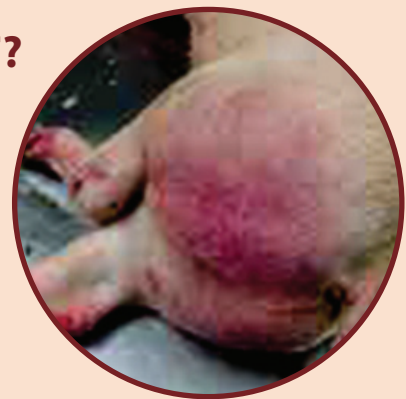
If you see red patches on the skin of ears, abdomen, chest, tail and hind legs which, later on, may turn blue-violet