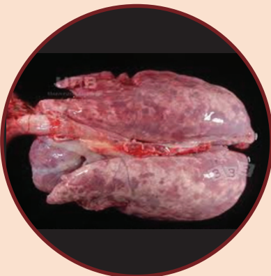
If you see lungs filled with fluid.