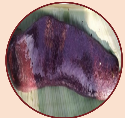
If you see enlarged spleen with fragile condition

If you find pig with high fever (41 o -42 o C); If you see pig with difficult breathing with diarrhoea and vomiting (may be mixed with blood/mucus).