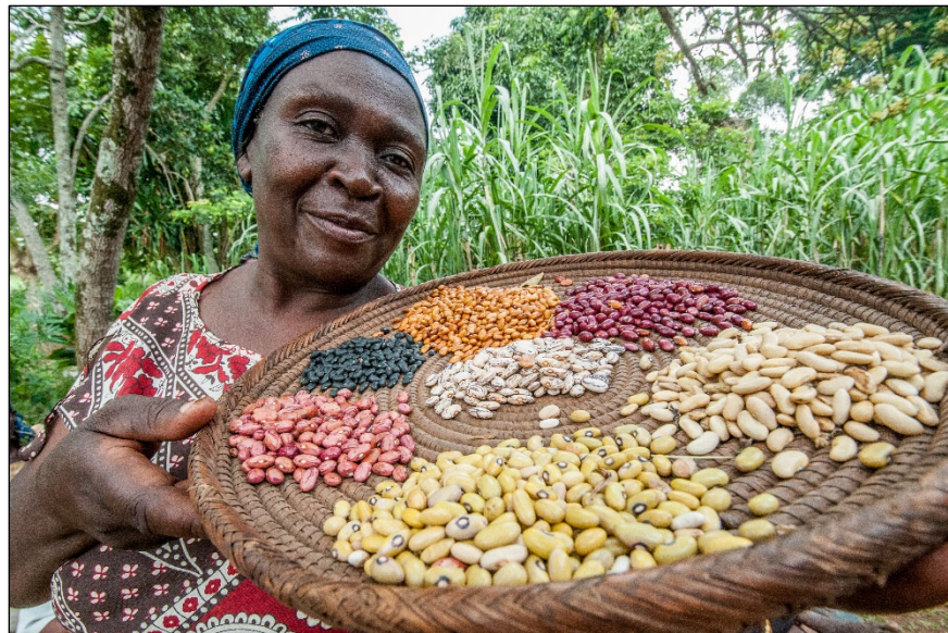
Figure 1. Diverse Common Bean Grown by Smallholder Women Farmers in Uganda, Africa

This commentary is based on survey data collected from six countries in the eastern African bean corridor per the Pan African Bean Research Alliance (PABRA) classification: Kenya, Uganda, Tanzania, Burundi, and the Democratic Republic of Congo (DRC). Governments have been implementing multiple public health policies with varying degrees of strictness since March, when the region first started reporting cases of the coronavirus. Kenya and Uganda, guided by their respective constitutions and public health policies, responded expeditiously. For instance, Kenya imposed absolute restrictions on movement from four high-risk counties, a partial lockdown by declaring a dusk-to-dawn curfew, and closed its borders to only allow essential movements. The Ugandan government declared a lockdown in March, banned transport within the country, closed its borders, and imposed stay-at-home orders. In