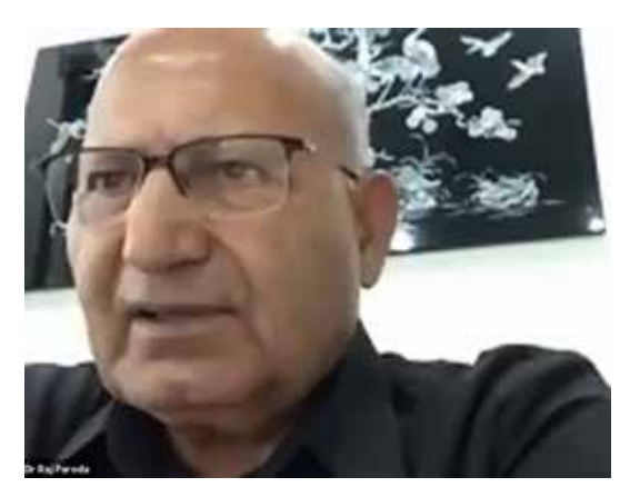
Dr R.S. Paroda

meeting on ABS had been organized by ISPGR in 2016 on the topic 'ABS-Striking the Right Balance'. He said that during the early 20th century, PGR was considered as heritage of humankind and freely available for exchange. By the late 1990s and early 2000, treaties like CBD brought in the issue of sovereignty leading to some restrictions. India brought in a sui generis system of protection for genetic resources, which included farmers' rights. He affirmed that currently regulations for access to