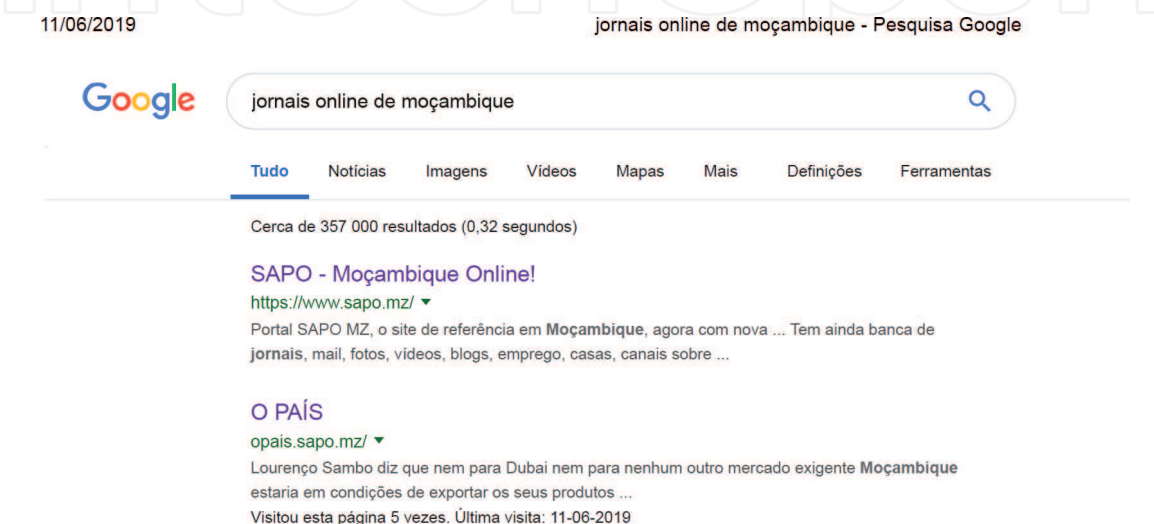
Figure 2. Google search page showing results for “jornais online de Moçambique.”

The search excluded non-press sites (e.g., streaming services, personal blogs, or social media), unreliable, sensationalist, or suspicious sources due to lack of elements of evidence traceability such as author's identity (corporate were included),