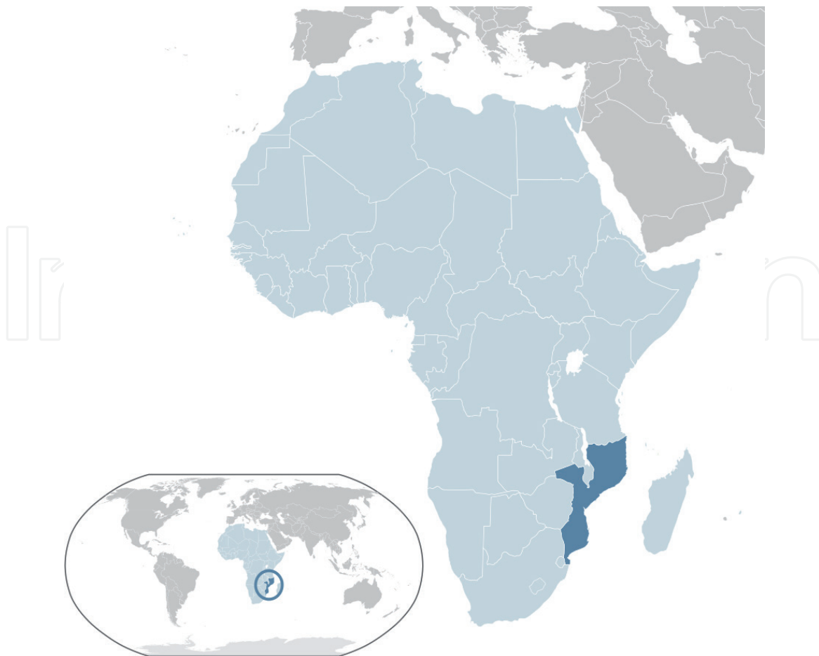
Figure 1. Location of Mozambique in Africa and the world.

Another critical feature in Mozambique is its predominantly agricultural economy. Most people in Mozambique live in rural areas, and agriculture plays a crucial role in the Mozambican economy as a source of food for most of the population and a source of income for about 70% of the population [25]. Some cash crops are groundnuts and maize, both susceptible to aflatoxin contamination [4]. According to Abbas [26], food insecurity is more significant in rural areas compared to urban areas due to some factors that occur in cities such as (1) obtaining higher monetary income, (2) subsidized prices of essential goods, (3) greater availability of food due to imports, and (4) more diverse diets. With limited research output and capacity to screen food for aflatoxins, Mozambique should at least spread awareness. The online mainstream press and media are perhaps a good alternative for the highly costly traditional awareness campaigns.