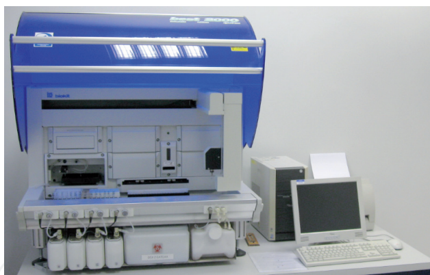
Figure 2. Fully automated Elisa analyser.

The different available types of ELISAs provide a reliable means for screening oral fluid. In general these work adequately for amphetamines [29], buprenorphine, cocaine [30], methadone [31], and other opioids [32]. Cannabis may pose more difficulties, particularly if the immunoassay has little cross-reactivity to tetrahydrocannabinol (THC), the main psychoactive component of the drug. Even so, enzyme immunoassay has been successfully used for cannabis; the same applies to benzodiazepines despite their low oral fluid concentrations [33].