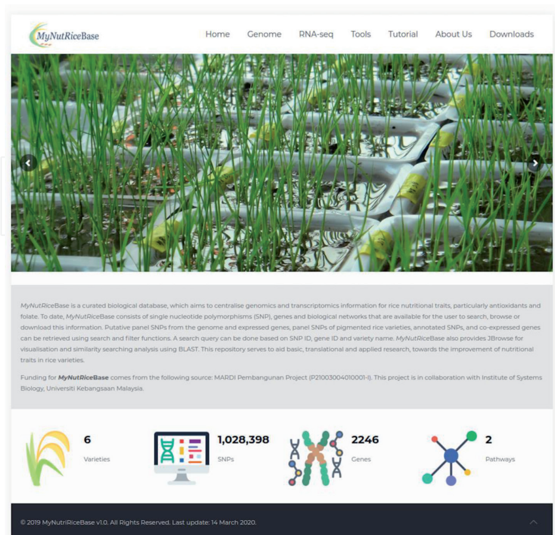
Figure 2. The homepage of MyNutRiceBase ( http://www.mynutricebase.org ).

database [74], SNP databases [53, 54, 78] and pathway databases [75, 76]. Each of these databases have their uniqueness and specific target users.