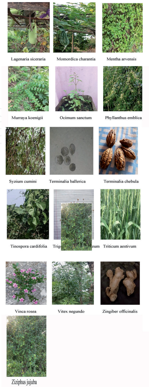
Figure 2. Plants used traditionally for the treatment of diabetes.

by day, it is mandatory preserve the information's about the knowledge of folk-lore medicinal plants which is use by local communities before it is permanently disappear.