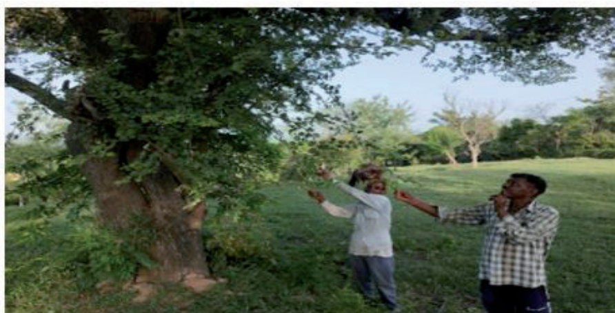
Figure 1. Field survey.

In order to document the record frequent field surveys were conducted many times ( Figure 1 ). A questionnaire contains the details of the plants, parts used, medicinal uses and mode of preparation of remedies is structured and informal talks were employed to gain the information about the use of plants as Antidiabetic. Any statistical survey is not used in the given study.