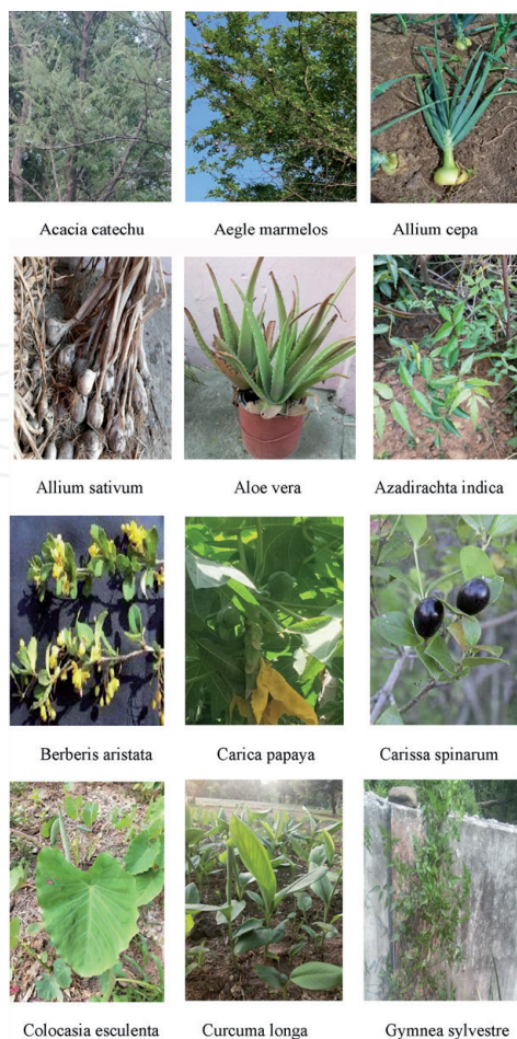
Table 1. Antidiabetic plants recorded from Nadaun, Hamirpur District.