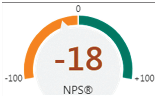
Figure 2: Satisfaction of HWs with the quality of the personal protective equipment at their workplace (in relative numbers)

The data in Figure 1 demonstrates that more HWs were not satisfied than satisfied with the availability of the PPE at the workplace. Concerning HWs' satisfaction with the quality of the PPE at their workplace, 168 (30%) were promoters (satisfied), 124 (22.1%) were passives (neutral), and 268 (47.9%) were detractors (not satisfied). Graphical representation could be found in Figure 2.