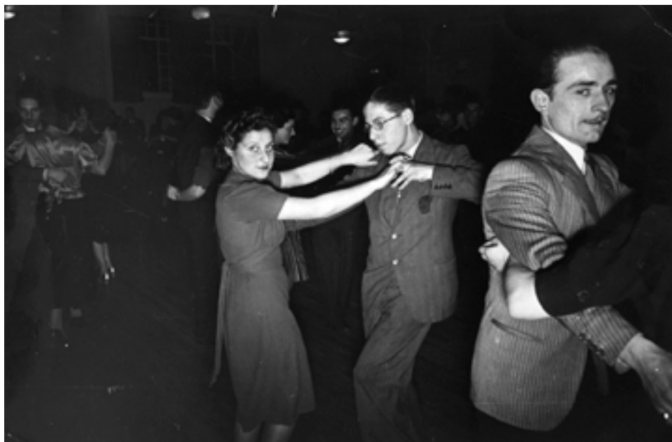
Figure 24 'Saturday Evening in a Dance Hall', from 'Whitechapel', Picture Post , 15 October 1938, p. 28.

This ability to appear well dressed provides an interesting contrast with the environment in which the wearers moved. Cameron believed that 'the meanest street in Whitechapel