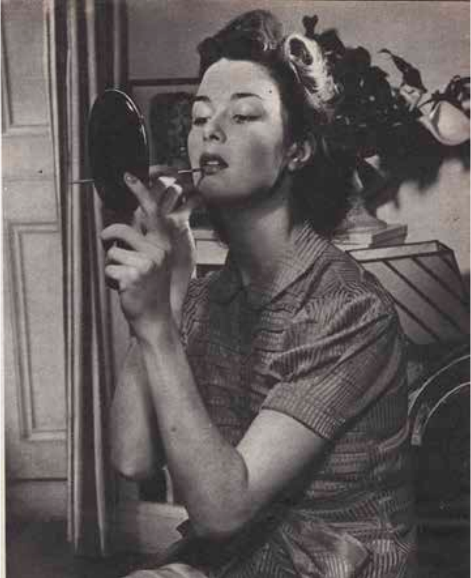
Figure 41 'A Brush Saves Lipstick. You will use less lipstick – if you paint it on! The clear-cut line makes your mouth look just as definite with less actual colour. Any small paint-brush does the trick'. 'Make Up and Cut Down', Picture Post, 15 March 1941, p. 32.

the remainder of the war, up-pointing or down-pointing items in line with scarcity or glut, the number of coupons would, however, decrease over the same period as materials and labour were absorbed by the demands of war. 8