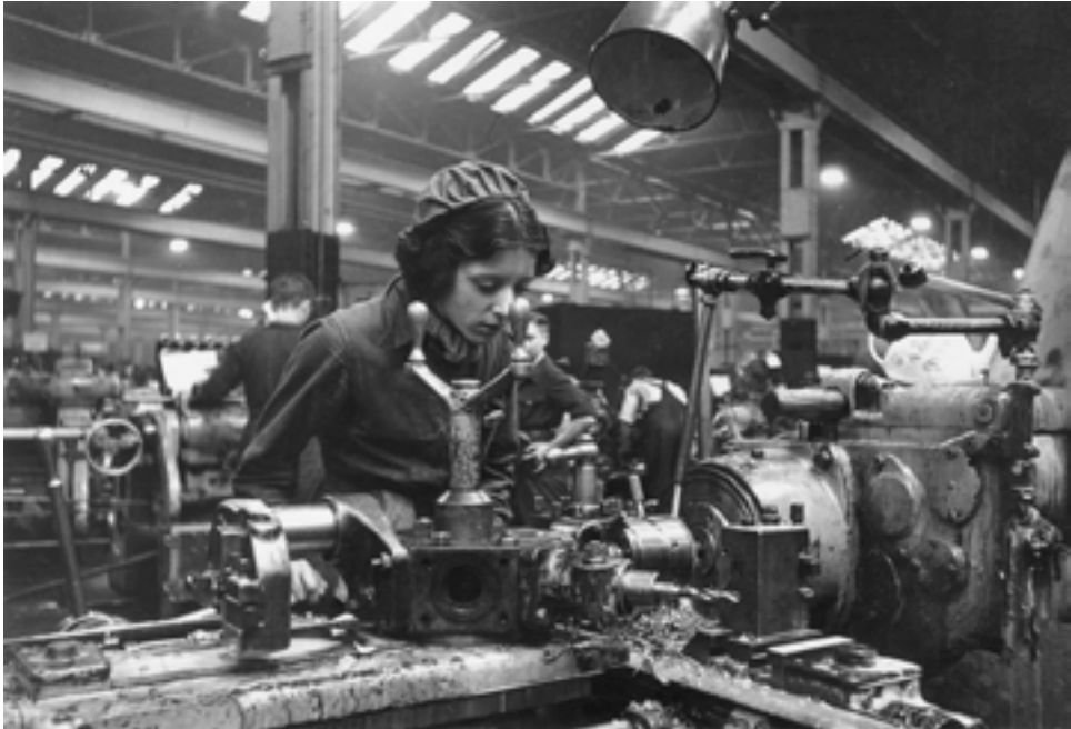
Figure 30 'The Girl Who Has Taken Her Place in the War Machine', 'They Make The Guns We Need', Picture Post, 5 July 1941, p. 24. 10.

The overall, along with trousers, the boiler suit and dungarees all contributed to the fashioning of an alternative female identity, one now doing 'a real man's job' 11 whether working a milling machine or helping build a new plane. While these images are almost taken for granted today they remain significant as a visual record of how many women – from all classes and backgrounds – took on blue-collar employment, often in tandem with existing home and family responsibilities.