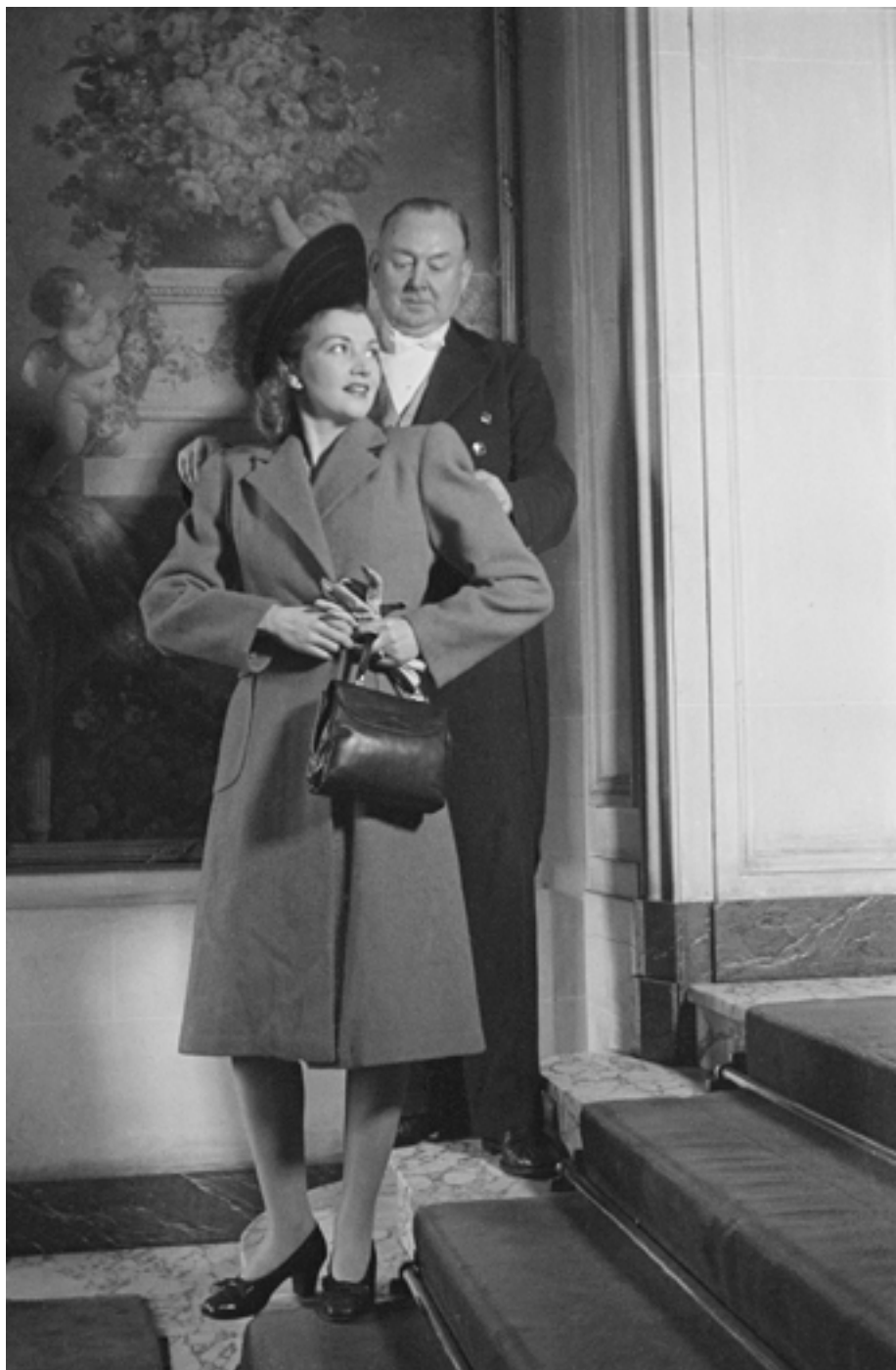
Figure 74 'The Unbelted Coat. A bright red coat has a tailored line, a minimum of trimming. Dereta Utility from Fenwick; £4; 18 coupons'. 'Some Clothes for Your New Coupons', Picture Post, 26 February 1944, p. 22.