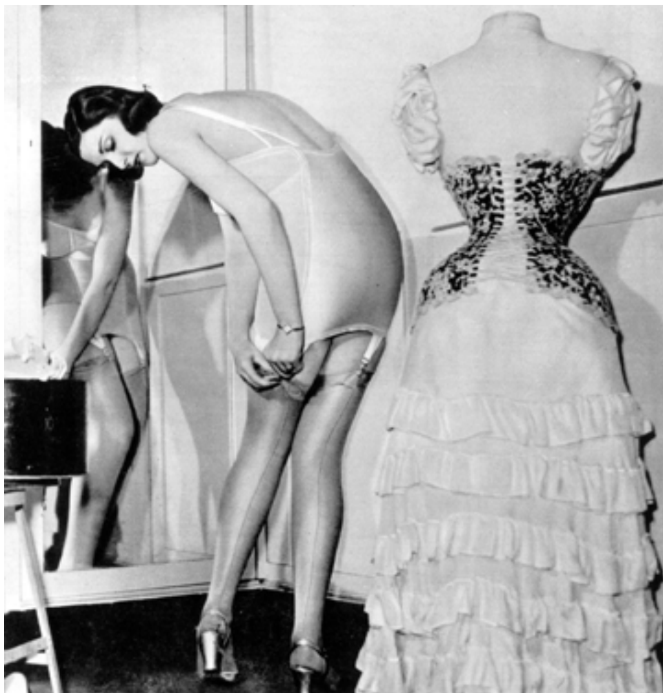
Figure 10 'Setting the Styles for the Modern Corset-Making Industry'. From 'The History of the Corset', Picture Post , 1 October 1938, p. 15.

The other factor to emerge in this Picture Post article was that the silhouettes defined by these restrictive garments over the centuries could express particular meanings about the social role of the wearer. British fashion historian James Laver's historical review explored the idea that a metaphorical relationship existed between the deliberate restrictions of women's dress and their similarly restricted social context, raising the important idea that clothes carried specific cultural meanings. 22 If, for example, the wider hip line of Victorian dress implied the desire and capacity for childbirth, did the more slender hip currently fashionable have a connection with the falling birth rate in Britain? 23 Laver left the reader to consider this concluding thought.