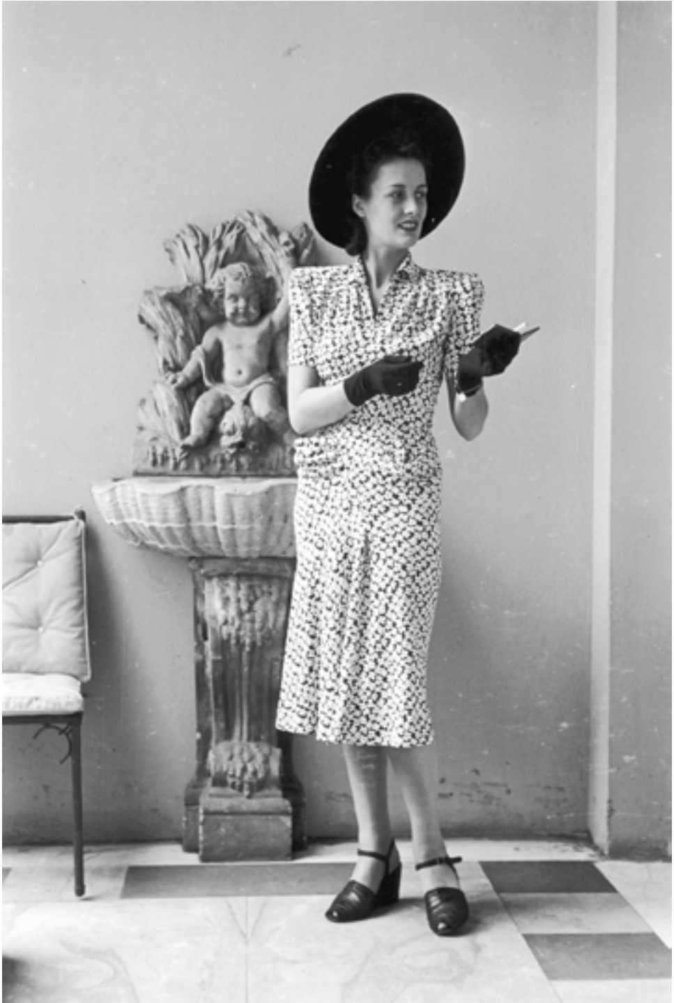
Figure 50 'Daytime Parties. Formal parties don't exist. A short print frock (from Rhavis) is the dressiest kind made.' 'Austerity Clothes for the Fourth Year of the War', Picture Post , 29 August 1942, p. 23. Felix Man/ Picture Post /Getty Images (2696616).