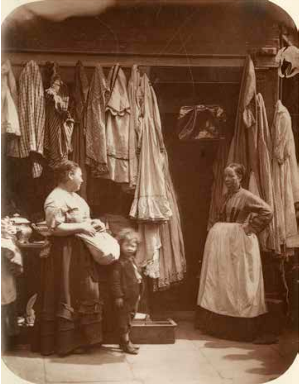
Figure 3 'Old Clothes Shop' from Street Life in London , John Thomson and Adolphe Smith, 1877. 'A second-hand clothes shop in a narrow thoroughfare of St. Giles . . . It is here that the poorest inhabitants of a district, renowned for its poverty, both buy and sell their clothes.'

The potential for photography to engage attention at both an intuitive and intellectual level made it an invaluable partner to documentary of any form. Photographs were increasingly creating awareness of how others lived and opening up new perspectives on social