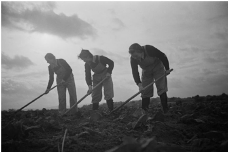
Figure 62 ‘A Good Spring Crop Needs Autumn Hoeing. Fields of spring greens must be hoed before the frosts. “Bend right down to it” is the farmer’s advice’, Picture Post, 29 November 1941, p. 19.