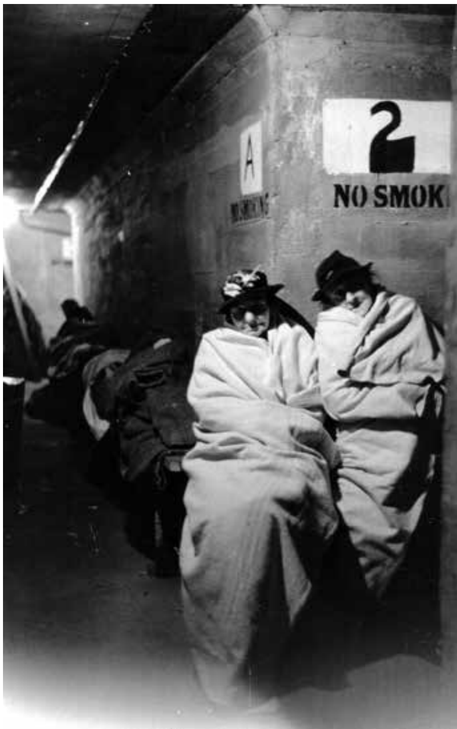
Figure 37 'Here One Must Sleep Sitting Up', from 'Shelter Life', Picture Post , 26 October 1940, p. 9.