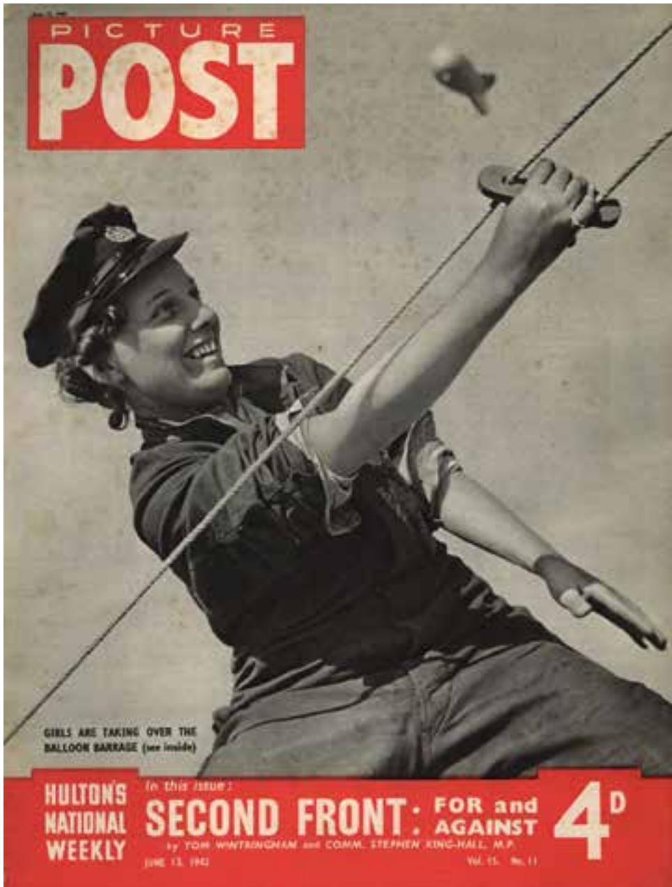
Figure 64 'Girls Are Taking Over The Balloon Barrage', Picture Post , 13 June 1942.

Head saw ATS girls now being drilled alongside male soldiers and becoming 'hardened to wind and weather' as they worked their instruments on the gun sites. Here were 'cool, precise, alert' women trained to be reliable and quick, performing work without which the gun sites could not operate. 25