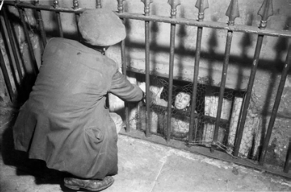
Figure 28 'After a Whole Day Looking for a Job, Alfred Smith Comes Home'. Picture Post , 21 January 1939, p. 18.

These pictures can't reveal either the quality or durability of the clothing worn. They reflected, nevertheless, a family doing what it could, in terms of warm and sufficient clothing for winter, particularly given three out of the four children were not in good health. Mrs Smith was photographed browsing a market stall for 'cheap oddments – a pair of stockings for Frances, some shoes for Peter, a scarf for Edna'. 22 A winter blanket for the children's bed was found to be too expensive to buy in a shop rendering the cheaper street stalls the more affordable option.