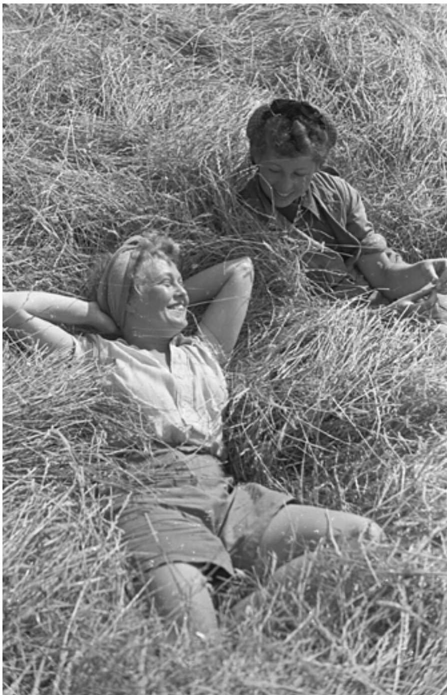
Figure 67 'Day's End in a Farming Camp: English Girl and French Girl Get Together .... [They] regularly spend spare time on the land. People who go once in a life-time are welcome, but less useful.' From 'Off-Duty in the Farming Camp', Picture Post , 17 July 1943, p. 22.