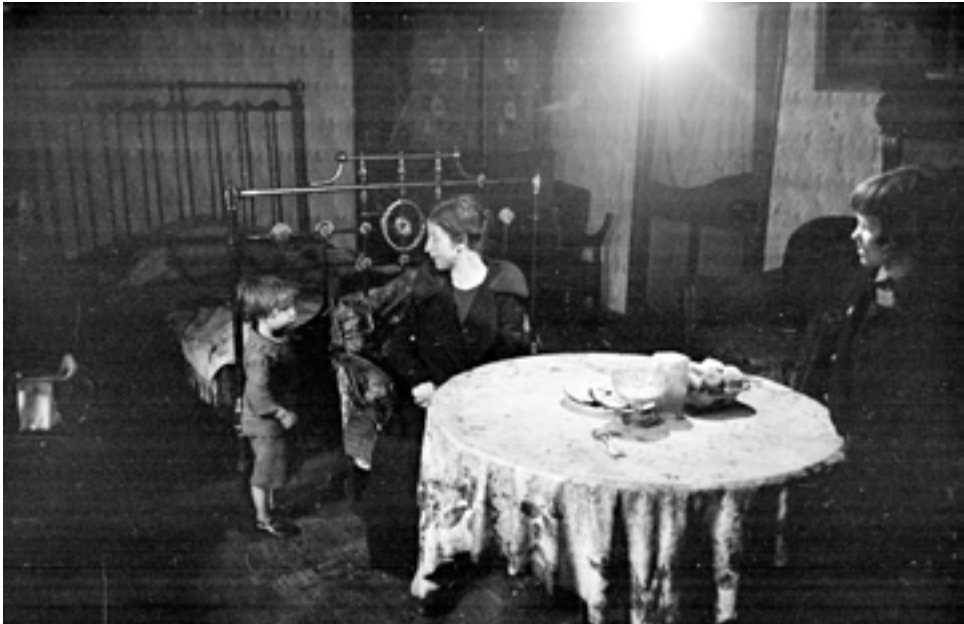
Figure 4 'In the Home of a Tynesider: A penny was produced. It was put in the gas meter. A broken mantle allowed just enough light for the picture to be taken. The room otherwise – a basement room – was permanently dark. The bread and cake on the table was all the food they had. There were other children not in the picture'. From 'Tynesider', Picture Post , 17 December 1938, p. 28.

of the new paper. Recounting the difference between covering a story on Tyneside for both the Mirror newspaper and Picture Post , Spender described how for 'the Mirror , I'd been expected to make the industrial scene picturesque, including unemployment; whereas for Picture Post we were able to produce a feature of realism so harsh that we evoked a strong complaint from the mayor'. 44