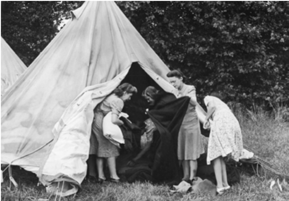
Figure 66 'They Sleep Under Canvas', from 'Holiday Camp for War Workers', Picture Post , 26 September 1942, p. 16.

Menus were planned with guidance from the Ministry of Food and a typical day's meals revealed traditional fare, from breakfast porridge and lunch-time roasts, to