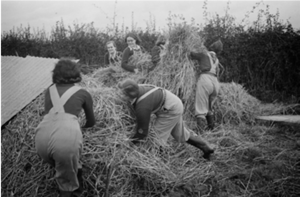
Figure 63 'Land Girls Gather Straw for the Cows', Picture Post, 29 November 1941, p. 19.