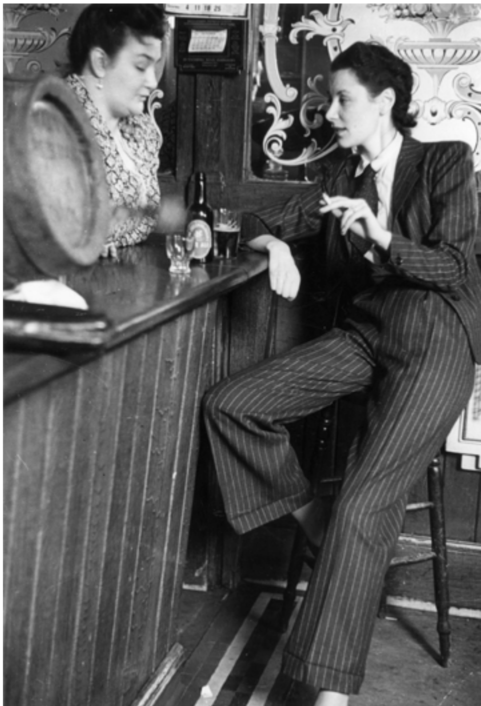
Figure 45 'Should Women Wear Trousers?' 1 November 1941, p. 22. (The image above, available from the Getty Collection, is not the one published in Picture Post but is almost identical. The barmaid's position has shifted slightly in the original which is currently untraceable.)