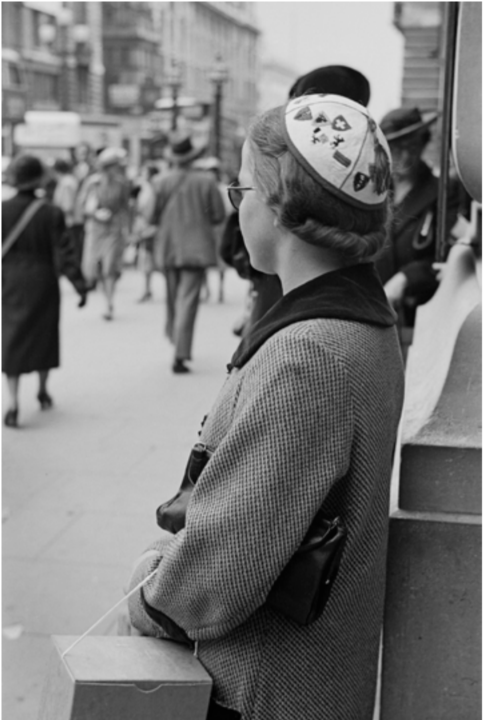
Figure 31 'The First War Fashion. Flags of friendly nations and neutrals on a white skull-cap'. 'Diary of the War: No. 4, The Second Week, The Changed Face of London', Picture Post, 30 September 1939, p. 27.