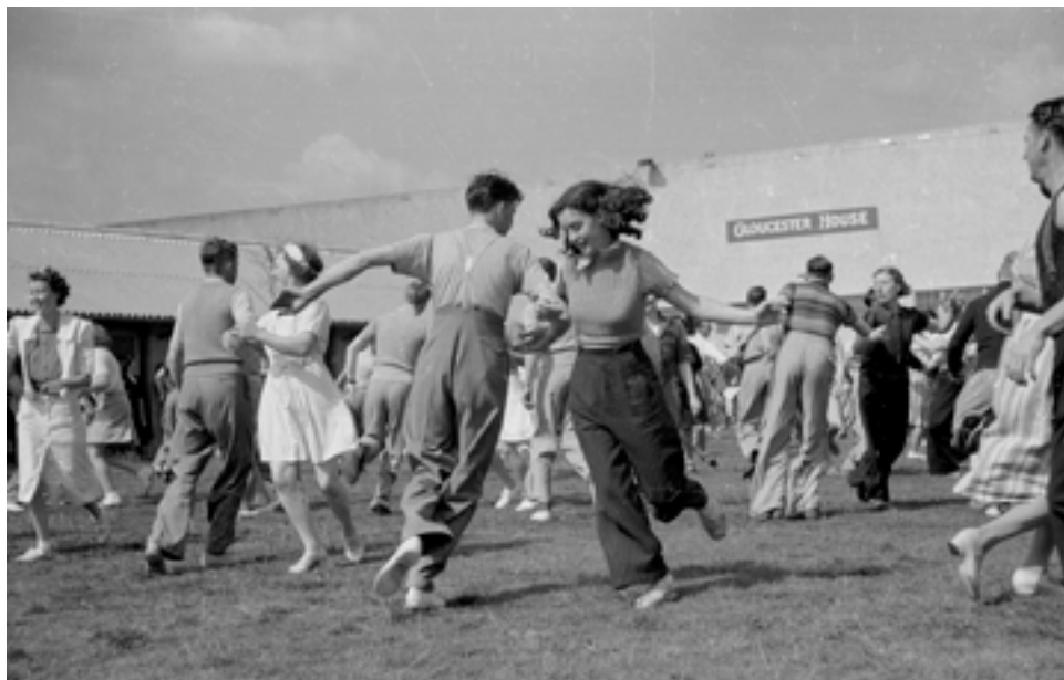
Figure 20 'Dancing on the Greens' from 'Holiday Camp', Picture Post , 5 August 1939, p. 45.

During the summer of 1939, sixty-five thousand people had visited this Butlin's camp, which could cater for four thousand residents at a time. 66 The private chalet-style accommodation and on-site entertainments, including a wide range of organized sports and all-weather activities, were offered for an all-inclusive price of '3 ½ (2 ½ off season) guineas' per adult, with no worry about unforeseen extras. 67 The photo-story captured the vitality and variety which characterized life at the camp and, in the process, the types of clothing chosen by holidaymakers for the day's activities. The range of garments and styles depicted might reasonably be supposed to represent something of what could be bought on the high street, or made at home, at price-points consonant, in general, with a week or fortnight's stay at Butlin's. 68