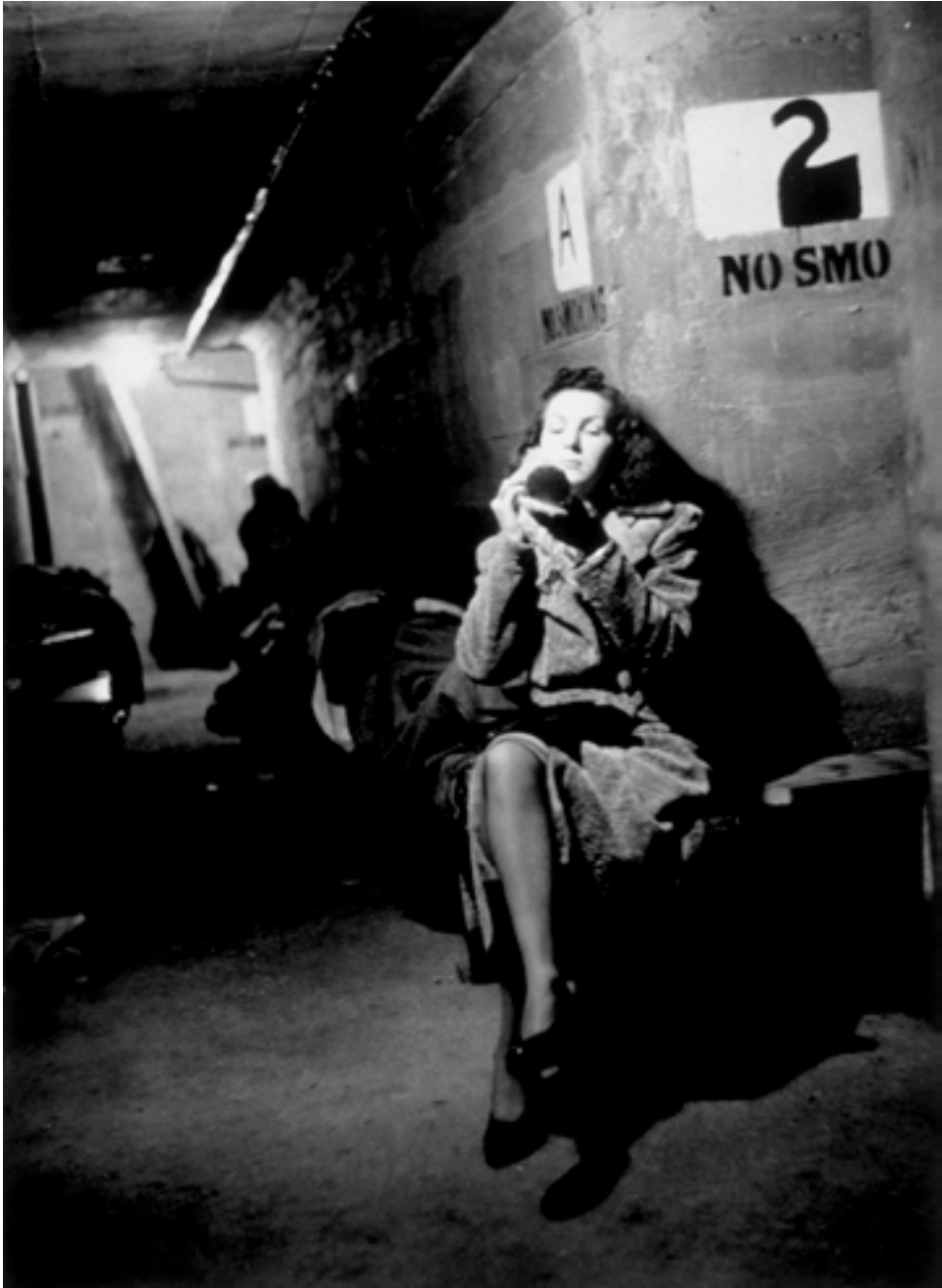
Figure 38 'Here All One's Life Is Public. Privacy, so highly cherished by Britons, is gone. Family life at evening has vanished. Here nothing is intimate. One talks, eats, sleeps, lives, with a hundred, a thousand, others'. From 'Shelter life', Picture Post , 26 October 1940, p. 9. Zoltan Glass/Getty Images (2659776).