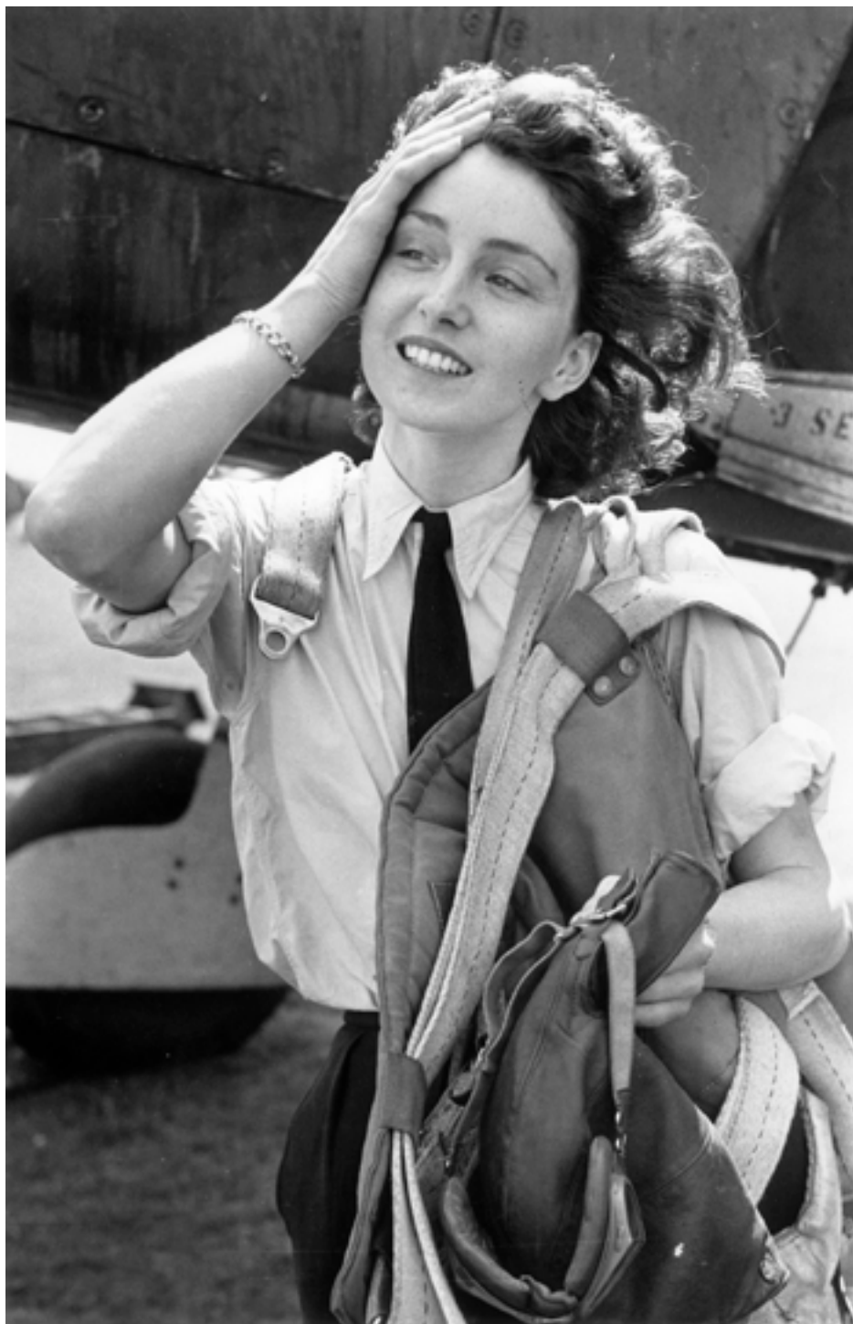
Figure 72 'The Story of the A.T.A.', Picture Post , 16 September 1944, front cover.