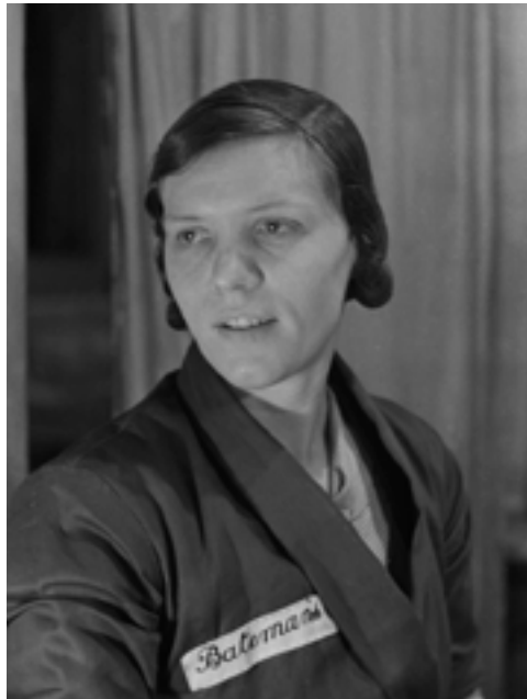
Figure 15b 'But Before Long She will go Back to her Ordinary Face'.