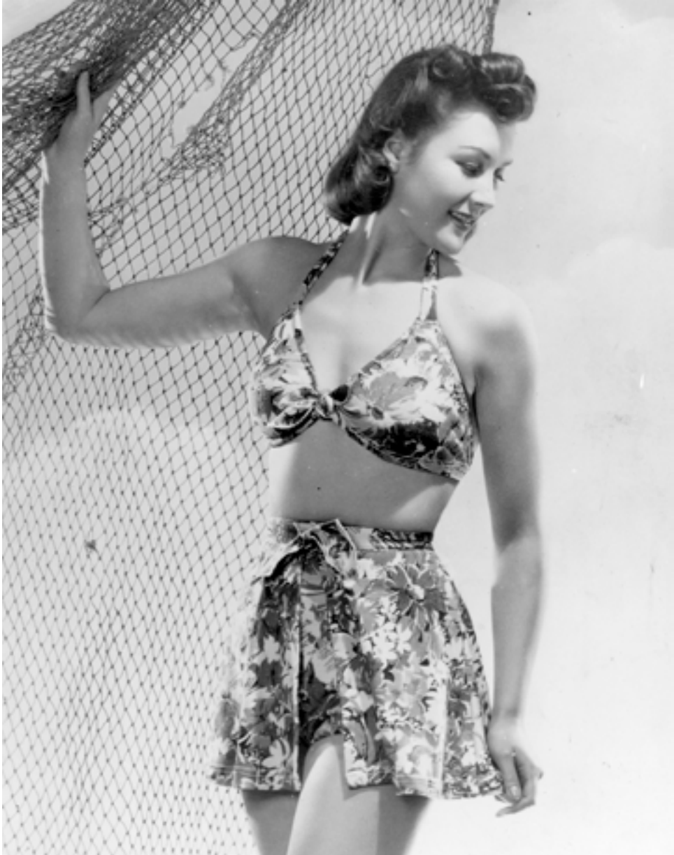
Figure 32 'Floral Two-piece: This gaily coloured model in wool stockinette is by Windsor Water Woollies. The little apron skirt is detachable'. From 'The New Swim-Suits Arrive', Picture Post , 18 May 1940, p. 28.

By September 1940, however, in an article entitled 'Something We Rather Missed This Summer' 33 Picture Post was bemoaning the fact that swimsuits had tended to stay in the shops. The preparations for summer, advocated back in May, had lost relevance as women were increasingly 'wearing uniform or working long hours in factories'. Meanwhile the beaches had been 'festooned with wire, wire with spikes on it'. 34