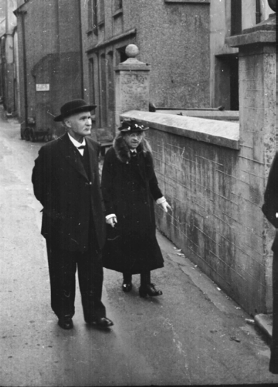
Figure 2 'Sunday Suits: We keep our own style of dress in the village. It's neat and dignified. It suits us. And you can always tell Sunday by the clothes we wear.' From 'Life of a Village', Picture Post , 1 October 1938, p. 48.