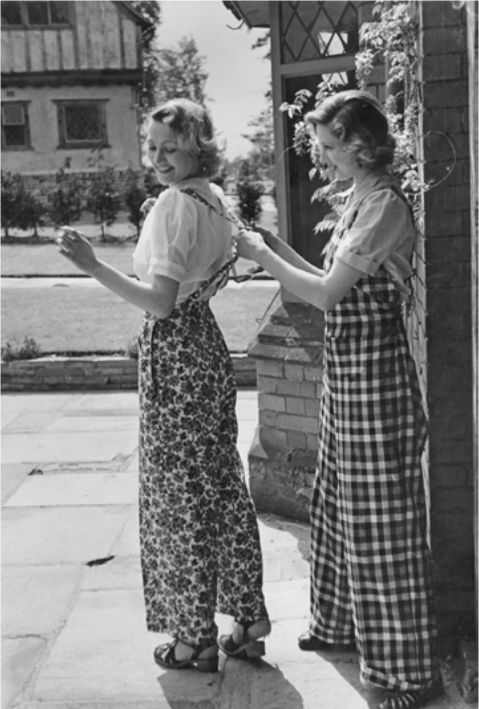
Figure 43 'Rainbow Trousers. Newest trousers show all colours of the rainbow. The floral dungarees cost 19s. 11d., check linen pair 55s. 9d., John Lewis. 6 Coupons'. 'Clothes for a Coupon Summer', Picture Post, 5 July 1941, p. 26.