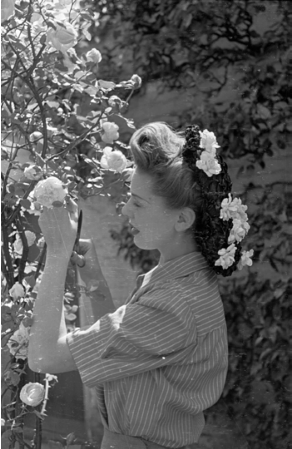
Figure 51 'The Prettiest Shirt of the Summer: It's striped strawberry pink; 17s. 11d. The snood is a gay extravagance. Bourne and Hollingsworth.' From 'Fashions for Summer: All Under £3'. Picture Post , 19 June 1943, p. 24.