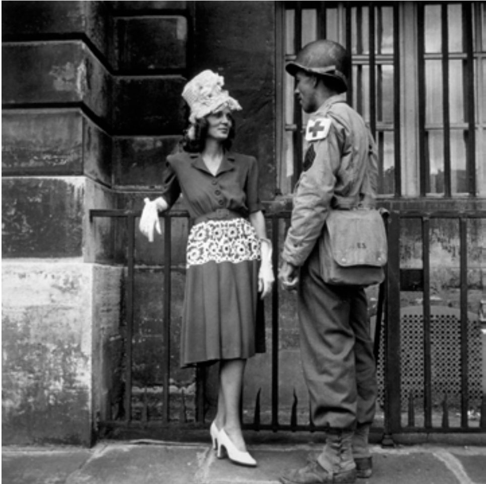
Figure 70 'The Fashion Trade is Ready for Peace: The Models in Reserve'. From 'Paris Fashions Are Quick Off the Mark, Picture Post , 7 October 1944, p. 19.