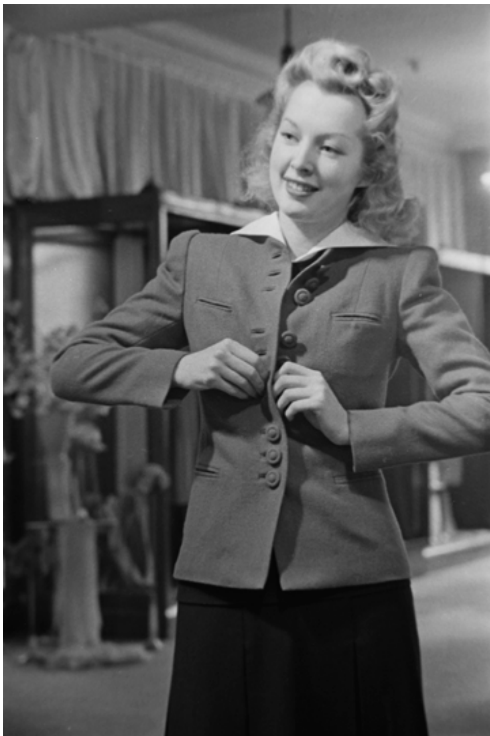
Figure 35 'The Jacket', 'Shopping for Spring', Picture Post, 29 March 1941, p. 31.