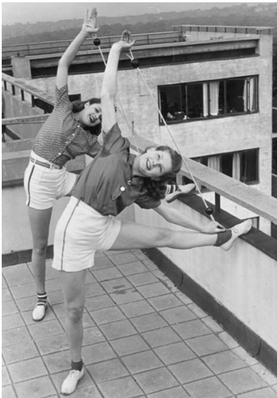
Figure 65 'The Sideways Bend: First to the left, then to the right, this exercise keeps the waist muscles supple'. From 'Can You Do These New Summer Exercises?' Picture Post , 20 June 1942, p. 22.