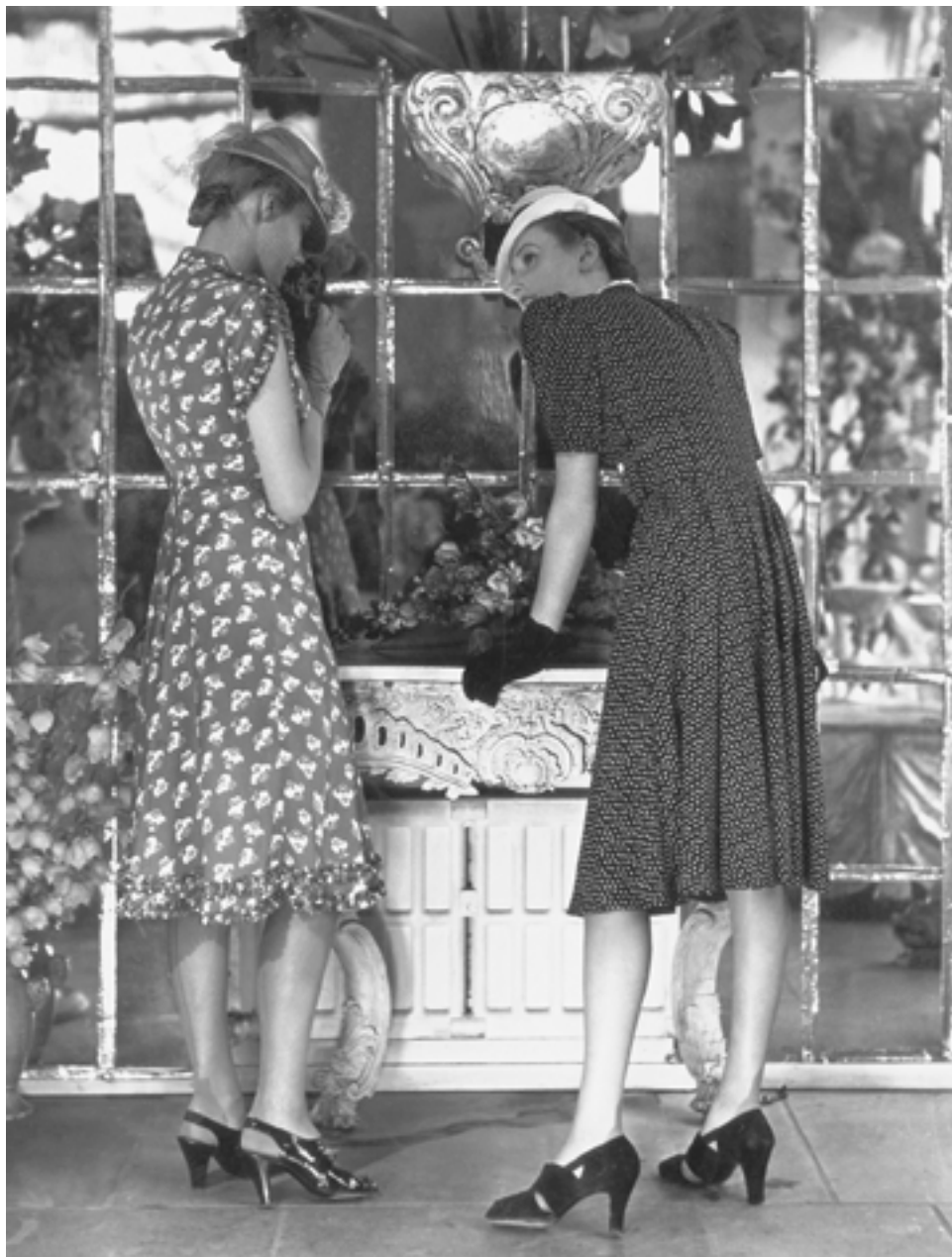
Figure 19 'Flower-Time Fashions. On the left, a printed floral crepe-de-chine in pale blue and white, with a cross-over bodice. The mushroom hat is in soft firefly blue. On the right a chic summer dress with white polka dots, and a high crowned sugar loaf hat from Paris. You can buy these dresses for 5 ½ guineas.' 'The Last Straws of Summer', Picture Post , 1 July 1939, p. 62.