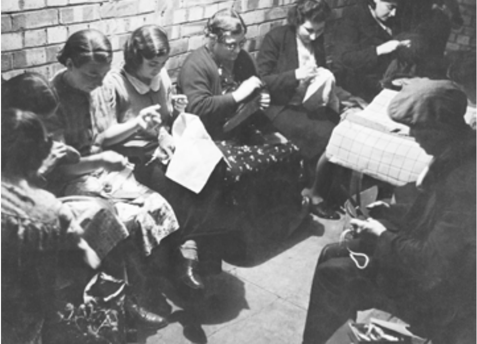
Figure 39 'The Underground Sewing Bee: Unheeding the bombs, the shelterers are busy. Some make slippers. Some make dresses. Some make patchwork quilts. One ambitious girl is hand-hooking a wool rug'. From 'Down in the Shelter There Is Life', Picture Post , 29 March 1941, p. 16.

itself was far from moribund under these circumstances. Innovation whether in design or fabric was ongoing, now with a distinctively practical edge, while emerging trends had continued to offer fresh perspectives across the fashion spectrum from flexible daywear to the bedroom. The tailored pieces and soft separates of pre-war fashions retained currency because they continued to offer a smart and practical chic suited to the new conditions. Crucially, there was little that was completely new in the fashion lexicon. Overt opulence was out; sensible, smart, unfussy fashion was in.