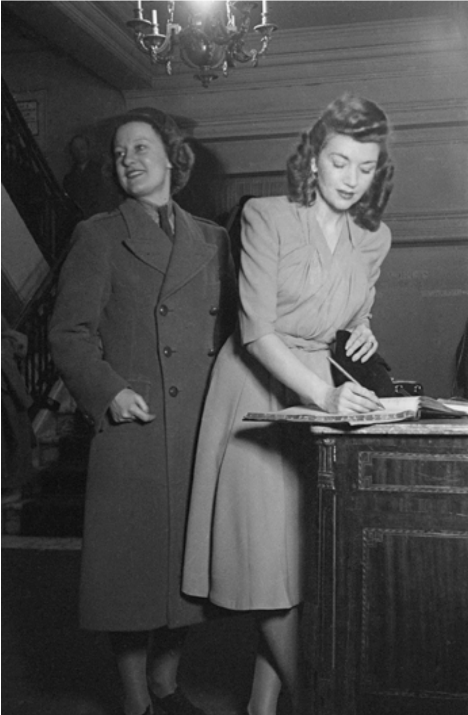
Figure 73 'The Dressier Dress. A pistachio crepe dress has a beautifully draped bodice. Rembrandt, from Waring & Gillow; £8 4s. 6d.; 7 coupons'. 'Some Clothes for Your New Coupons', Picture Post, 26 February 1944, p. 22.