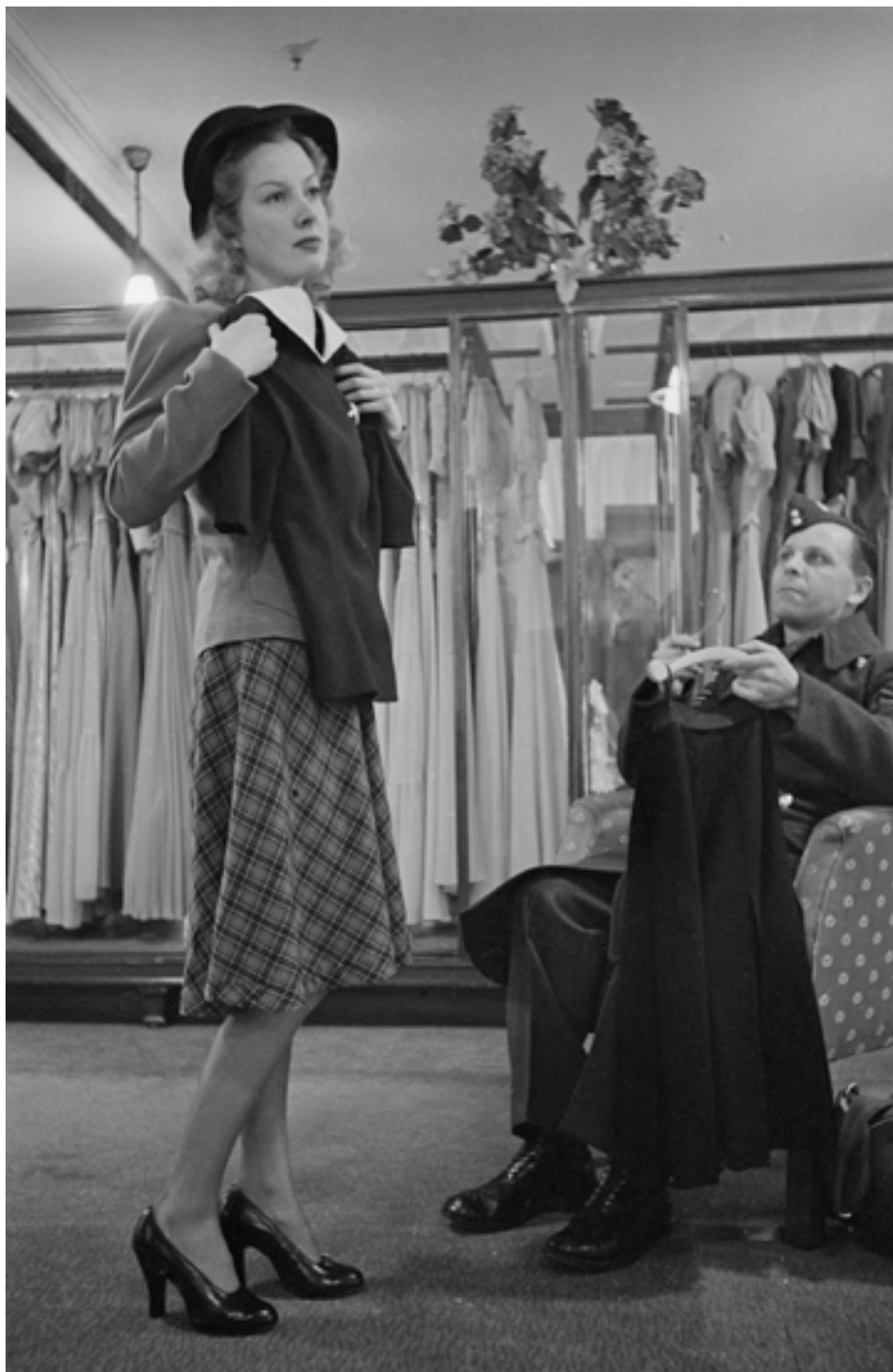
Figure 33 'The Shopping Trip', 'Shopping for Spring', Picture Post, 29 March 1941, p. 30.