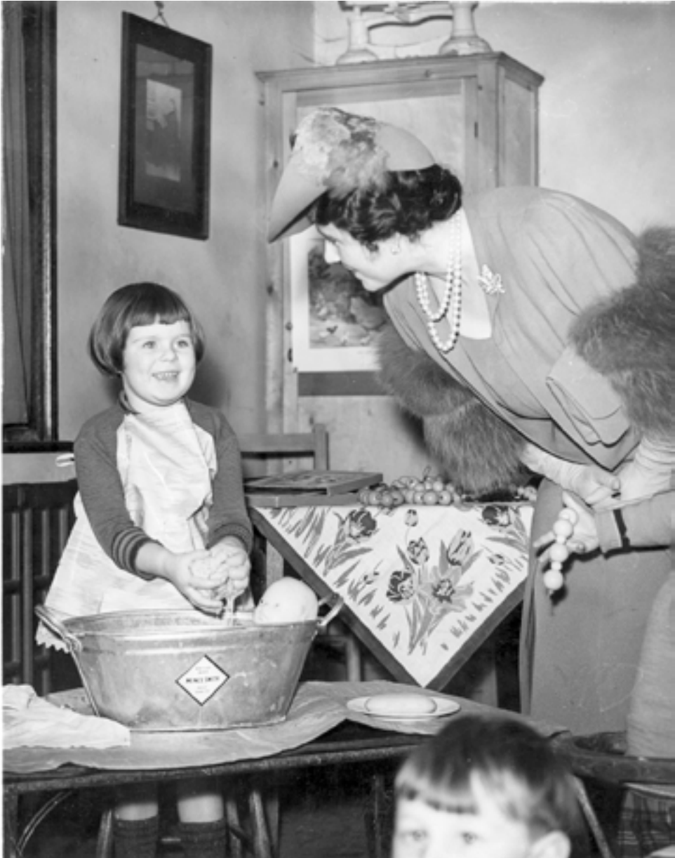
Figure 17 'The Queen with the Little Girl: The Queen visiting an evacuation school', Picture Post , 25 November 1939, p. 40.

The final picture in the story showed the Queen wearing a Hartnell three-quarter-length black velvet coat with Persian lamb trimming on both coat and halo hat, the modest leg-of-mutton sleeve design again reflecting the currency of historical detail.