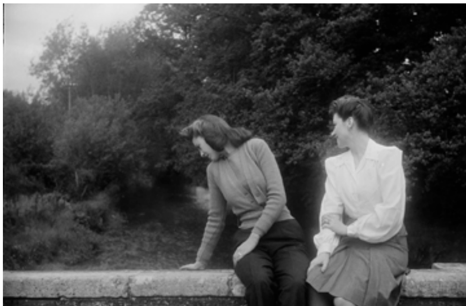
Figure 52 'Classic Sweaters and a Cricketer's Shirt: This twin set is in a green brushed rayon that looks like wool; 20s. 11d. for the jersey, 22s. 8d. for the cardigan. The brown cotton slacks cost 24s. 4d., take only 5 coupons. The white blouse has new loose lines and long, full sleeves; 21s. 5d. All from Selfridge's.' From 'Fashions For Summer: All Under £3', Picture Post , 19 June 1943, p. 25.