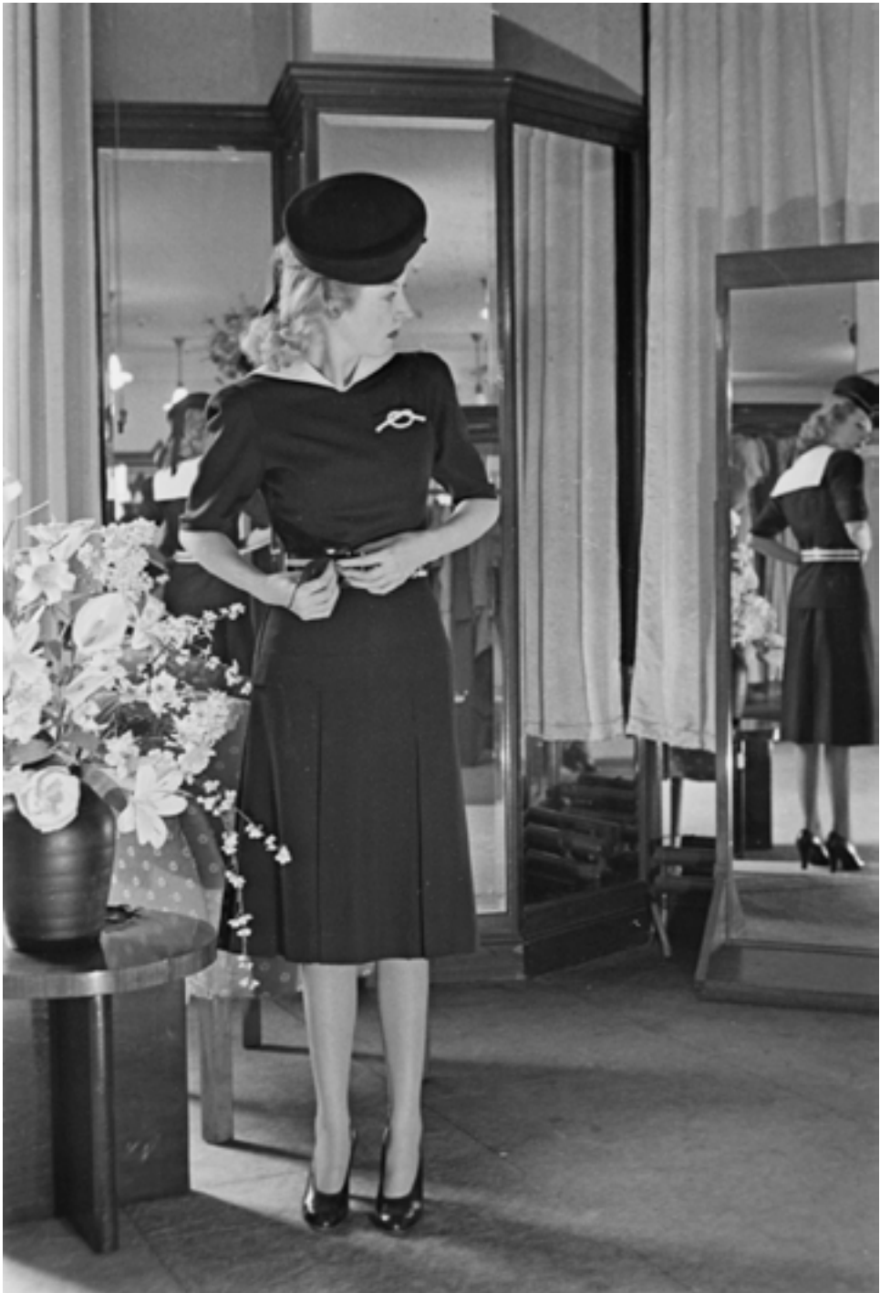
Figure 34 'The Sailor Suit', 'Shopping for Spring', Picture Post, 29 March 1941, p. 30.