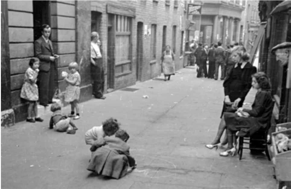
Figure 25 'Street Scene in Whitechapel', 'Whitechapel', Picture Post , 15 October 1938, p. 25.

has a positive quality that you will find nowhere else in London. The East End is not ashamed. Its people are not crushed'. 6 Some sense of this 'positive quality' is surely reflected in the way clothes had been used to communicate a smartness and sense of style that signalled Whitechapel people resisting being defined by the 'ghetto' they called home.