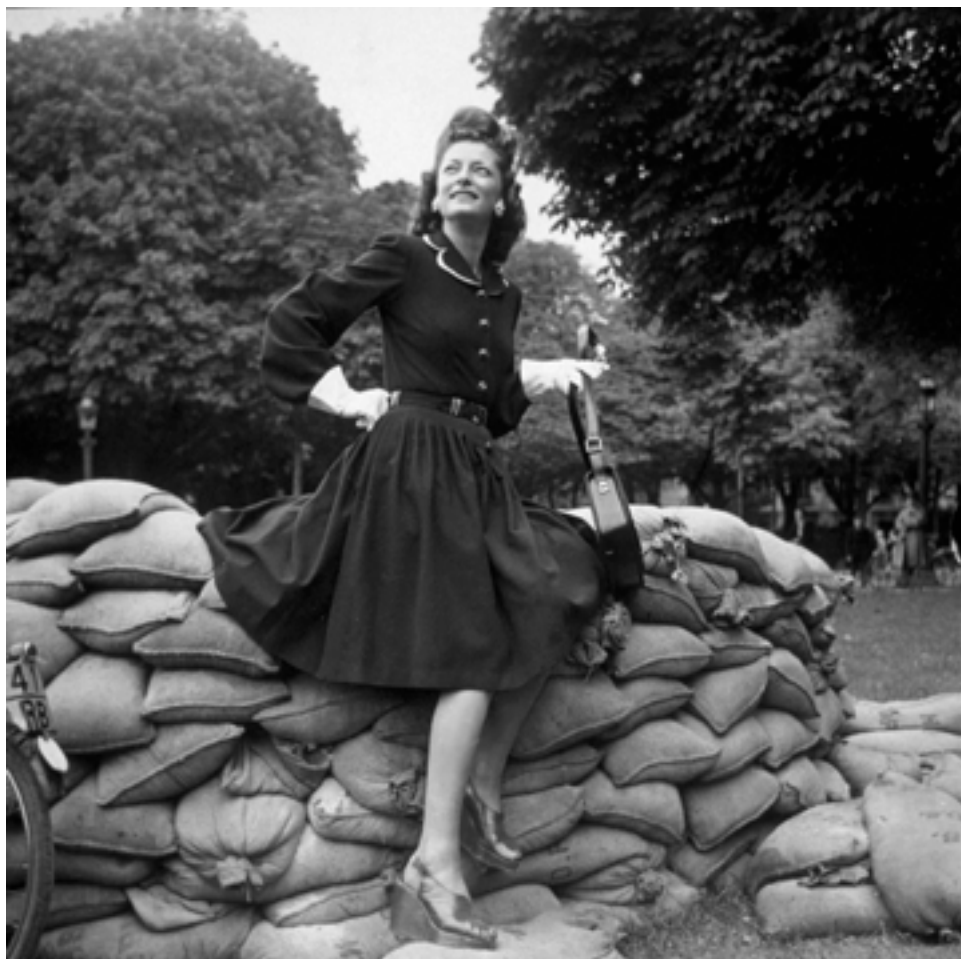
Figure 69 'The Incidental Background. The war has limited materials; but not for the smart coutourieres who make their models, war or no war.' 'Paris Fashion Are Quick Off the Mark', Picture Post , 7 October 1944, p. 19.

fought so well in New York – for their contribution to France's liberation'. 15 Business as usual clearly struck the writer as controversial. Yet the irony would prove to be double-edged. The argument for keeping designer doors open is now a familiar one. 16 In doing so both the industry and the untold number of jobs and livelihoods it saved and supported were secured ready, indeed, for the peace and all that that would so soon bring. 17 In fighting for its survival the couture industry had been waging a very different type of war, arguably, from that being fought by the Maquis, a fact that would only become clear with the benefit of historic hindsight.