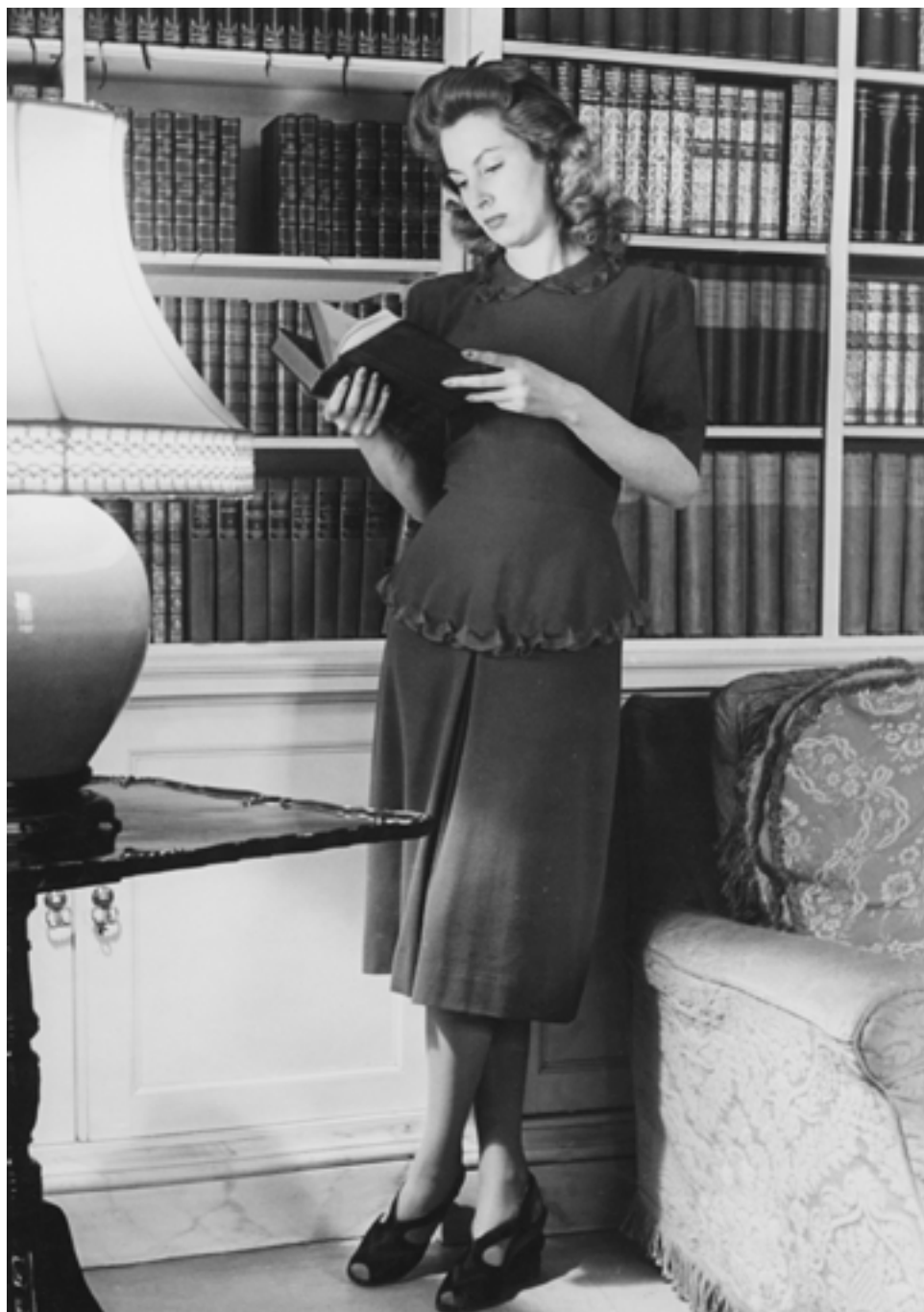
Figure 49 'At Home Dress. Today, we wear the same short simple dress for afternoons and evenings. From Rose & Blairman.' 'Austerity Clothes for the Fourth Year of the War'. Picture Post, 29 August 1942, p. 22.