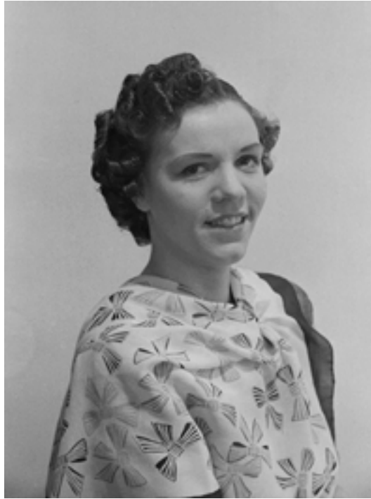
Figure 15a 'And This is the Result: The Transformed Charlady Sees Herself in the Glass.' Both images 'Charlady into Glamour Girl', Picture Post, 17 June 1939, p. 55.