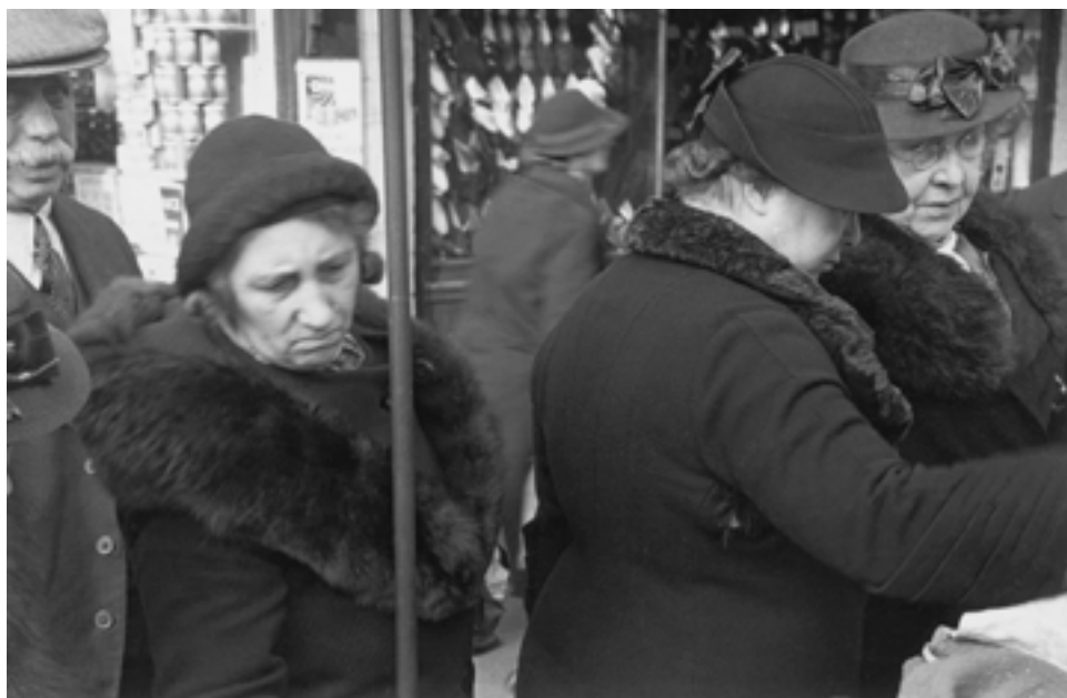
Figure 26 'Expressions In the Street Market: Dubious'. From 'Life in the Lambeth Walk', Picture Post , 31 December 1938, p. 52.

Life in Whitechapel or the Lambeth Walk might be trying but neither Spender nor Cameron and Barber portrayed these communities as either destitute or living in intolerable conditions. The 'almost aggressive vitality of life' 12 Cameron witnessed in Whitechapel spoke for a hardy capacity to withstand life's limitations, while an ability to keep up appearances reflected something of the human dignity that resided in the right clothing.