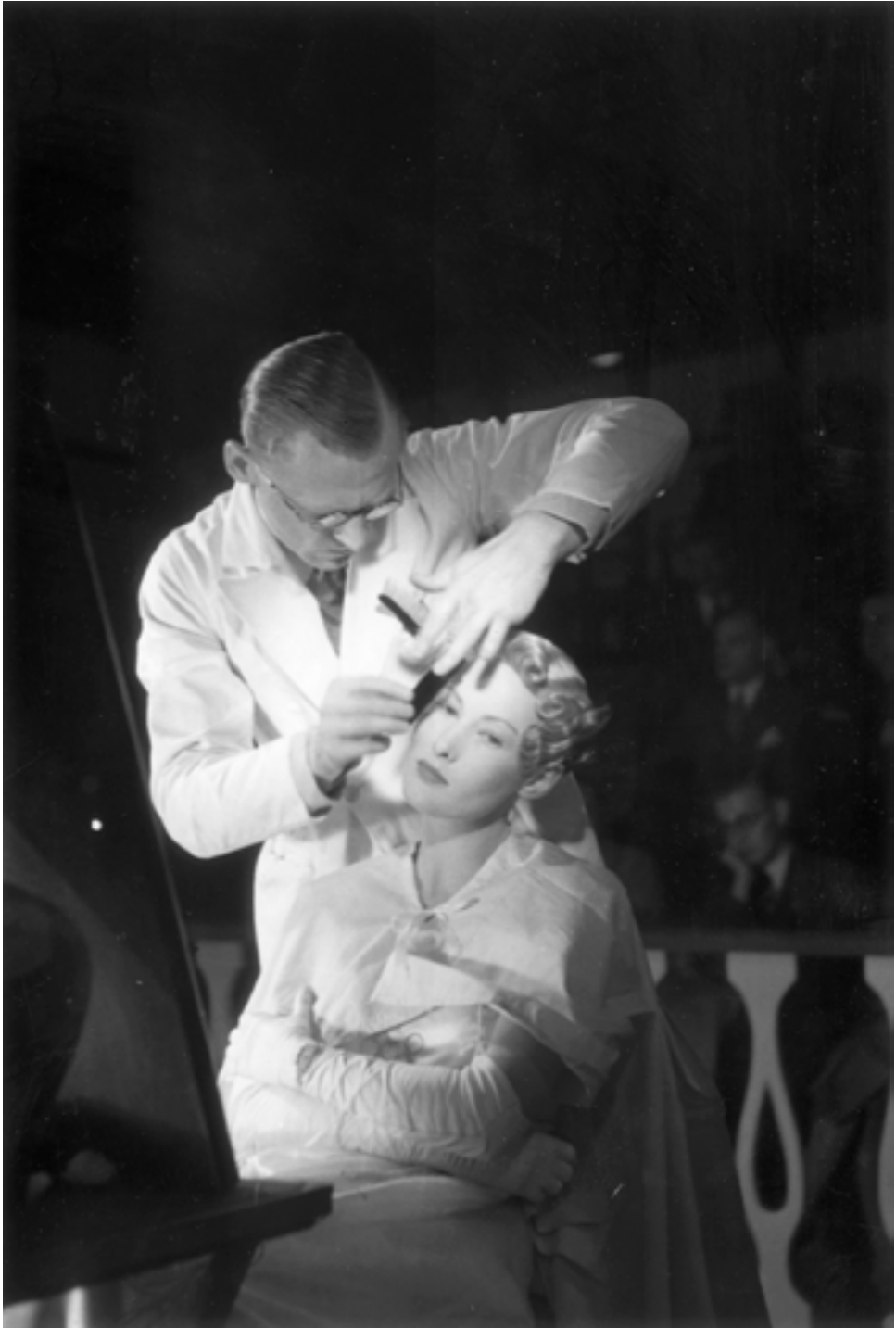
Figure 13 'Experts from all over the country competed anxiously for worth-while prizes at the Hair and Beauty Fair.' From 'Trouble about Hair', Picture Post , 8 October 1938, p. 55.