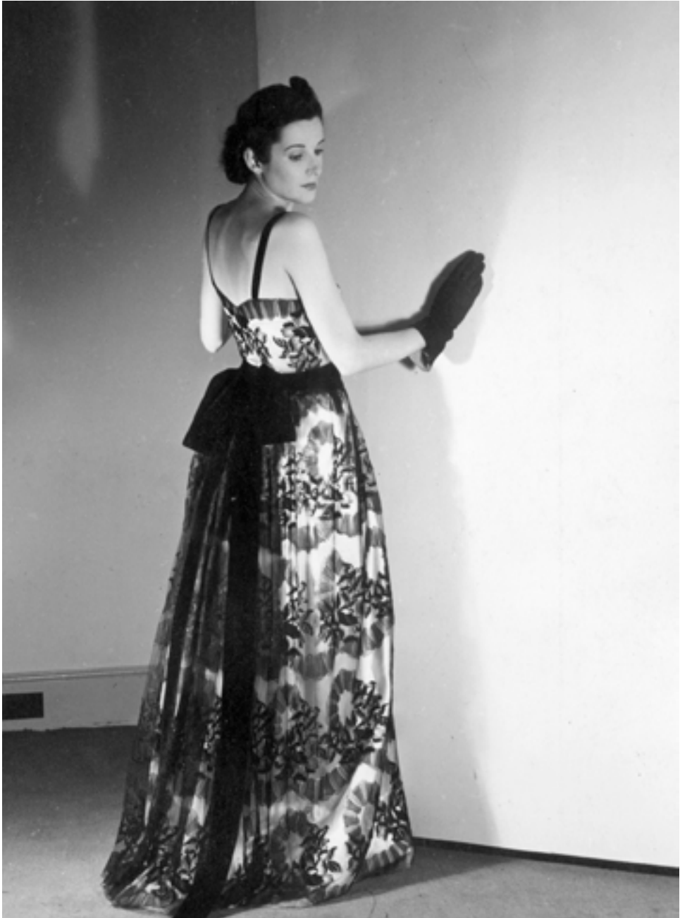
Figure 18 'The House that Launched the Crinoline Adopts the Full Flowing Skirt: This lovely evening frock of white satin has an overdress of shadowy black lace' From 'Design for Spring Time', Picture Post , 25 March 1939, p. 38. Horace Eliascheff/ Picture Post /Getty Images (3374667).

and made out of 'bright pink wool embroidered with spangles and imitation jewels'. Here were colourful, statement clothes reflecting the signature drama of Motley and the exuberance of couture evening wear six months before war.