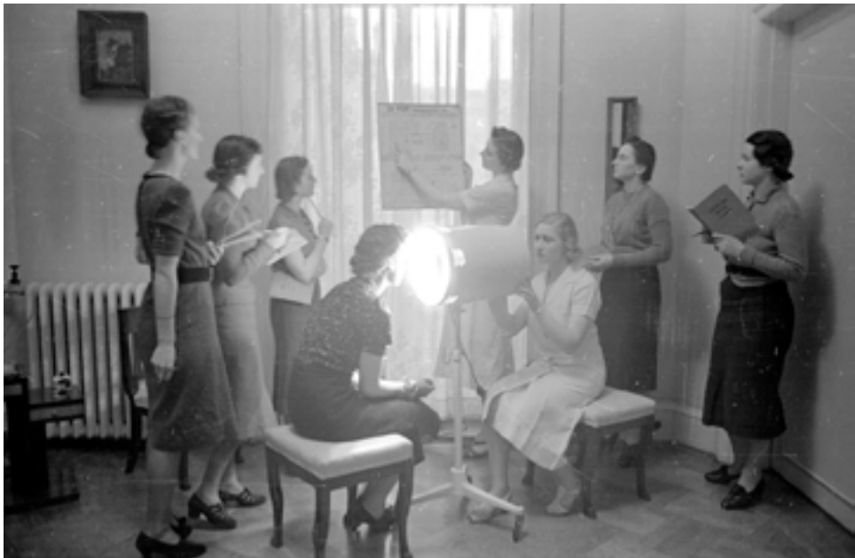
Figure 12 'She Looks into a Dermoscope ... Before a beauty expert gets to work, she must know all about the face she has to work on. Her client sits before the dermascope. Inside is a system of lenses and lighting that will show up every blemish and wrinkle'. 'The School of Beauty', Picture Post , 11 February 1939, p. 30.

Opening a window on to what would have been for many a closed world, Picture Post revealed the level of sophistication at which the beauty industry now operated and