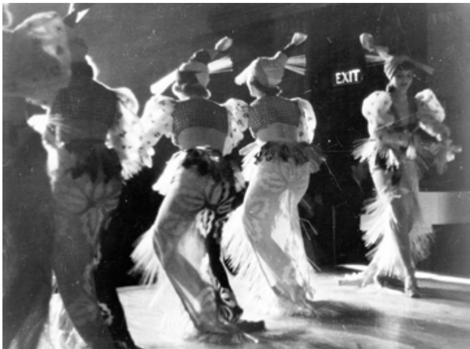
Figure 9 'Glamour Girls as the Audience Sees Them – With all their Glamour'. From 'A Glamour Girl's Day', Picture Post , 22 October 1938, p. 13.

While mannequins of one sort or another identified the fashionable form as both svelte and graceful, Picture Post introduced another perspective on beauty in terms of its association with 'glamour'. The photo-story of 'A Glamour Girl's Day' followed the young Chester Hale American dance troupe through their normal daily routine, before appearing on stage in two evening shows at the Dorchester Hotel. 9 Considered to be the ideal height and weight for their work at five foot six and eight stone eight pounds, these girls offered a slightly different form of physical beauty and one closely associated with their intensely active life. Here glamour was fashioned from a light, athletic figure achieved through hard