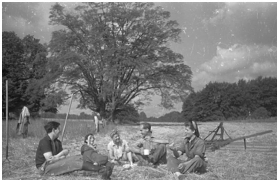
Figure 75 'Lunch-time for the Workers from Chesfield Park Farming Camp in Hertfordshire...', Picture Post, 17 July 1943, p. 23.