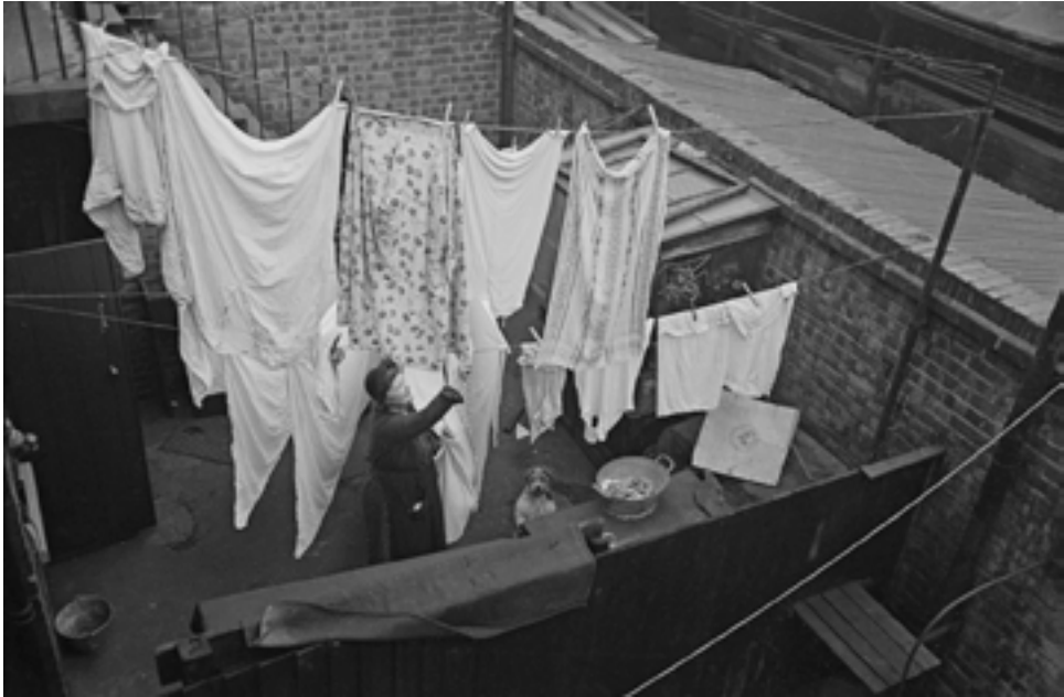
Figure 27 'Washing-day in the Backyards. "Especially if you've a big family it's hard to do the wash properly. We could all do with a bit more room". 'Life in the Lambeth Walk', Picture Post, 31 December 1938, p. 50.