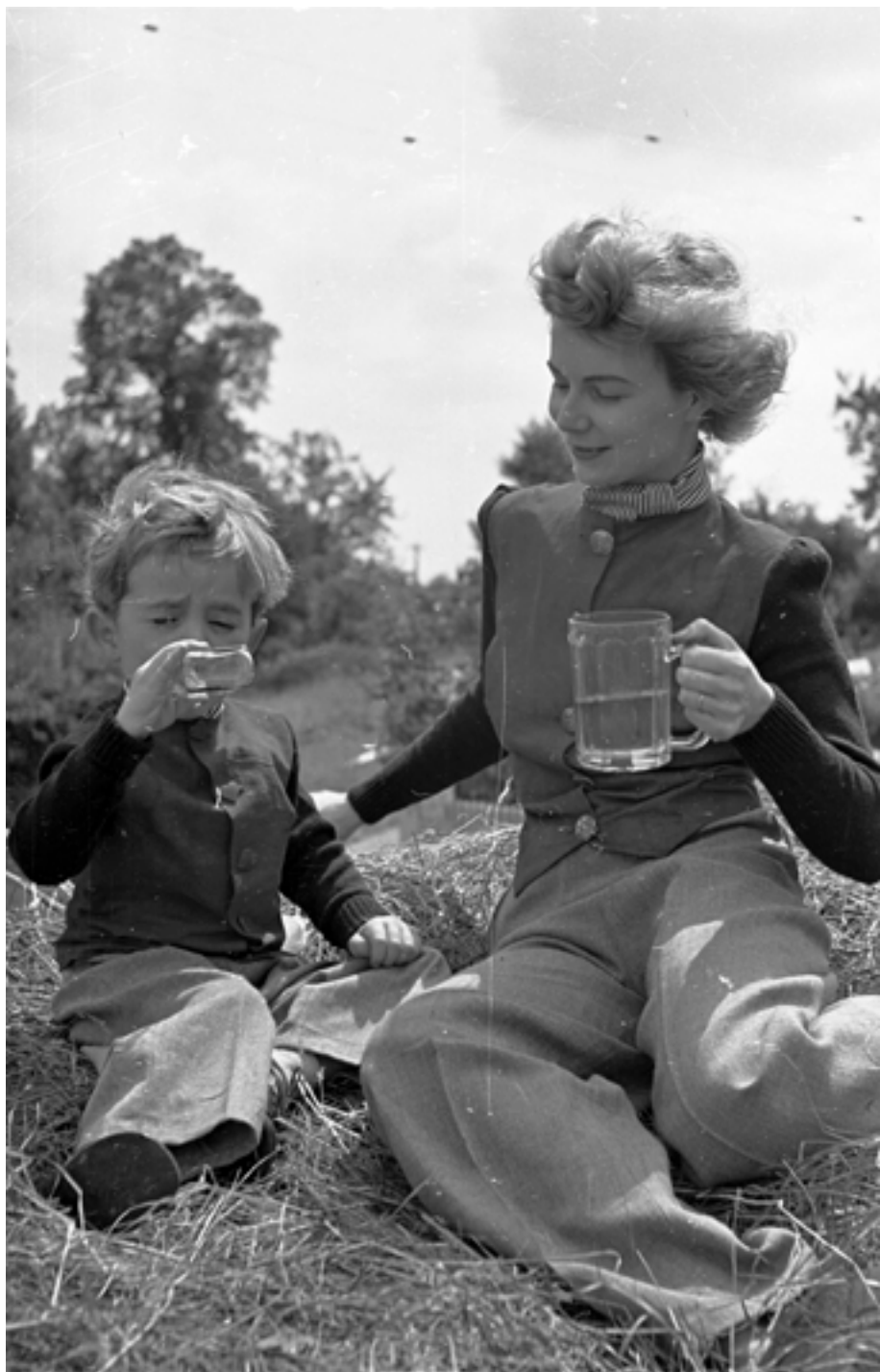
Figure 61 'Waistcoats from Skins: Two good-sized skins make delightful mother-and-son waistcoats; the sleeves are knitted.' From 'Clothes without Coupons', Picture Post , 28 August 1943, p. 24.