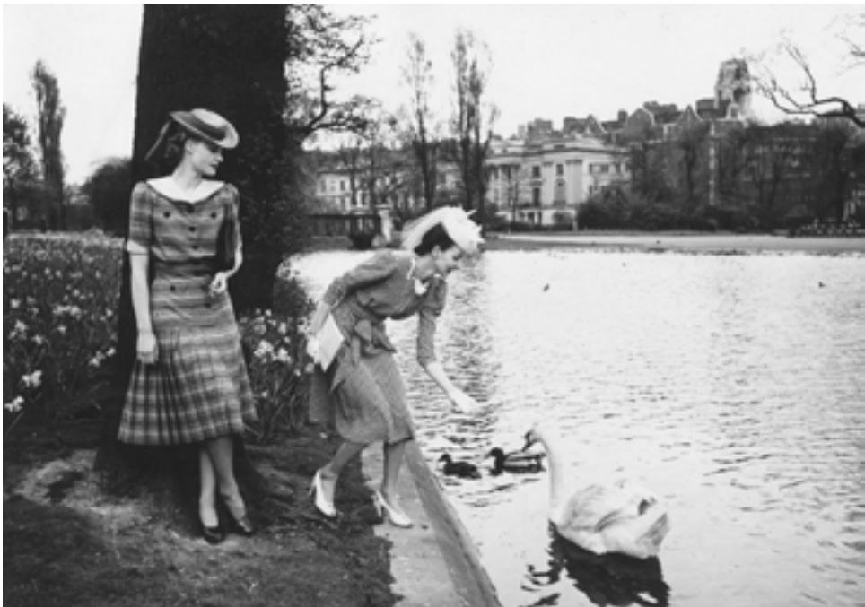
Figure 58 ‘And Here’s What They Make . . . First a Suit, Second, a Summer Frock.’ The suit has ‘gay stripes and swinging skirt . . . pink pique revers and cuffs’. The ‘summery print frock of red and white crepe’ is ‘as soft as the suit is tailored’. From ‘Make Yourself a Model Outfit’, Picture Post , 31 May 1941, p. 31.

In the meantime dressmaker Phienka was applauded for understanding the desire for ‘practical as well as pretty’ clothes for all body shapes, and for recognizing that patterns for ‘amateur dressmakers must be extremely simple to cut and sew’. 13 The outfits shown, however, don’t appear to be that simple. The striped Viyella suit, for example, consisted of a short-sleeved, hip length, front-buttoning jacket with contrasting linen shawl-collar and cuffs, worn over a circular pleated skirt. 14 The look was tailored, needed six yards of material and might, arguably, have been something of a challenge for the inexperienced dressmaker. The dress and nightgown, too, required more than rudimentary skills. Using five-and-a-half yards of ‘Courtauld’s Tested Quality rayon crepe’, the summer frock had a softly tailored bodice with fitted three-quarter-length sleeves gathered into small shoulder puffs, a wide ornamental sash at the waist and a softly draping skirt. The nightdress required four yards of crepe or satin as it was full length, had a fitted blouse-style bodice with a tie belt at the waist and short puffed sleeves.