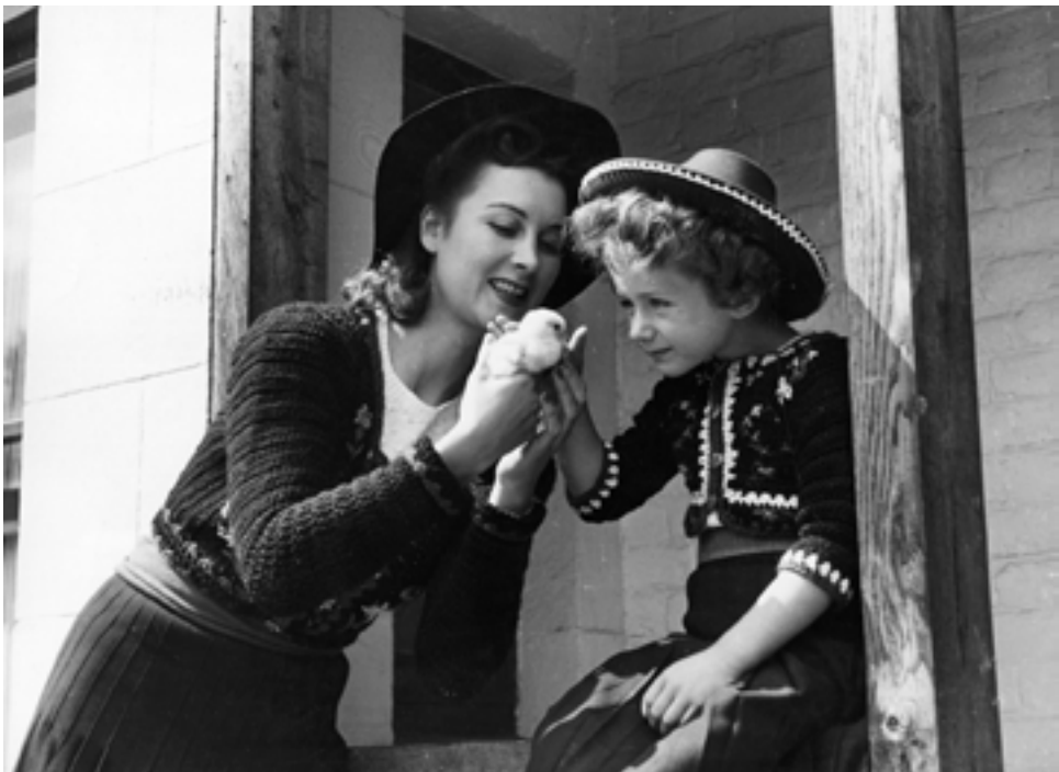
Figure 1 'Boleros for Mother and Daughter: Thick hand-knitted sweaters are becoming a rarity. This pair are grand for the country.' From 'Mother-and-Daughter Fashions', Picture Post , 30 August 1941, p.

Stories that took readers into fashion houses or beauty parlours, discussed a Utility wardrobe or a make-do-and-mend project, directly explored aspects of the wartime