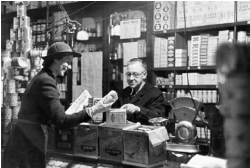
Figure 40 'Lord Woolton recommends oatmeal. Do grocers back this up? Yes, this one, picked at random, says it's delicious with honey or milk.' 'We Appoint a Woman's Editor', Picture Post , 8 February 1941, p. 33.

In the context of dangerous times and diminishing supplies, Picture Post 's first Woman's Editor, Anne Scott-James, started a new 'Practical Living' feature in February 1941, a little over five months after the onset of the blitz. 1 Hoping to provide practical help on a wide variety of topics relating to domestic life under the deteriorating conditions of war, she intended to run stories on 'Fashion, beauty, decoration, sewing and knitting,