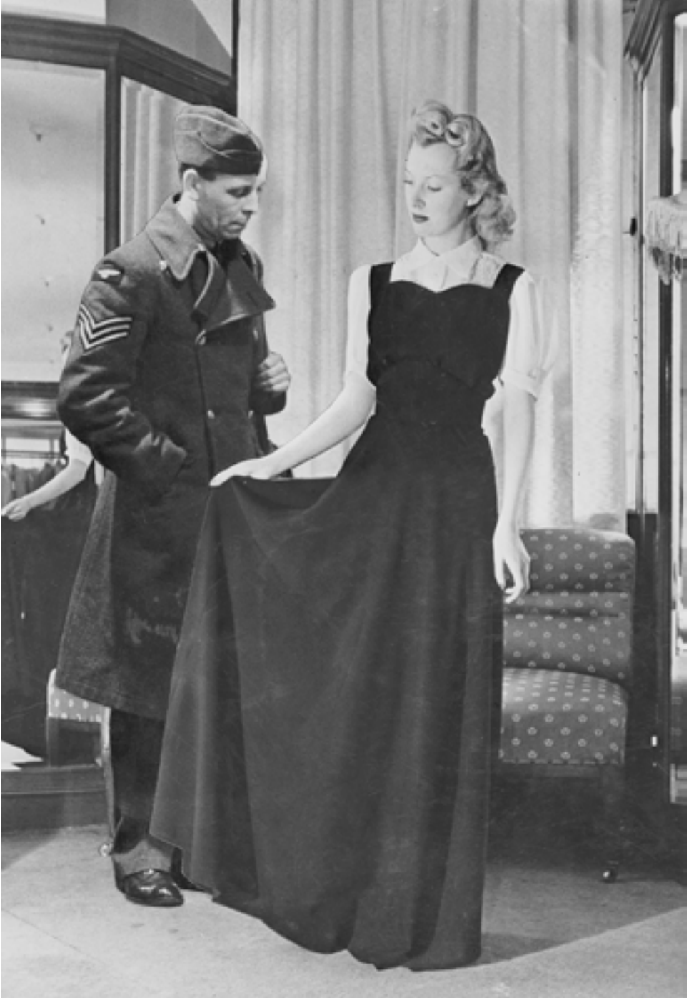
Figure 36 'The Dinner Frock', 'Shopping for Spring', Picture Post, 29 March 1941, p. 31.