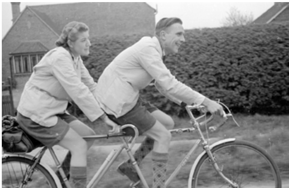
Figure 21 'Comrades of the Road: A Tandem' from 'A Day Awheel', Picture Post , 10 June 1939, p. 19.

The subject of cycling was returned to early in 1940 as the bike became more popular in the context of wartime petrol rationing. 77 Picture Post reported on the 'new cycling clothes – and the clothes to wear beneath them' that had arrived for women as a result. 78 London designers, it appeared, had recognized the impact cycling was making and had devised a series of new fashions that built on the established cycling club conventions of shorts or trousers and jackets. 79 The new styles featured well-cut trousers, breeches and matching jackets with accessorizing hoods, hats and footwear.