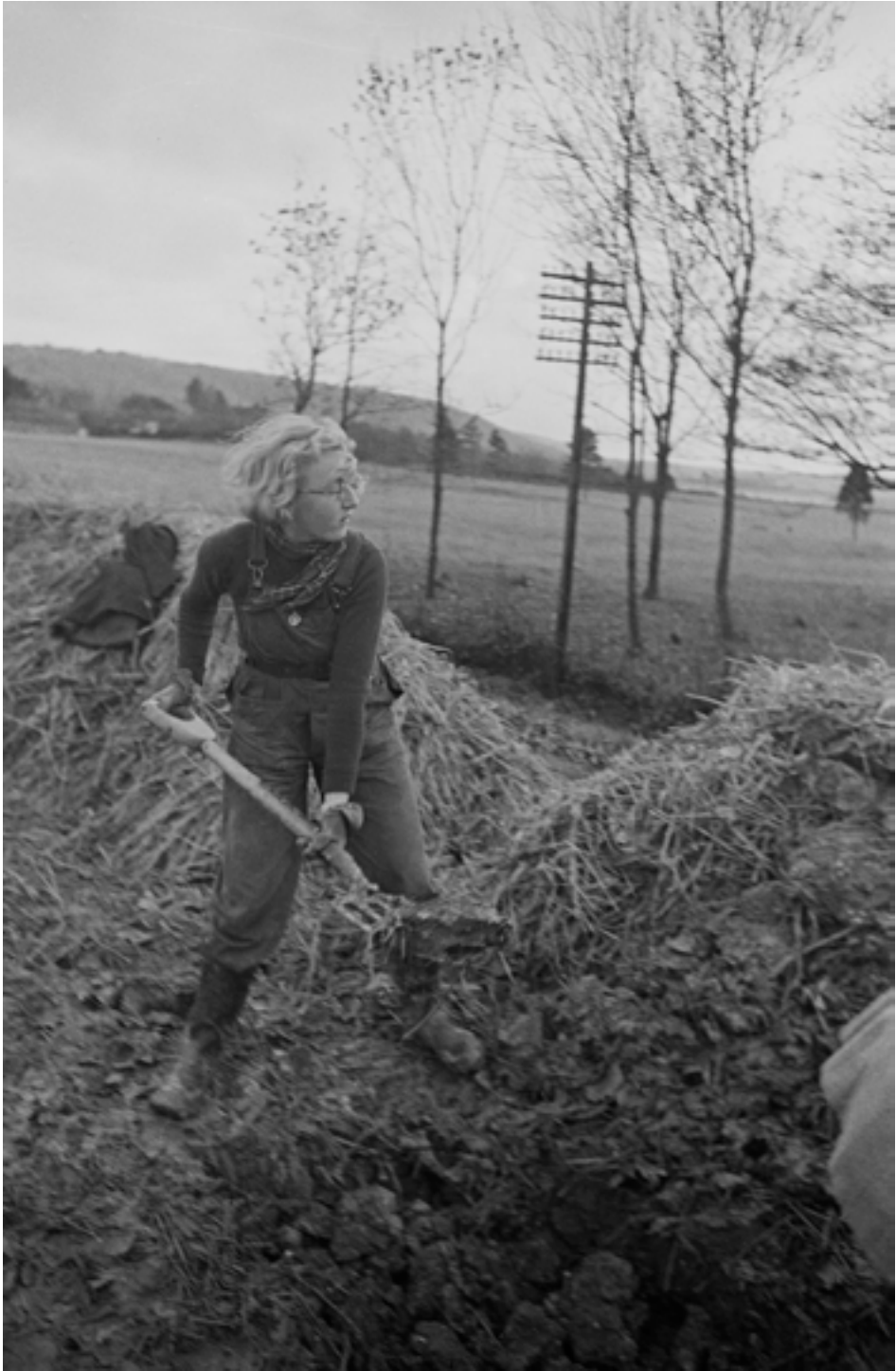
Figure 23 'Horticulture: Earthing a Potato Clamp'. 'This was the Women's Land Army', Picture Post, January 1940, p. 34.