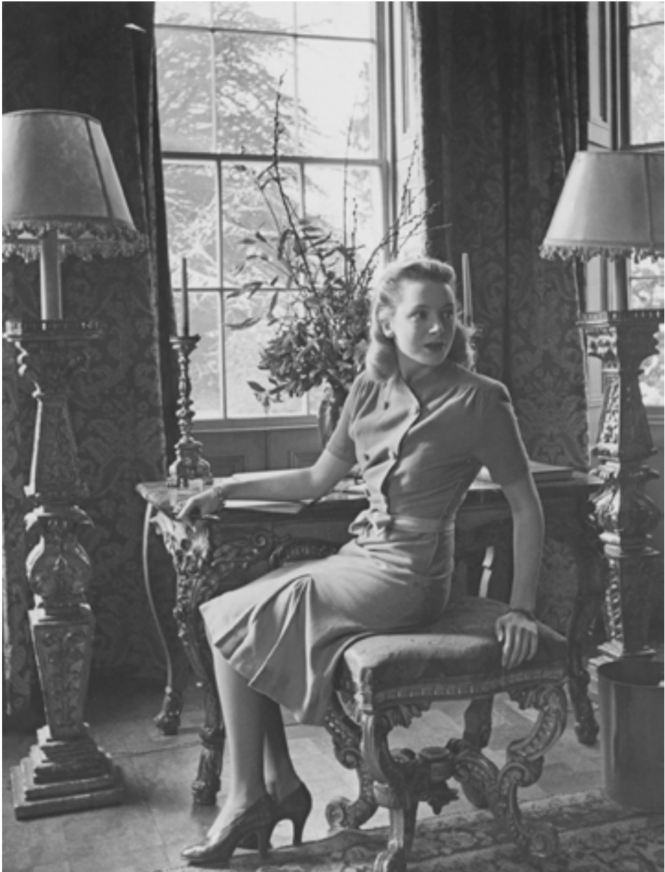
Figure 47 'Dresses: Here is a typical Utility Dress. Of pale blue light woollen, it has a double-breasted bodice and pleats in the skirt. A Spectator Model, 62s. 10d. Everything about it is top-flight, except the price.' 'Deborah Kerr Shows Off The New Utility Clothes For Women', Picture Post, 28 March 1942, p. 18.