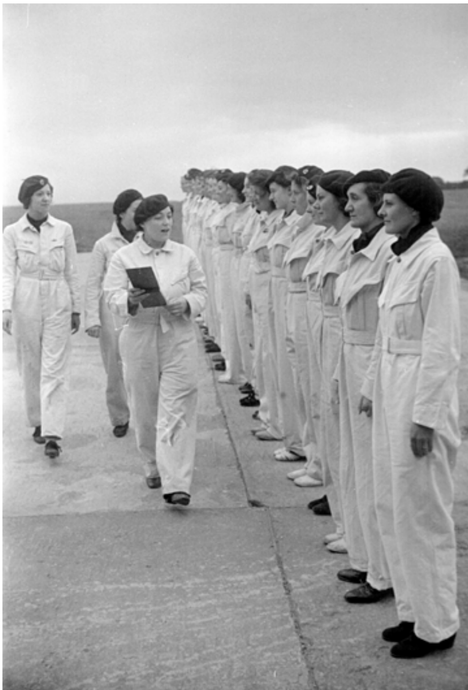
Figure 22 'Start of the Day: Sunday Morning Roll-Call ... Two stars on the tunic mark the flight leader'. From 'Girl Pilots', Picture Post , 22 October 1938, p. 48. Kurt Hutton/ Picture Post /Getty Images (3368309).