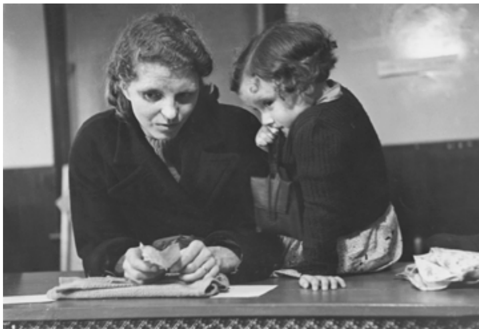
Figure 56 “Only Eight Coupons Left. Oh, Mother, What a Problem!” Oh dear, it’s worse than arithmetic. We’ve eight coupons left. They want six for the jersey – we could manage that – but ten for the lovely coat. Let’s go home, Mummy, and turn out my cupboard. We could swap one of my nightgowns – I don’t need them a bit.’ From ‘This Is a Clothes Exchange’, Picture Post, 2 October 1943, p.25.

allocations fell over the duration of the war and beyond. Having access to such a rich repository of clothing, based solely on the capacity to donate, may also have been an added incentive to look after existing clothing as it now became the means of addressing future wardrobe needs. Clothing had become a form of currency.