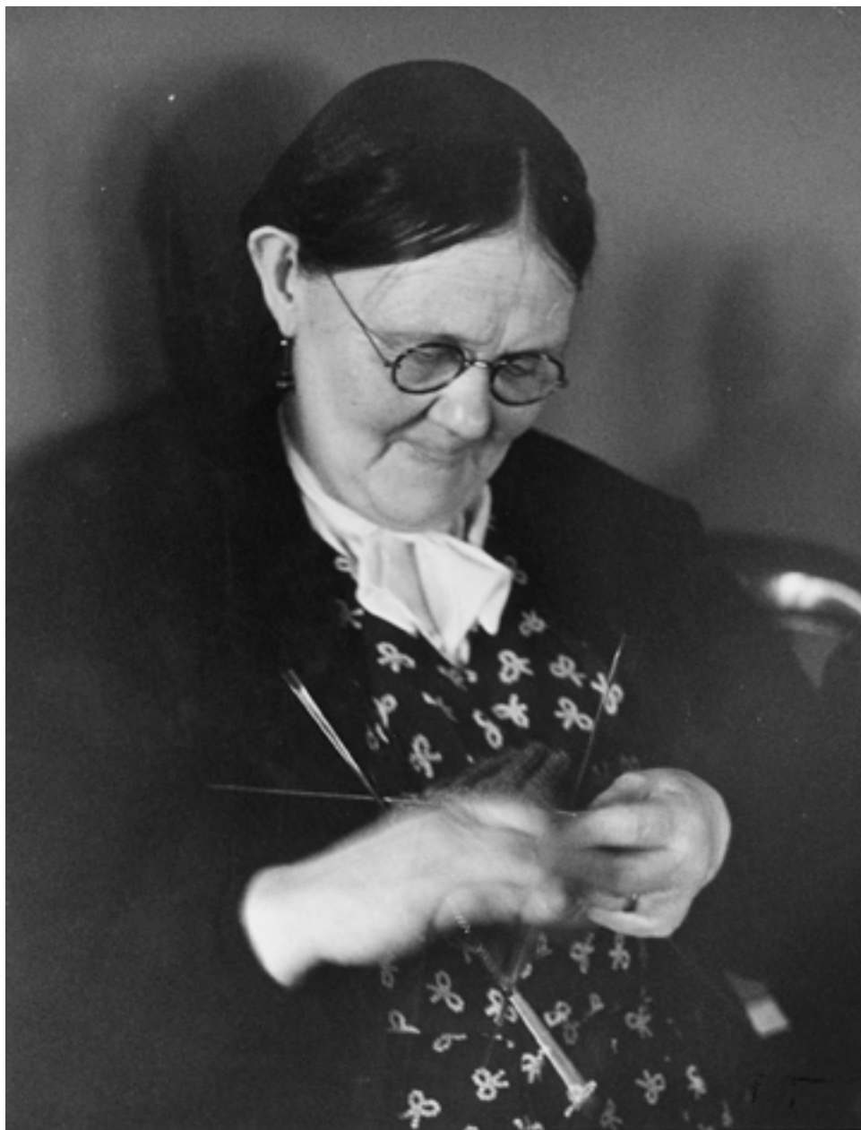
Figure 54 'Retired Farmer's Wife ... she learned to knit when hand-made Keswick knitwear was famous throughout Britain.' From 'The Happy Knitters', Picture Post , 17 February 1940, p. 29.

The following week journalist Antonia White contributed an article on a similar theme. The Keswick knitters, while hardly a small group, were local and community based. The Central Hospital Supply Service Committee (CHSSC) operated on a quite different scale.