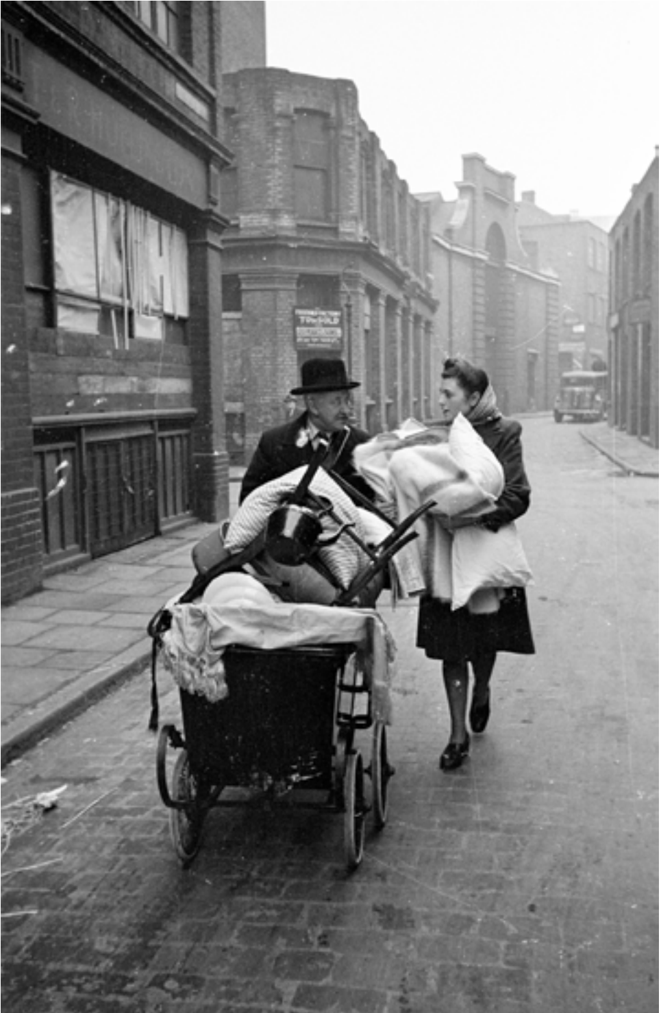
Figure 57 'The Mayor of Shoreditch Lends a Hand', from 'The Store Where Everything Is Free', Picture Post , 3 March 1945, p. 25.