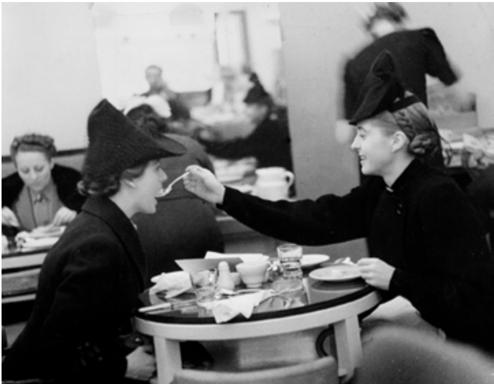
Figure 8 'Lunch-Time in the Bond Street Mannequins' Restaurant: 'Most of the girls who come to this little restaurant every day are mannequins. Here they get a meal with which everyone can be satisfied, and on which no one will get fat'. From 'Where The Beauties Go For Lunch', Picture Post , 3 December 1938, p. 33.

The 'Workhouse' was a 'new type of restaurant' 8 in offering figure-conscious food. Few details surfaced as to the type of dishes on offer, however, nor were there any helpful tips on nutrition for readers. What did emerge very clearly through the photo-story was the sense of style emanating from the diners and the careful attention to details of dress and