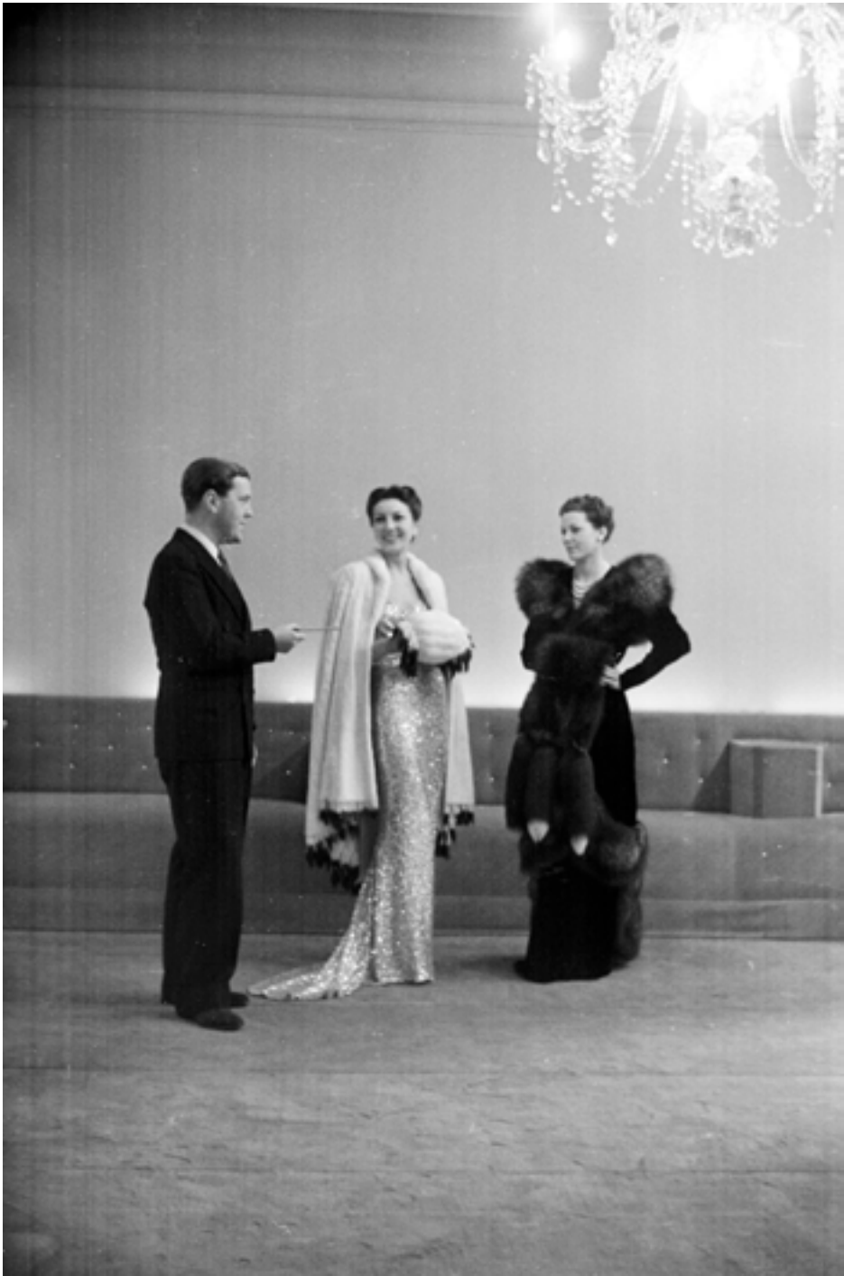
Figure 16 'Models for the Queen: Before being sent to Buckingham Palace, everything the Queen will wear is inspected by Norman Hartnell. Sometimes, even at this moment, he will change the material for a coat or dress'. From 'The Queen's Dressmaker', Picture Post , 19 November 1938, p. 27. Kurt Hutton/ Picture Post /Getty Images (3367142).