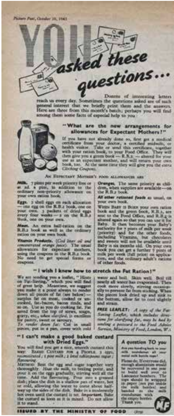
Figure 68 'YOU asked these questions...', Picture Post, 30 October 1943, p. 4.