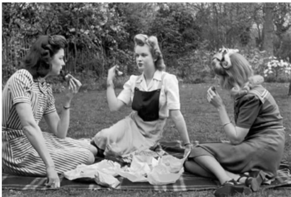
Figure 48 'Coloured Cotton Wash Frocks Are Practical for a Wartime Summer: ... The navy blue and white striped Utility shirt dress costs 36s 6d. The saxe blue frock with navy bib and white sports shirt costs 45s 11d. complete.' The 'American Sailor Frock' in blue cotton with white trim was priced at two guineas. From 'American Fashions For Summer', Picture Post , 16 May 1942, p. 22.

In May, in an article entitled 'American Fashions for Summer', 46 Anne Scott-James began by recollecting that before the war England had begun to import 'large quantities of gay, cheap fashions from the U.S.A.', including well-cut, washable summer dresses or 'tub-frocks'. These were no longer available under war conditions but Picture Post had commissioned a London store to create 'a set of practical summer clothes copying American styles, American colour schemes, and American sizes. Here they are'. 47 The outfits were all photographed in outdoor locations, arguably in deference to the fact that 'Americans have always understood the art of dressing for open-air activities – probably because they have better weather than we do, and take outdoor life as a matter of course'. 48 Fashions featured included a pair of dungarees – showing a trouser line drawn