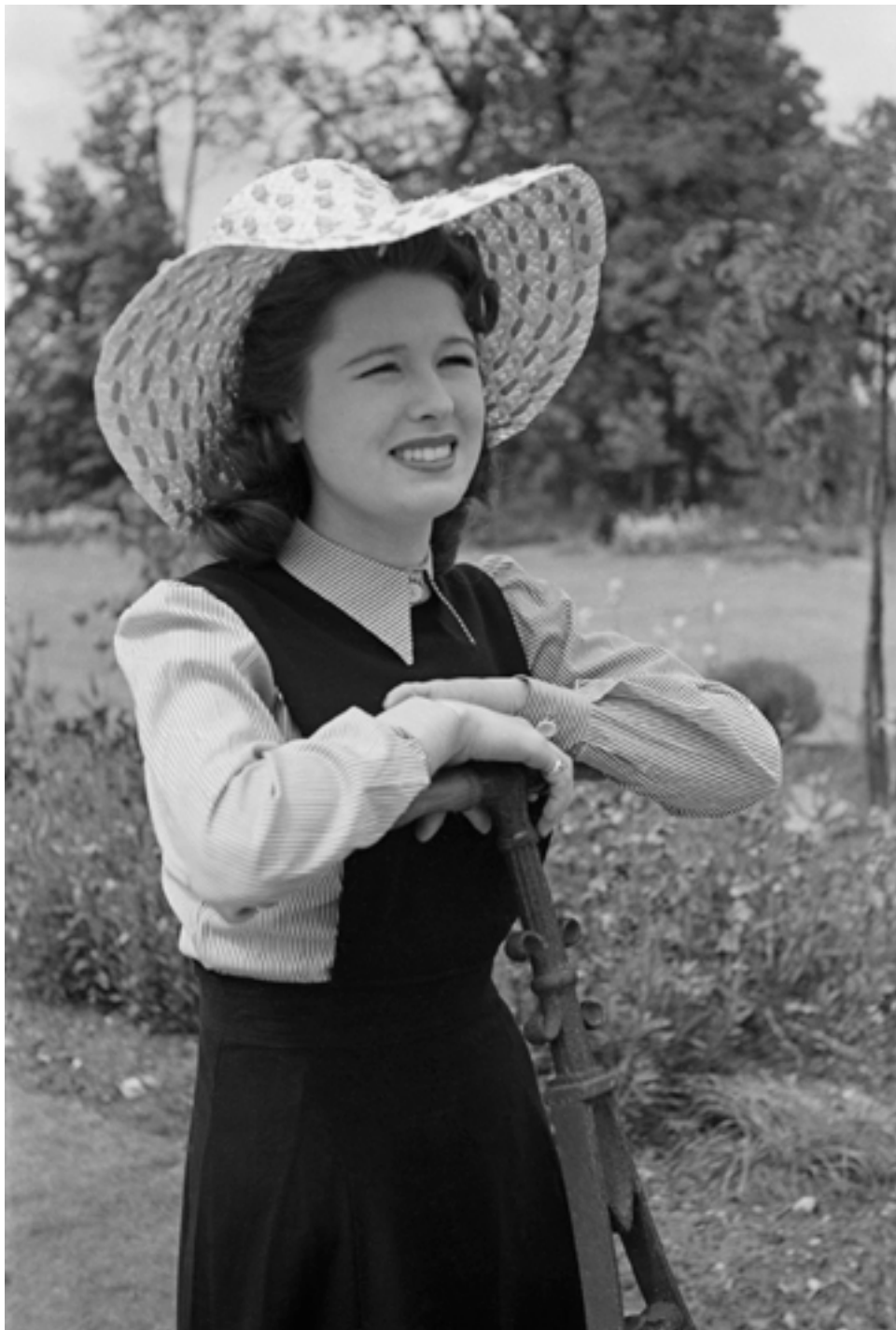
Figure 42 'The Pinnie Dress: A pinafore dress, a striped, stiff-collared blouse. From Fenwick. The frock is navy wool, 69s. 6d. 8 coupons'. 'Clothes for a Coupon Summer'. Picture Post, 5 July 1941, p. 26.