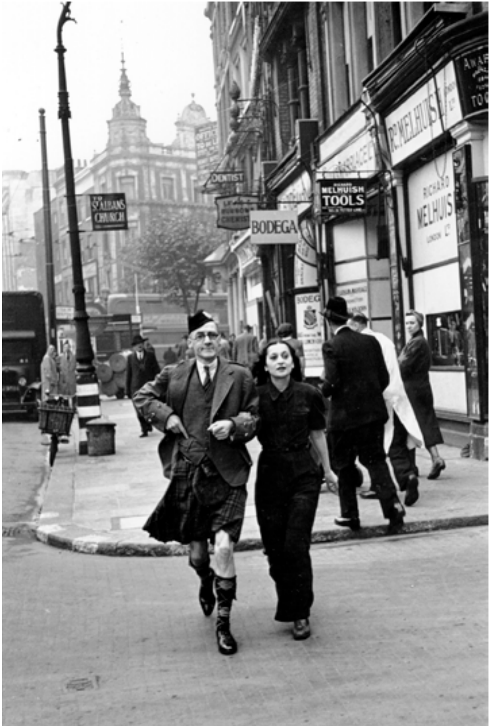
Figure 46 'Our photographer went out to snap women in trousers. He got this couple first shot'. From 'Should Women Wear Trousers?' Picture Post , 1 November 1941, p. 22. Burt Hardy/ Picture Post /Getty Images (2637107).