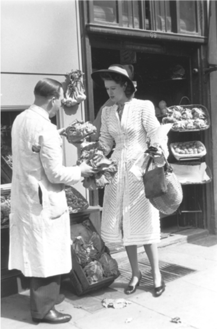
Figure 59 'The Bedsread She Sleeps Under at Night becomes the Coat She Wears in the day: Any bedspreads you don't use? Here's an idea for making a gay coat from a spread of white candlewick – that lovely washable tufted material. Cut from any paper pattern; but be sure to cut so that the borders run round the front and hem of your coat.' From 'Old Clothes Make News', Picture Post , 26 July 1941, p. 26. Zoltan Glass/ Picture Post /Getty Images (2696570).