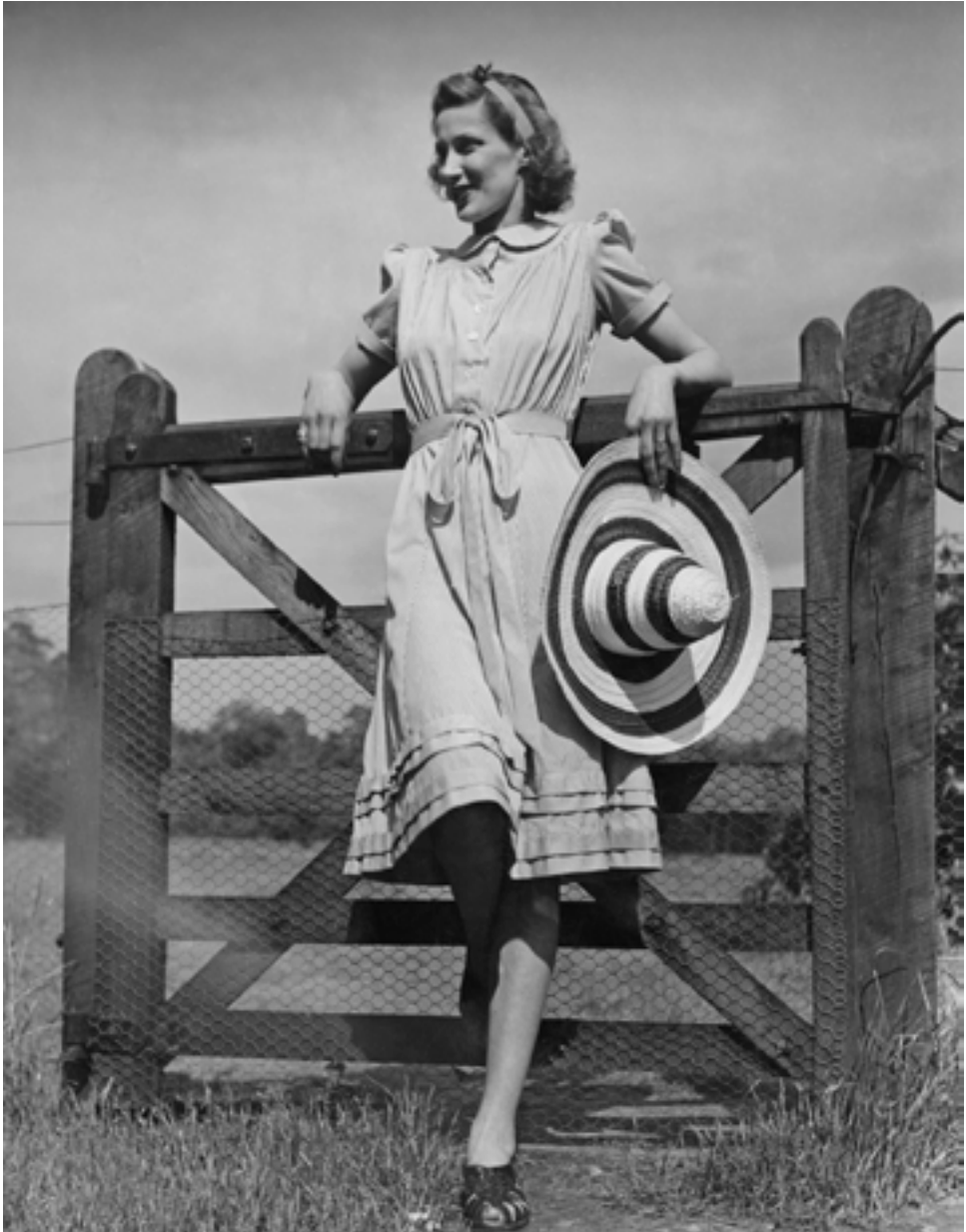
Figure 44 'Alice-in-Wonderland. Glamorous in a striped cotton "Alice" frock with stiff collar, full skirt. 4 guineas, 7 coupons. Bourne & Hollingsworth.' 'Clothes for a Coupon Summer', Picture Post, 5 July 1941, p. 27.