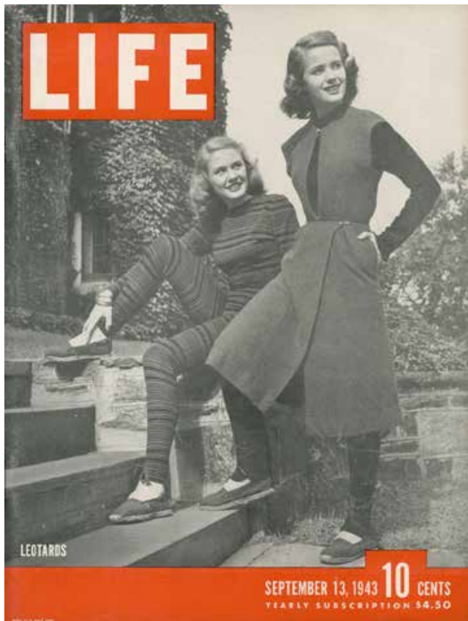
Figure 53 Life Magazine Cover, 13 September 1943.