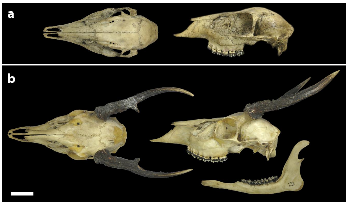
FIGURE 1. Specimens of Odocoileus virginianus that represent new records for the species in Brazil. a. UFMG 4334, female from Vila Cachoeira de Santo Antônio do Jari, Laranjal do Jari, Amapá, Brazil (-0.652111, -52.501083); b. UFMG 6087, male from Parque Nacional do Viruá, Roraima, Brazil (1.290806, -61.151750). Scale bar = 50 mm.