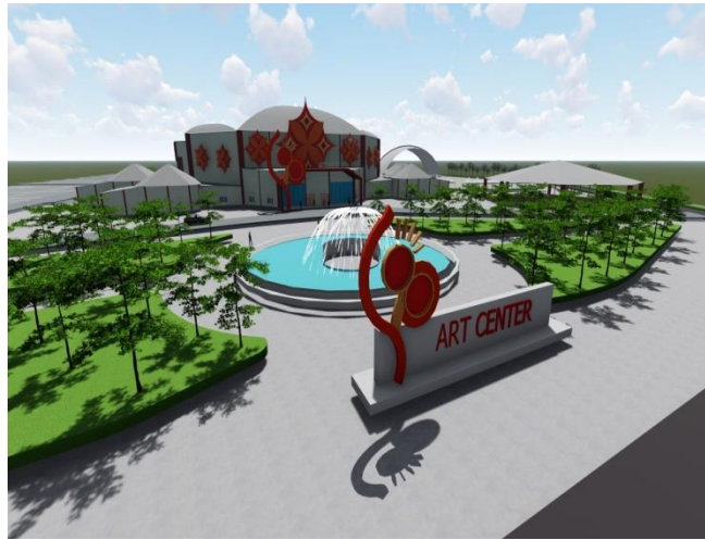
Figure 3. Building

The F8 Festival is a stage for citizen creativity, culture and innovation (Badriyah, 2019). In the future, this activity will continue until all funding for this event is borne by the private sector as the sponsor. It is called F8 because there are 8 things that are presented in this festival, starting from Fusion Music, Fashion, Film, Fine Art, Fiction Writers & Fonts, Food & Fruit, Folk and Flora & Fauna. Everything raises things that are traditional or local specialties. the location of this f8 every year can be different as well as the theme used every year must be different. The need for an art forum in Byblos, not only, the arts and culture in Byblos are experiencing a slump. The sluggishness of local arts in this area is similar to the spinning wheel of our economy, which is increasingly unsteady. Seeing this condition, the artists or cultural observers from gathering to express tips to deal with this sluggishness.