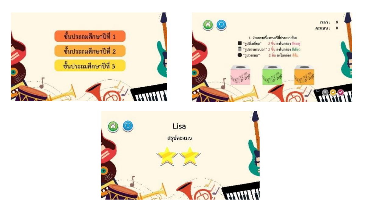
Figure 5. Interactive program