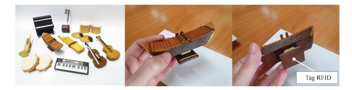
Figure 4. Musical instrument tags