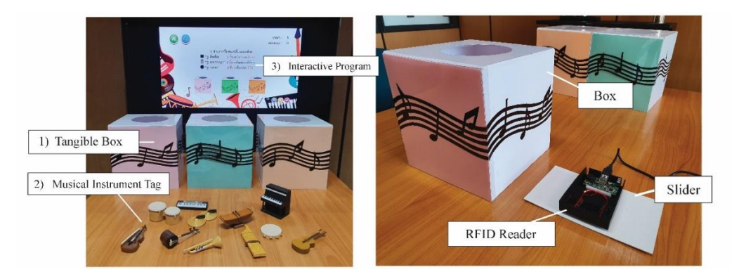
Figure 3. Tang-MI equipment set