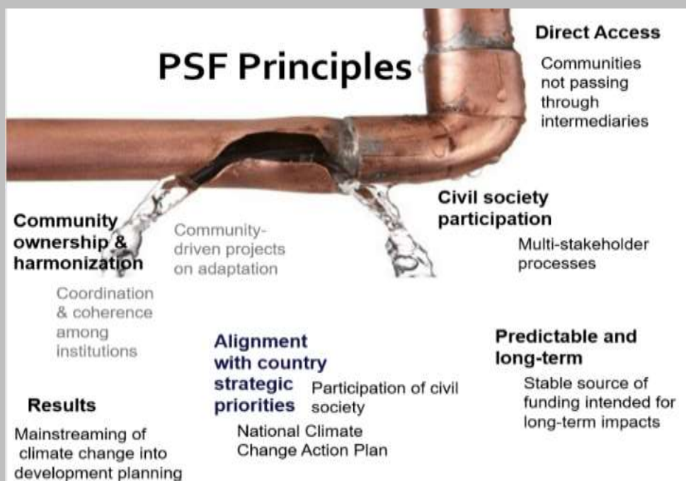
Figure 2. People’s Survival Fund Principles

From 2012-2018, (see table 1 below), only four (4) applicants qualified for the grant, with a total appropriation of 1.92 million out of the allotted 1 billion or almost a measly 20 percent of the total amount budgeted by the Philippine Congress. This made the Philippine Congress declare that because of low utilization of the fund, they will not put any more funds into the project. The Congress members believe that the fund has become stagnant and is not put into something useful, thus, the halting of its budget allocation.