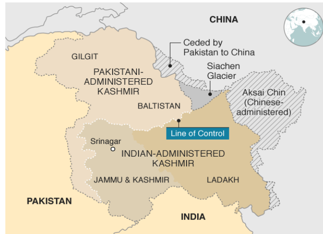
Figure 2. Kashmir territories profile