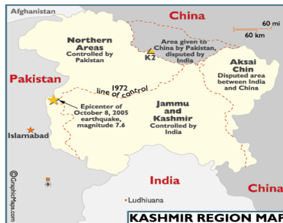
Figure 3. Kashmir Region