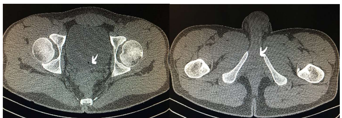
Figure 2. Pelvic computed tomography revealed non-spesific findings like circular structures in air density (white arrows).