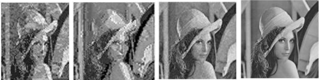
(e) for Eb/No 1dB