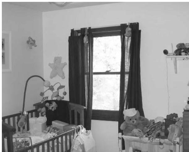
Figure 2 A double hung window in a child's bedroom.