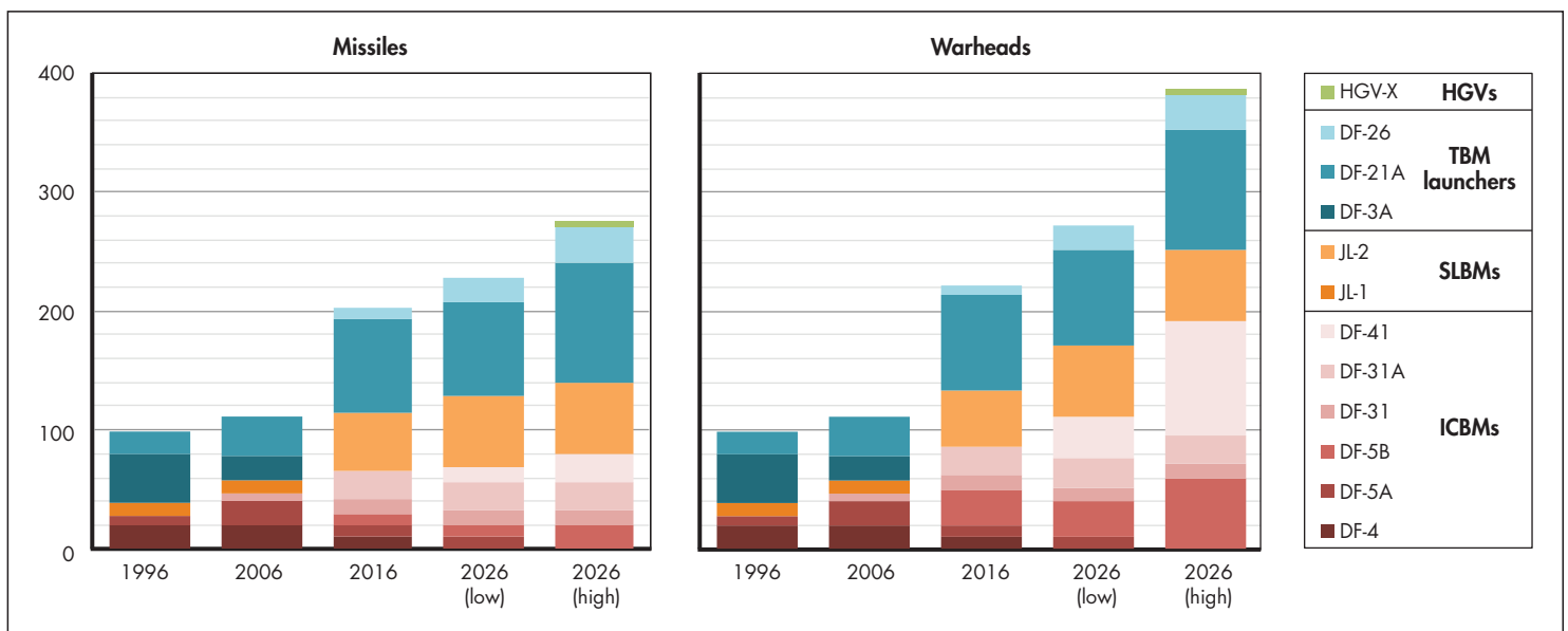
Figure 1. China's Strategic Missiles and Warheads

this trend over the coming decade. This brief focuses on three internal factors that could influence China's nuclear direction: (1) a gradual shift from direct political control of nuclear policy to involvement by more-bureaucratic actors, (2) an increase in the size and status of the nuclear constituency within the