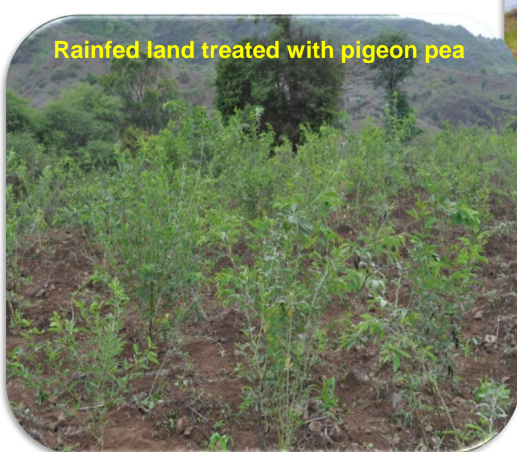
Rainfed land treated with pigeon pea