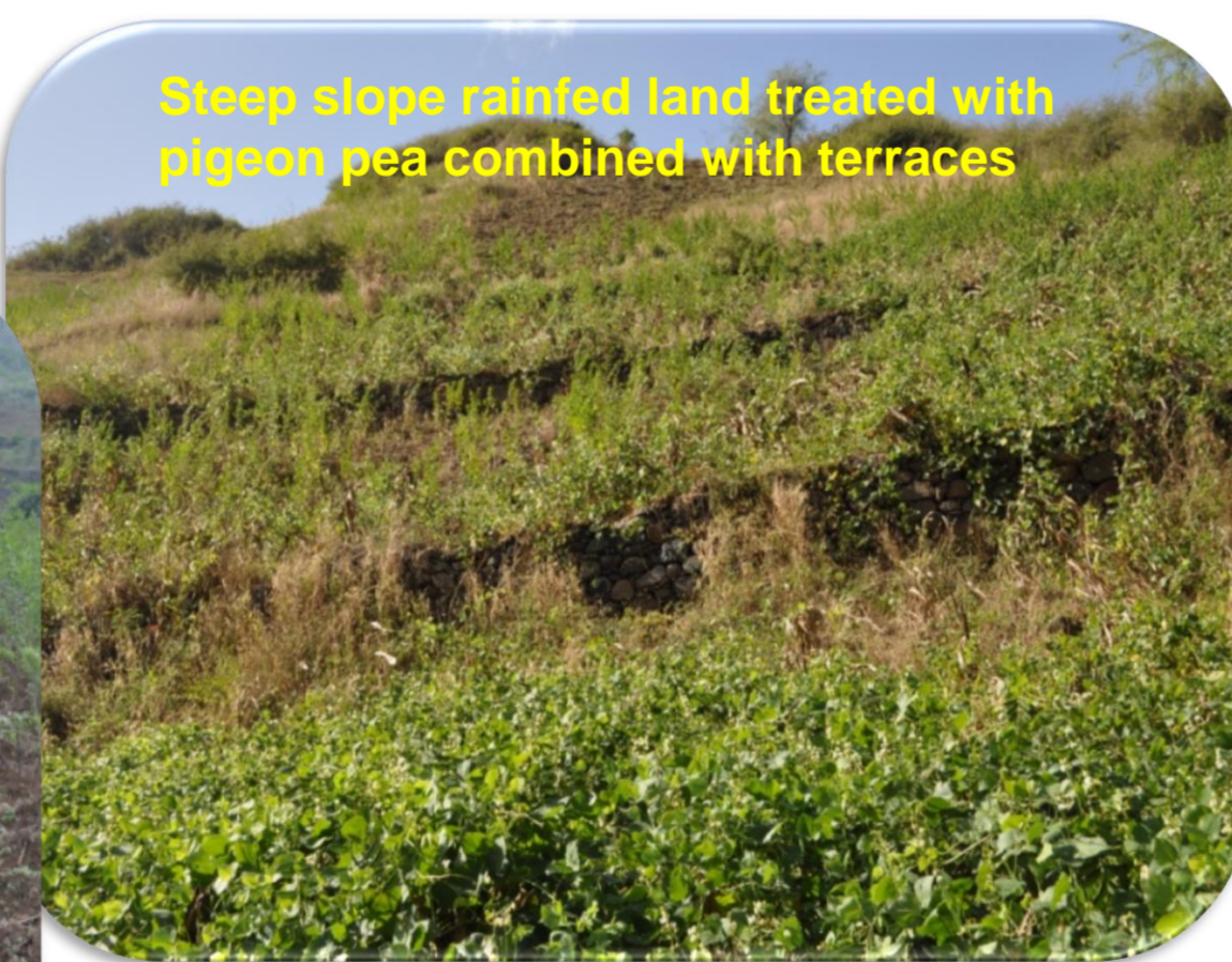
Steep slope rainfed land treated with pigeon pea combined with terraces