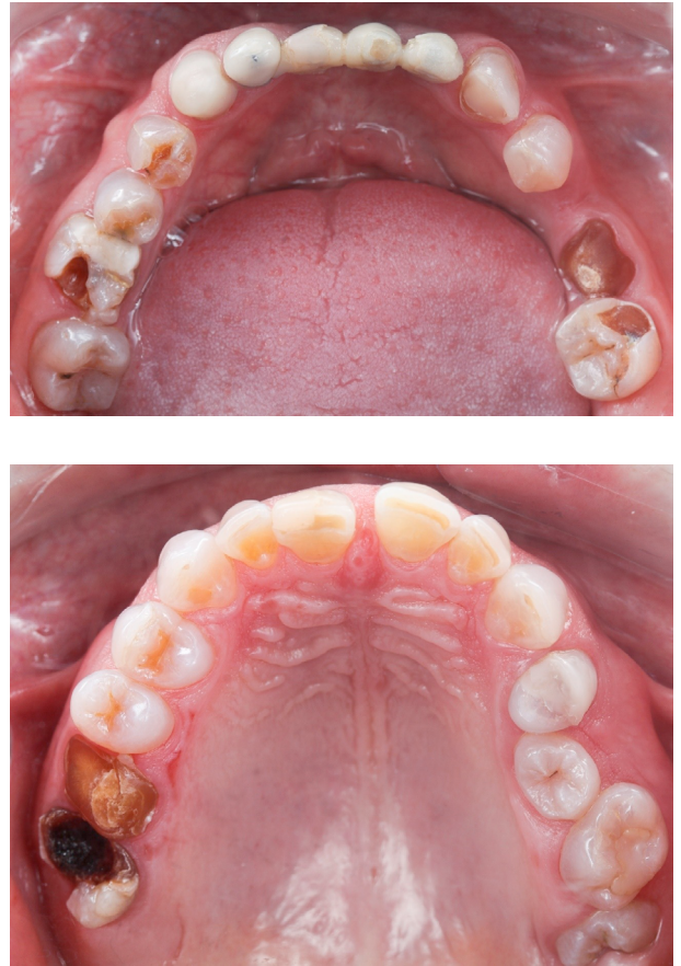
FIGURE 3 | Occlusal view of patient's teeth

Periodontal probing did not reveal a significant probing depth and clinical attachment loss. Teeth 32, 31, and 41 were absent and implants were installed in these regions. Root rest was found on tooth 36, as well as unsatisfactory restorations on teeth 17, 14, 21, 27, 46, and a maladaptive crown on tooth 42. The patient suffered from low self-esteem and shame when speaking and smiling.