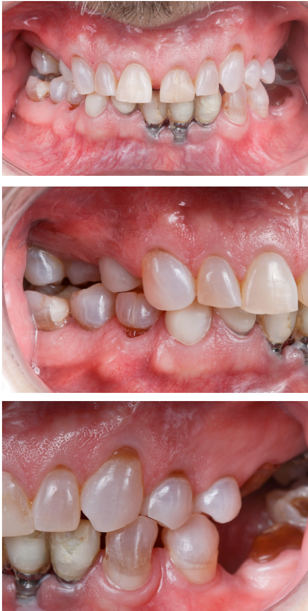
FIGURE 2 | Figure 2A: Buccal view; Figure 2B: Lateral view (right); Figure 2C: Lateral view (left)

Clinical examination found that the teeth had a brownish color, with advanced wear of the dental enamel and exposure of the dentin to several teeth (Figures 2A to 2C and 3).