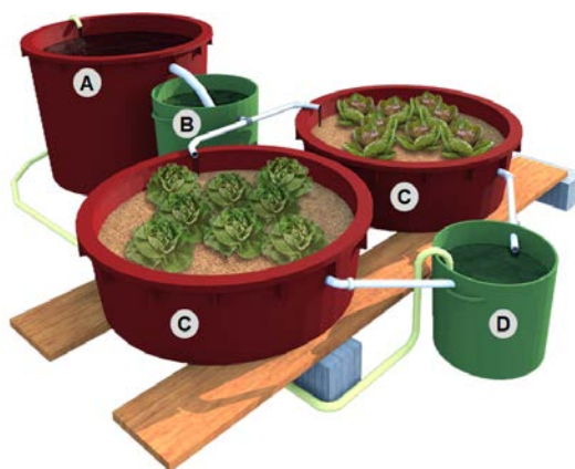
Figure 1 Rendering of the aquaponic unit. A, main tank for fish (500 L); B, settling vessel (100 L); C, tanks for vegetables/biofilters (275 L); D, storage tank for water collection (50 L) and pumping to A tank

The experimental system was located at the experimental farm of the University of Padova, North-East Italy (45°20'N, 11°57'E, 6 m a.s.l.), inside a plastic greenhouse. It consisted of 8 independent units (Figure 1), 4 of which containing fish at low initial stocking density (LD, 4.23 kg m -3 ) and 4 with fish at initial moderate stocking density (MD, 8.05 kg m -3 ).