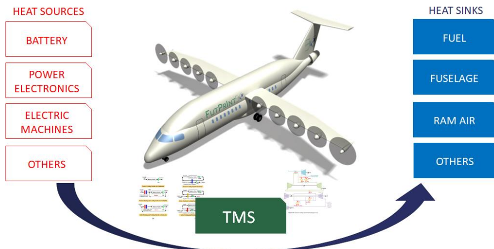
Figure 2. The role of TMS in aircraft.