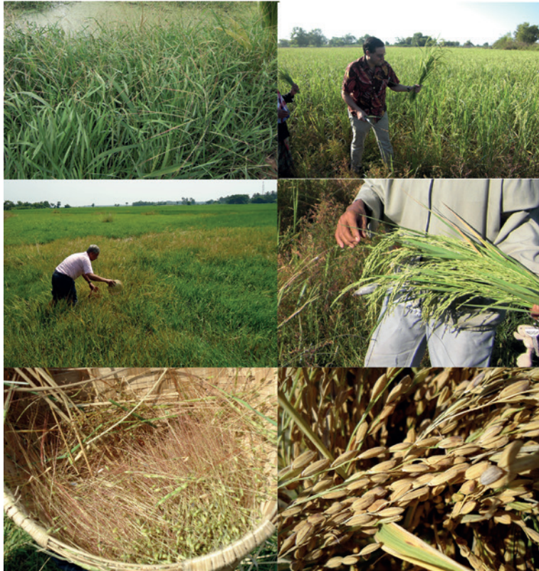
Figure 2 A comparison of wild rice (left) and domesticated rice (right). In the top row is a comparison of the spreading habit and panicle of wild rice with the erect growth of the crop. In the second row, basket harvest experiments of wild rice can be contrasted with traditional sickle harvesting to the right. The bottom row compares the yield from a few minutes of basket harvesting, including an immature example of wild rice, versus the pump, dense panicle of domesticated rice.

100 per cent. Before rice was domesticated, in terms of losing its natural seed dispersal, wild harvests would have included many unfilled or immature grains, while the transition to non-shattering allowed all these grains to stay on the plant until harvest, an estimated boost to returns of around 50 per cent. While all these traits evolved gradually