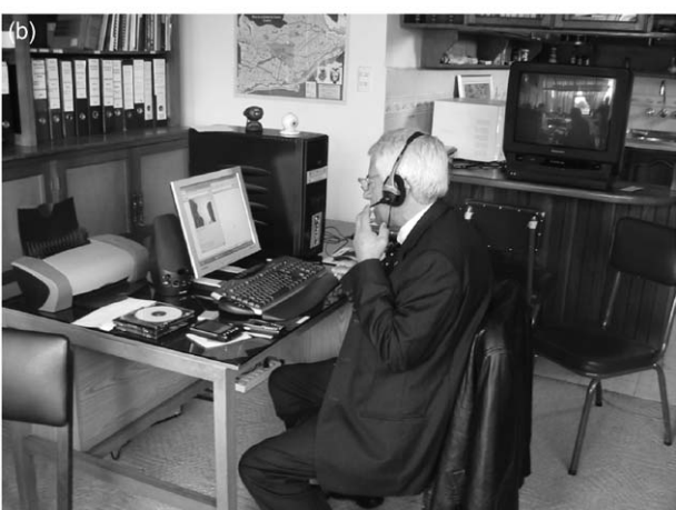
Figure 1 Telemedicine interaction between doctors at (a) remote sites and (b) Cinterandes HQ