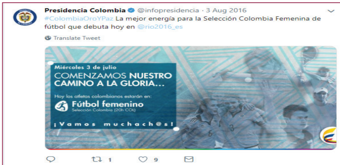
Picture 4 - Colombian women's national football team who debut in Rio2016