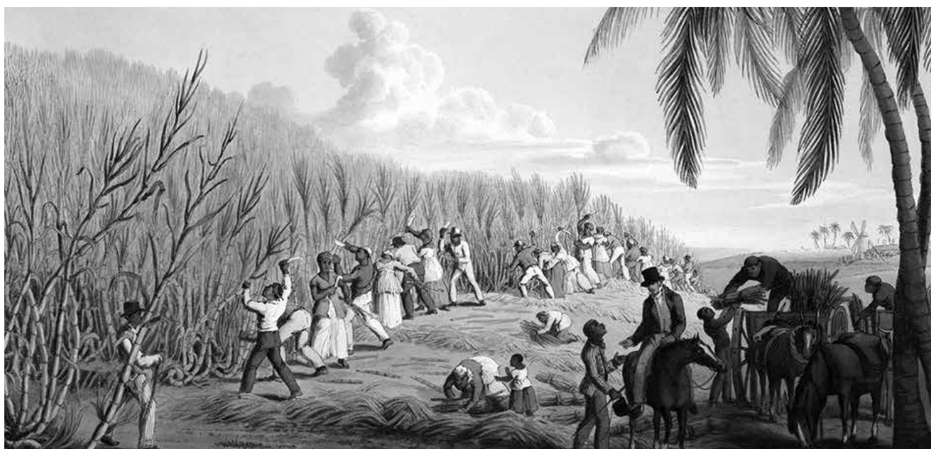
Slaves cutting the sugar cane, Antigua (from William Clark, Ten Views in the Island of Antigua , 1823)