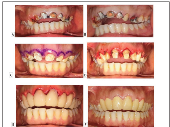
Figure-2: Crown lengthening surgery. A,B : Frontal and lateral profiles after prosthetic disassembly. C: Soft tissue marking prior to surgery, D: Post crown-lengthening, E: Temporisation after crown lengthening, F: Soft tissue healing after three months.

A: Facial frontal and lateral profile, B: Occlusion frontal and lateral profiles, C: Incisal overjet and overbite, D: Preoperative panoramic Radiograph.