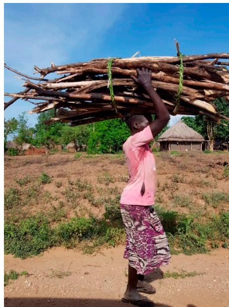
Figure 5. Woman carrying firewood for selling or cooking in refugee settlement in northern Uganda (E. Grosrenaud, 2018).