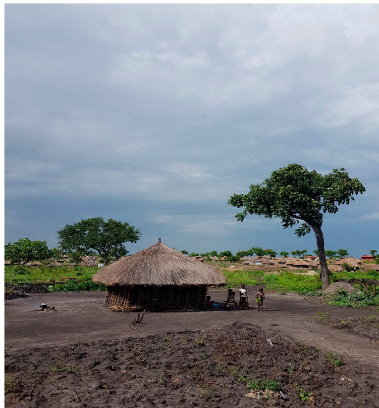
Figure 2. Rhino Camp, Refugee household.

in the Rift Valley to 788 m. Rhino Camp has 123,243 registered refugees and covers an area of 85 km 2 . The Rhino Camp project area lies inside the shallow Albertine rift. The Anyau River to the north and the Arua-Rhino Camp main road to the south form the borders of the settlement. Rhino Camp has six zones: Eden, Siripi, Ofua, Tika, Ocea, Tika and Odobu. The settlements are governed by the Office of the Prime Minister (OPM) for refugee operations and monitored by UNHCR. OPM oversees issues regarding land, including allocations, legal matters, and enforces laws. The role of UNHCR is to monitor and support programmes implemented in the settlements. There are several agencies, local and international, that work within the settlements in various sectors, including Water, Sanitation and Hygiene (WASH), Safe Access to Fuel and Energy (SAFE), Livelihoods, Environment and Education.