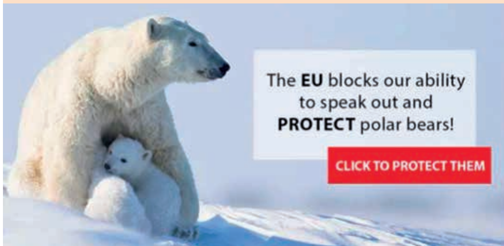
One of the ‘dark ads’ produced and targeted for Vote Leave during the EU referendum campaign in 2016. 75

Creating, testing and targeting such ads was one of the things that AIQ was doing for Vote Leave and associated groups during the EU referendum campaign. An example is shown below: a Facebook ad aimed at people who had shown environmental interests. Others were tailored to audiences whose profiles suggested they might be concerned by immigration. Vote Leave’s campaign director Dominic Cummings estimates that the campaign ran around one billion targeted ads in the run up to the vote, mostly via Facebook. 74