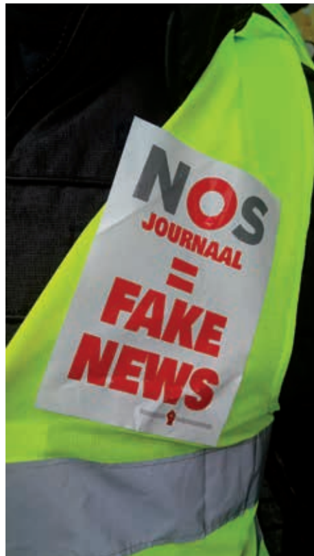
A protestor of the 'Gele Vestjes' (Yellow jackets) denouncing the NOS news broadcasting channel as 'Fake news' in the city of Groningen.

Even as the Grand Committee was deliberating, the destructive power of fake news spread by social media was dramatically illustrated once again when the so-called Gilets Jaunes (Yellow Jackets) unleashed a wave of mob violence on the streets of Paris and other French cities. Their actions had been organised almost entirely via Facebook pages, and the inchoate anger that fuelled them had been stoked in large part via fake news in the form of memes and viral videos. 5