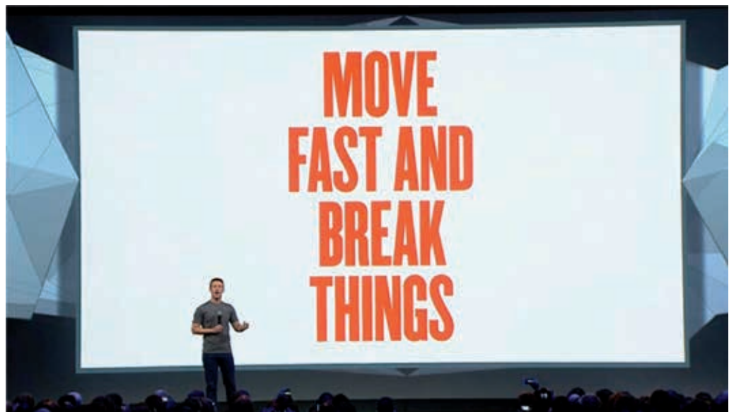
'Move fast and break things' was Facebook's motto for developers working on its platform until 2014.

Two other developments in 2007 were critical to the company's exponential growth – and to the abuses of personal data for which it was to become notorious. One was the launch of Facebook's application programming interface (API); the other was a move towards forming data-sharing partnerships with device manufacturers, eventually including Apple, Amazon, BlackBerry, Microsoft and Samsung (the true nature of these partnerships was not publicly reported till 2018). 9