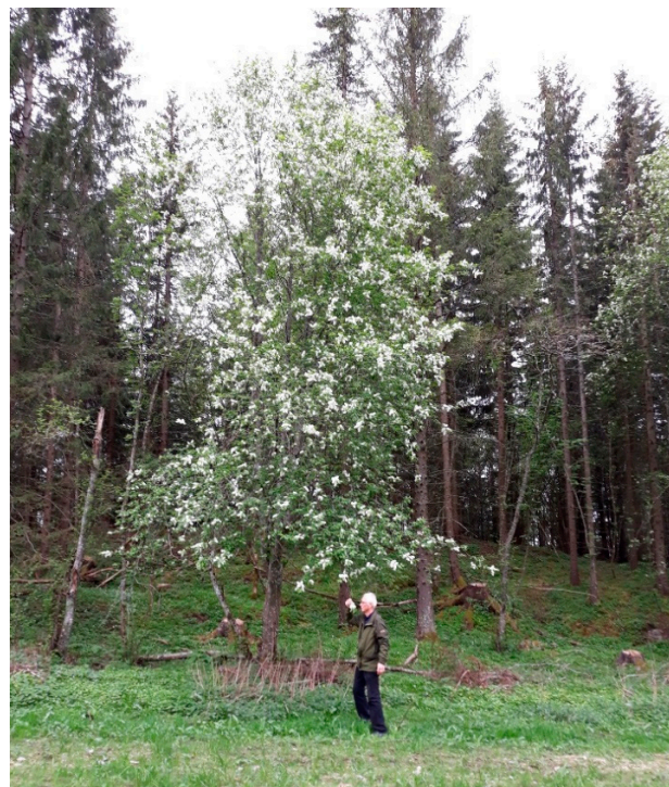
Figure 2. Flowering solitary tree of Prunus padus L. at a forest edge in Stjørdal municipality in mid-Norway, 21 May 2019. The tree is 10–12 m high and the trunk diameter at chest height is 29 cm.

P. padus is a tree or a bush (2–14 m) which develops a stone fruit, black in color when ripe. The species belongs to subgenus Padus in the genus Prunus L. ( Rosacea ) (Figure 2). The polyphyly of Prunus subgenus Padus and position within the Padus group has been thoroughly studied, but it is complicated. In 2016, P. padus L. was placed in the polyploid Racemosa group in subgenus Padus [10–12].