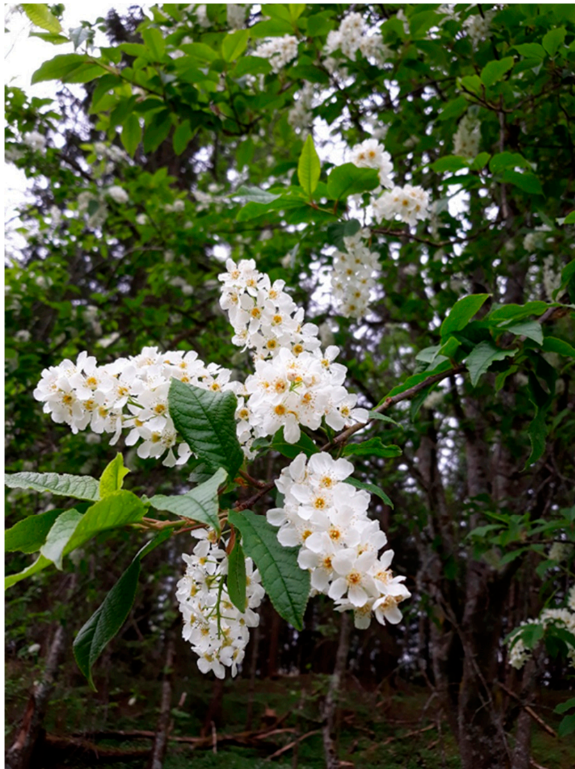
Figure 3. Racemes, leaves and shoots of Prunus padus ssp. padus L. with open flowers.

The twigs of P. padus ssp. padus are dull deep brown with pale markings. Its shoots are hairy when young but become hairless with age. The leaves are oval and hairless. The edges have fine, sharp serrations, with pointed tips and two glands on the stalk leaf base. The tree is a hermaphrodite. Bisexual flowers in racemes appear after the sprouting of leaves (April–June), and provide an early source of nectar and pollen for bees (Figure 3). The flowers are strongly scented, white and normally have five petals, and measure 6–15 mm across and are protogynous, while subspecies borealis has leaves with short hairs, the flower clusters are generally upright and few, and the flowers have no smell [3,6,9,13,14].