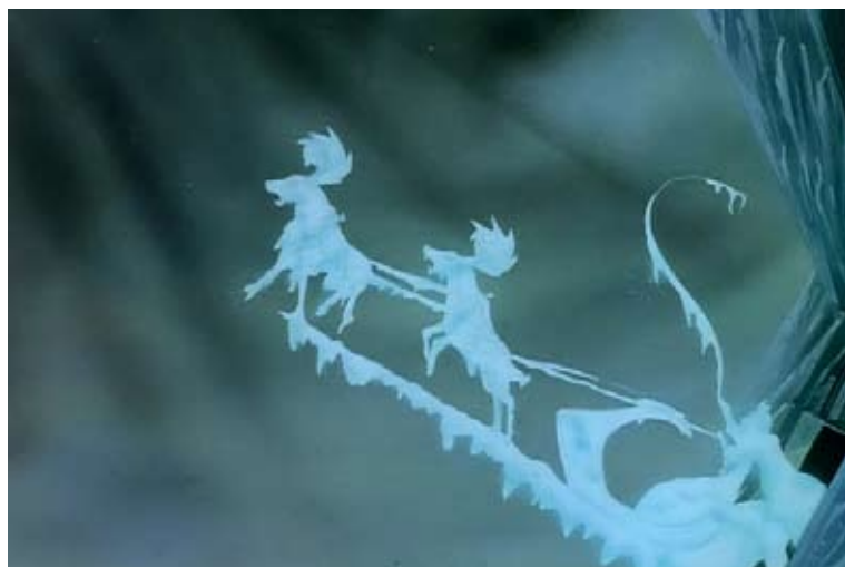
Fig. 7. A frame from “The Snow Queen” cartoon, 1995

daughter of the woman gang-leader wants Ellie to be in her service; the Laplander girl Frida teaches reindeer in the summer school (which are drawn as dogs but with horns and hoofs) and goes with Ellie to the Palace of the Snow Queen; she prepares poison to vanquish the mirror. A new character appears, the sparrow Peeps, which performs the functions of a magic friend. The woman who performs magic, changed a lot. In the 1995 cartoon it is a witch with a hooked nose, warts on her hands, without teeth, with long nails, she has a skull in her house. The witch makes the elixir of life, to finish which she needs a heart of a little girl. That is why she needs Ellie. In her speech the witch uses some words and phrases related to the historical background of the cartoon: thus, she makes research experiments using chemicals; teaching at the reindeer school is based on theory and research, for example, the flight paths are studied.