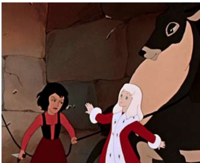
Fig. 3. A frame from "The Snow Queen" cartoon, 1957