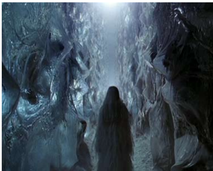
Fig. 8. A frame from "The Snow Queen" film, 2002

of which (interpreted by the Christian mythology) were more likely the basis for H.C. Andersen's tale.