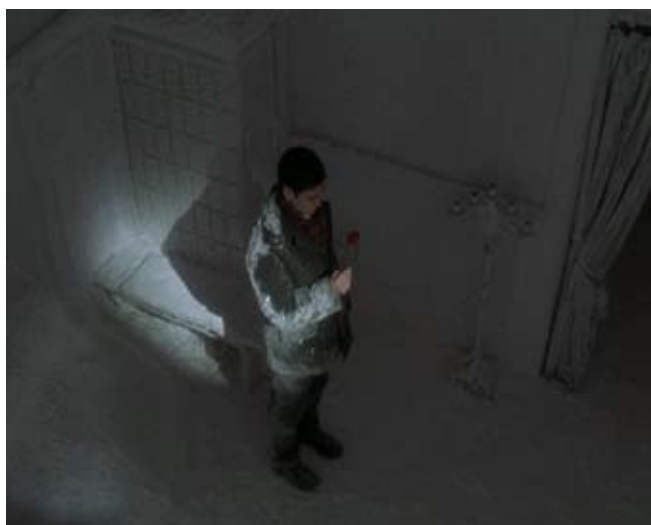
Fig. 10. A frame from "The Snow Queen" film, 2002