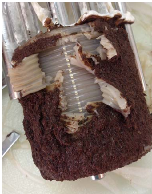
Fig. 2 Picture of an Irpex lacteus biofilm that has sequestered solid beechwood particles from the liquid phase (Brethauer et al. 2017)

The complex microbiome inside the rumen of ruminant animals enables the conversion of lignocellulosic biomass such as grasses or twigs to short chain fatty acids (SCFAs) and to microbial biomass as energy and protein sources for the hosts (Brulc et al. 2009). The rumen contains some of the most cellulolytic mesophilic microbes described from any habitat (Hess et al. 2011). Around two thirds of hay for example is degraded in the digestive tracts of cows (Ineichen et al. 2019). In the rumen, the majority of the microorganisms—around 70%—are attached to the solid feed particles and live in a biofilm (Weimer et al. 2009; Mason and Stuckey 2016; Akin and Rigsby 1985). These complex communities are dominated by bacteria, but anaerobic fungi, archaea, protists, and viruses also contribute critical functions to the communities (Leng 2017). A vast majority of rumen species are not yet culturable, but culture-independent omics studies allowed to gain insight into the community composition and function (Chaucheyras-Durand and Ossa 2014). It is estimated that 7000 different bacterial species and 1500 archaea exist in rumen environments with Firmicutes (mainly Clostridia ), Bacteroidetes , and Proteobacteria being the most common