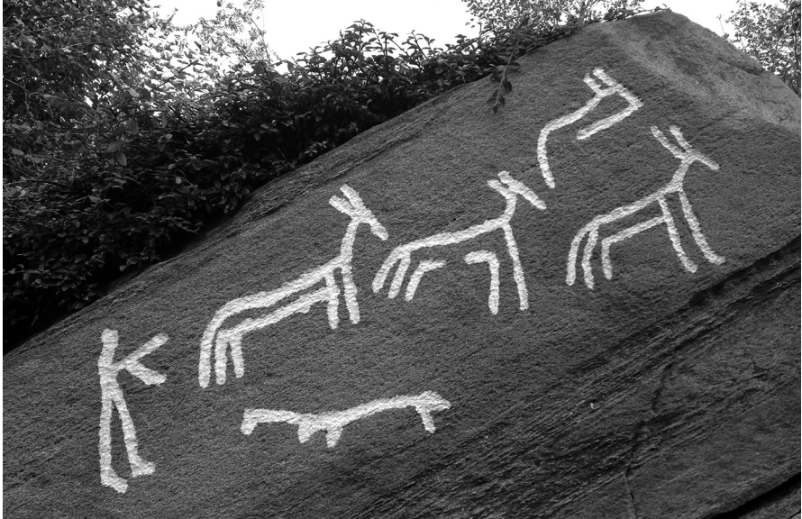
Figure 4. The herding scene from Valhaug, Norway.

Bronze Age rock carving from Hamn Kville in Bohuslän (Fredsjö 1969:117, bild 43). Here, two dogs form dyads with their respective humans as they stand between two archers, pairs of men and dogs face and oppose each other in a manner that could be interpreted as hostile.