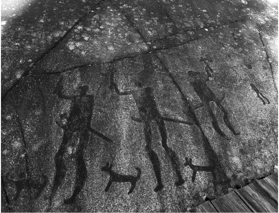
Figure 2. Fosssum in Tanum, Sweden, panel with dogs and humans.

pects to rock art: one is that the rock carvers presumably portrayed the world around them, what they observed and knew. From this perspective, rock art is peopled by many kinds of beings. The other aspect of rock art goes beyond the individual; dogs also partake in the universe created on the rocks, which is perceived as loaded with mythological significance (e.g. Goldhahn 2006; Goldhahn et al. ed. 2010). Depicting dogs – and moreover a herding scene – in the cosmological sphere of rock carvings goes some way towards merging lived human-animal relationships and the choreography of herding with the realm of the otherworld. This adds both depth and a glimpse of different dimensions to be found in the images. However, the main focus here is on the unintended portrayal of beings – especially dogs – in a manner that discloses the role dogs had in society.