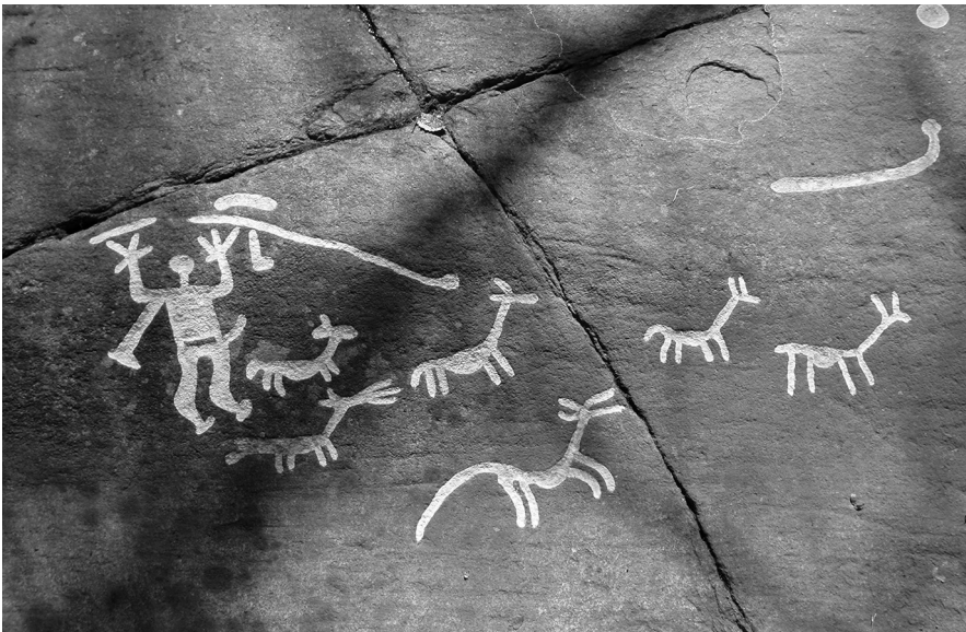
Figure 6. Herding scene from Brastad, Lysekil. A man carries a sword and holds a shepherd's crook. Close by are two dogs, one with an open mouth. The dogs and shepherd herd a flock of four animals.