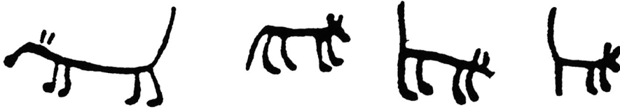
Figure 3. Dogs from Flote 1, Norway.