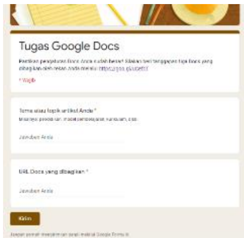
Picture 2. Google doc task for the participant

participants can use google docs to create new doc files, collaborate, and share in public. After this training session ended, the participants are given a task to know how far they understand the use of google docs.