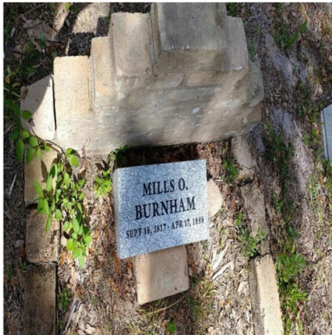
Grave #5: Mills O. Burnham (Marker & Coping)