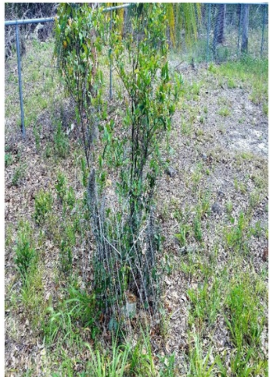
Grave #9: Unmarked Grave