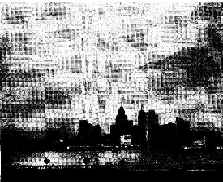
This view from Dieppe Park across the Detroit River in Windsor, Ontario, shows the skyline of modern Detroit.