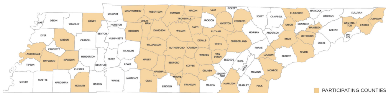
Figure 1. Map of Participating Tennessee Counties

Face masks in most counties benefited local hospitals, health care facilities, or emergency services agencies. A number of community partnerships were developed, with outreach extending to school food service workers, postal workers, nursing homes, corner stores, county government, churches, mental health facilities, and law enforcement.