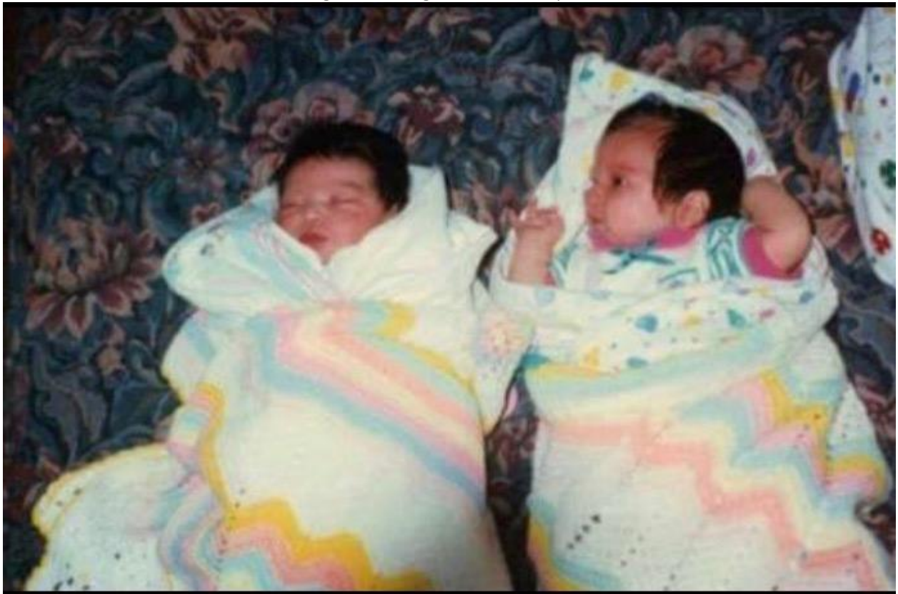
Figure 2: Angelika as a Baby

While she missed out on some critical aspects of being the daughter of Mexican immigrants such as learning Spanish, she did take part in many important traditions such as Ballet Folklórico. Reflecting on her identity as a child, she wrote,