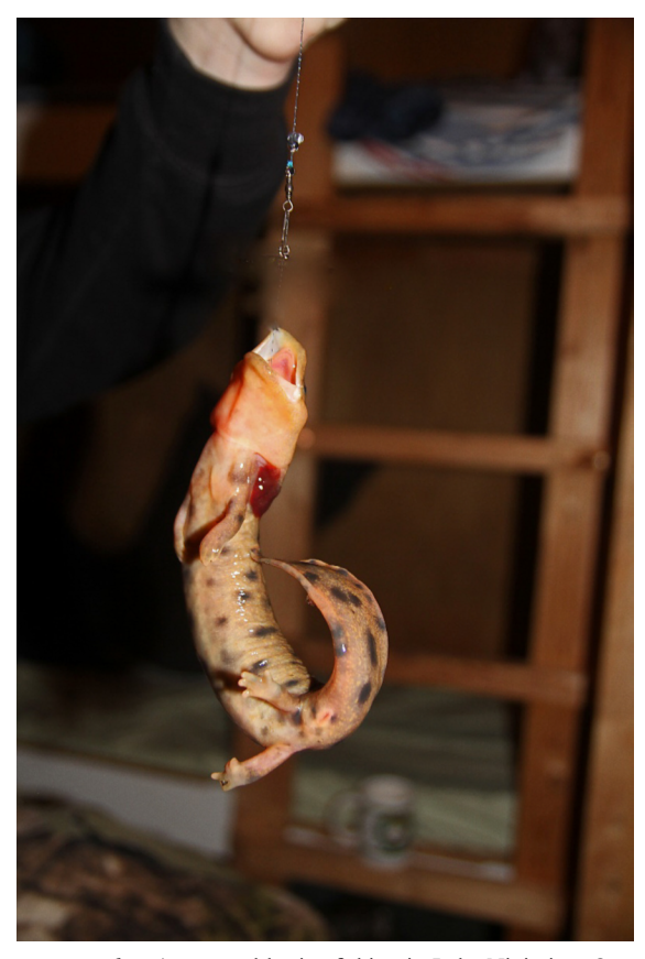
FIGURE 1. Mudpuppy ( Necturus maculosus ) captured by ice fishing in Lake Nipissing, Ontario, Canada. This individual was not included in the study, but is representative of the type of capture event investigated.