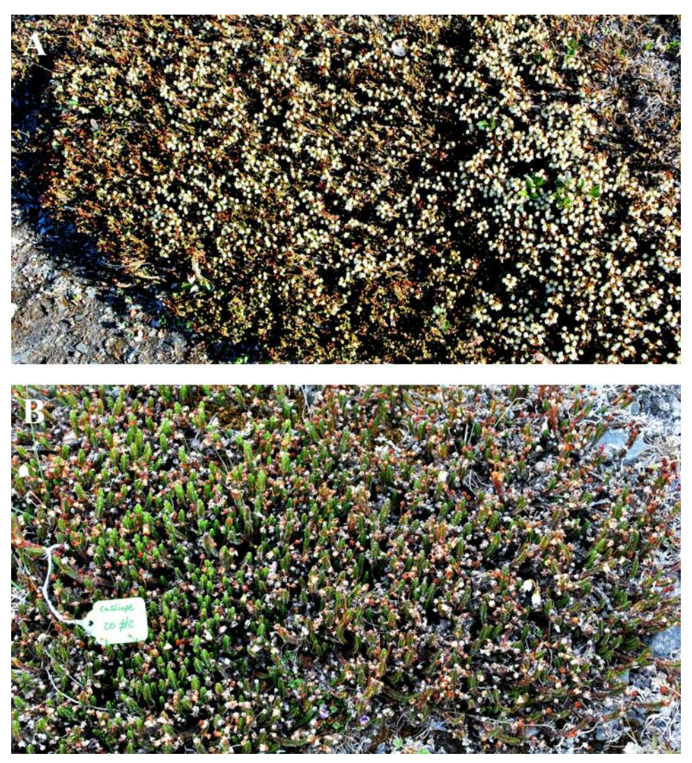
FIGURE 3. Cassiope tetragona (Arctic White Heather) in a northeast facing gully on McGill Mountain, Lake Hazen, Quttinirpaaq National Park, Ellesmere Island, Nunavut, Canada with over 300 flowers in 2013 (A) and with just three flowers in 2014 but over 100 flowers/fruits from 2013 still visible (B).