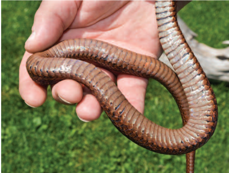
FIGURE 2. Underside of erythristic Maritime Garter Snake from Indian Brook IR 14, Hants County, Nova Scotia.

rather than yellow lateral stripes have been reported, and from Manitoba to British Columbia western subspecies of Thamnophis sirtalis have of red lateral barring on scales and skin which increases in extent to the west (Cook 1984; Rossman et al. 1996). None matches the overall erythristism reported here.