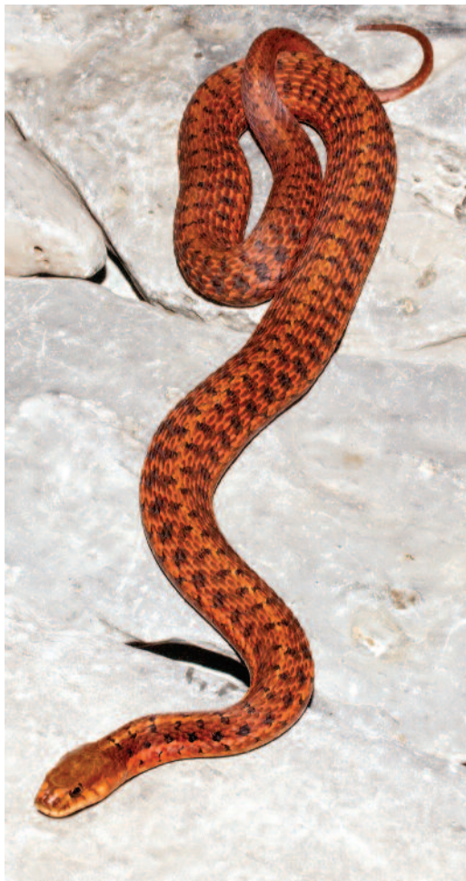
FIGURE 1. Erythristic adult female Maritime Garter Snake, Thamnophis sirtalis pallidulus , captured at West St. Andrews, Colchester County, Nova Scotia, on 7 July 2009.

Webster's Dictionary defines erythrism as a condition marked by exceptional prevalence of red pigmen-