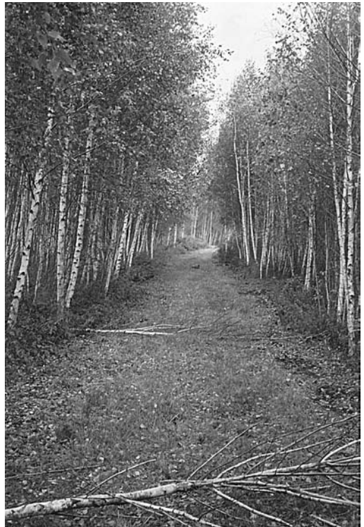
FIGURE 3. Betula pendula in the regenerating areas of Wainfleet Bog.

still exist in Wainfleet Bog. It is possible that restoration of the bog hydrology can be obtained by filling and dismantling these drainage ditches. However, this strategy is being initiated gradually as organisms such