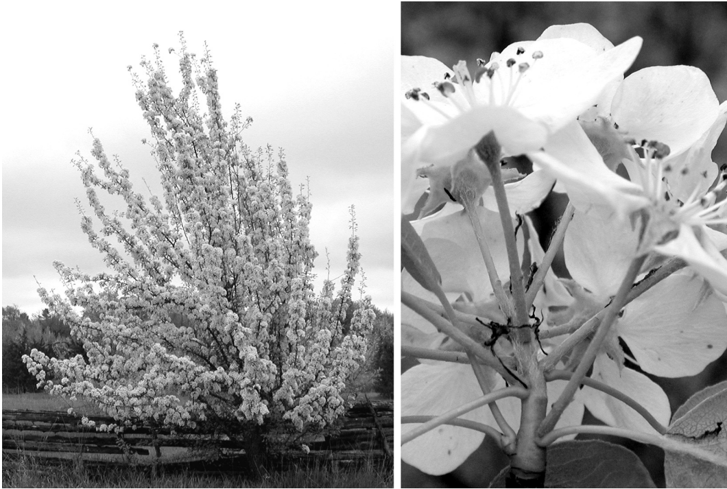
FIGURE 1. Common Pear ( Pyrus communis ) escaped from cultivation west of Trenton (at 44.18440°N, 76.7669°W), Ontario. A young tree with upright branches is shown on the left. On the right is a portion of an inflorescence showing the elongate main axis of the flower cluster. Photos by P. M. Catling, 13 May 2006.

some of the populations are very variable. On the northeast side of Kingston, where thousands of trees have invaded abandoned pasture, the individual trees have flowers with long reflexed sepals or short spreading sepals, some are thorny while others are not, some have leaves that retain pubescence on both surfaces (but particularly below) until well after flowering whereas others lose all pubescence before fully expanding. This variation is not surprising, given the likely diverse parentage of the trees producing the seeds. Some cultivars are believed to be partly of hybrid origin, including P. nivalis Jacq. and other related species (Bell 1990). Callery Pear ( Pyrus calleryana Decaisne) is becoming increasingly popular as an ornamental in Ontario. It has not yet been reported as an escape here, although it has become a troublesome escape further south (Nesom 2000; Vincent 2005). It is sold in Ontario nurseries north at least to Kingston. The likelihood of its escape in Ontario is suggested by the fact that it occurs as an escape in zone 6 in Michigan. This zone includes parts of Essex County in extreme southwestern Ontario (Vincent 2005). Pyrus calleryana has flowers with 2–3 styles instead of 5 as in P. communis . The fruit of P. calleryana is about 1 cm in diameter, globose, and blackish-brown with pale dots. The fruit of P. communis is 3–10 cm long, obovoid or pyriform, and yellowish without prominent pale dots.