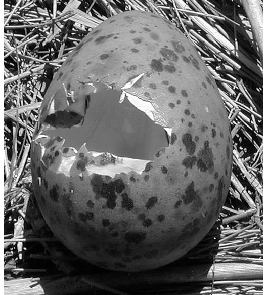
Figure 2. Lateral 'slice' made by the canine teeth of a Coyote to open a Great Black-backed Gull egg, Boot Island National Wildlife Area, Nova Scotia, 2004.

The gull colony on Boot Island National Wildlife Area has been declining in recent years with a near lin-