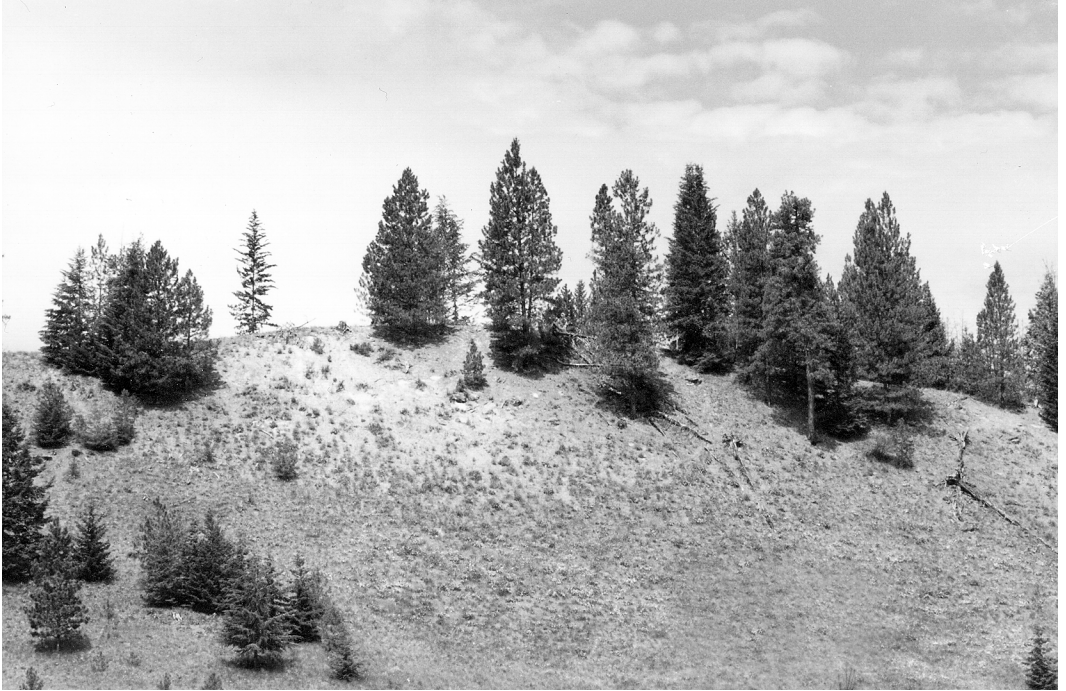
FIGURE 3. Collomia tenella habitat occurs on the eroded section near the top of this sandy ridge south of Princeton, British Columbia. Prominent trees on the ridge are Pseudotsuga menziesii and Pinus ponderosa .

kameen area. If brought into production, the drilling, access roads and pumping stations could cause extensive degradation to the natural habitat in the area.